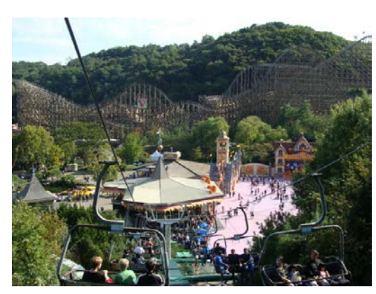
A full view of the T-Express

"It was so much fun. We went on fun rides and played and talked"