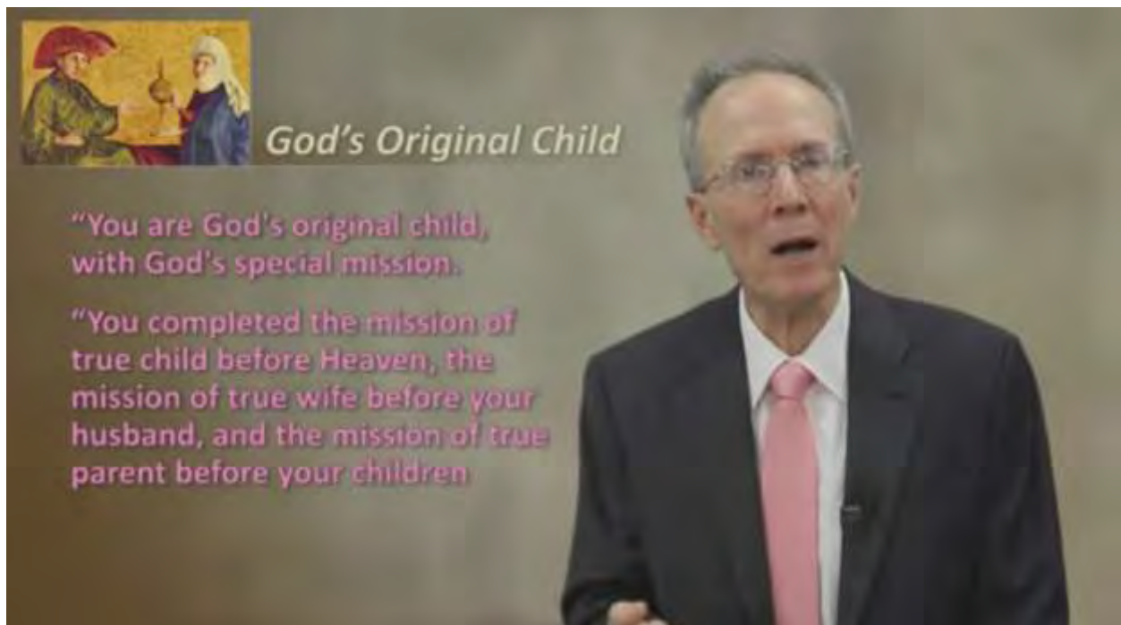
Caption: God's Original Child

Thus, Father knew that men, such as me, would not understand this for a long time, and so we need to be taught.