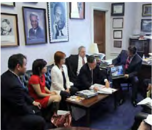
Briefing on Capitol Hill