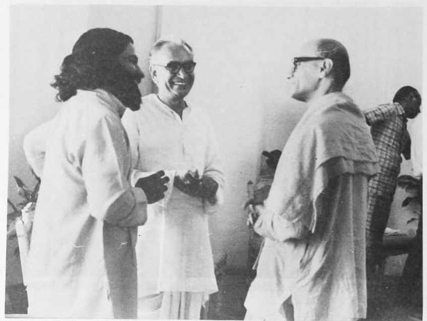
MYSORE: The Discussion continues over lunch, in a lighter vein.