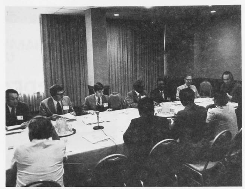
MIAMI: The Trustees meeting before the Inauguration.