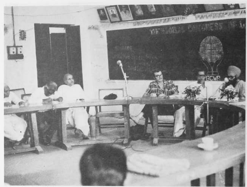
VARANASI: "Religion: Today and Tomorrow."