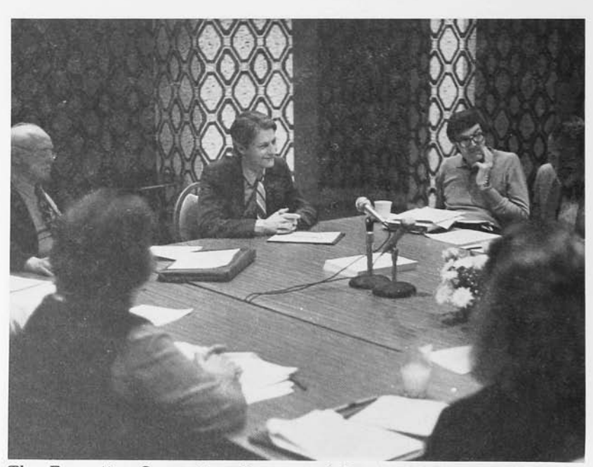
The Executive Committee Meeting of the GCWR in New York City, February, 1982.