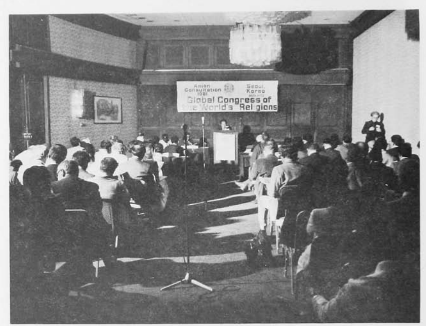
SEOUL: The audience on November 11, 1981.