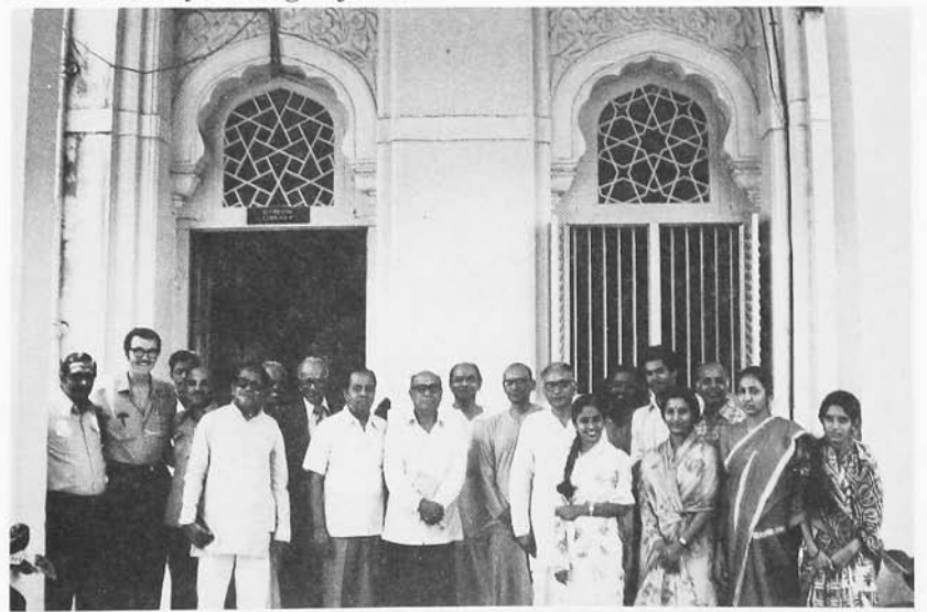
MYSORE: The Seminar Group photograph.