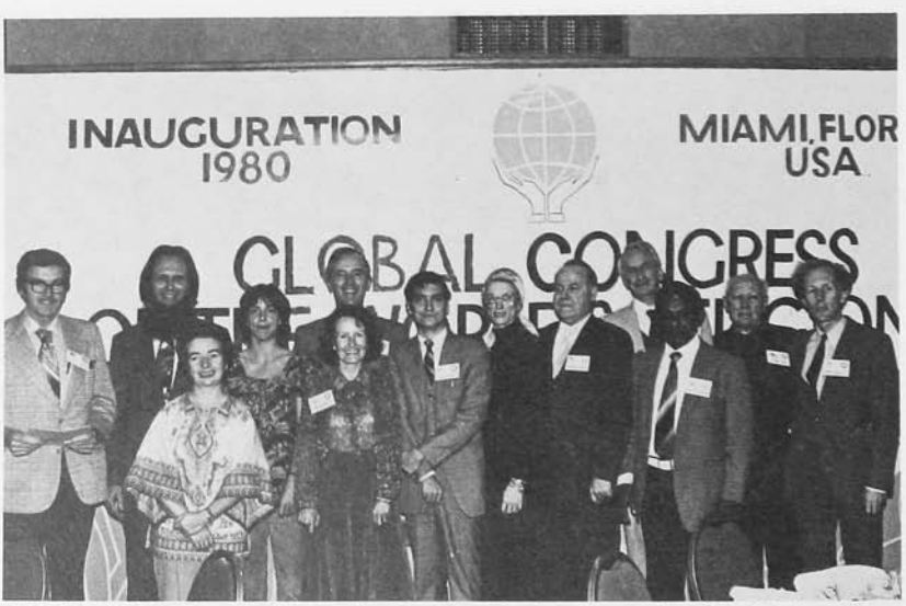
MIAMI: A high moment—after years of planning, the GCWR has been officially inaugurated.