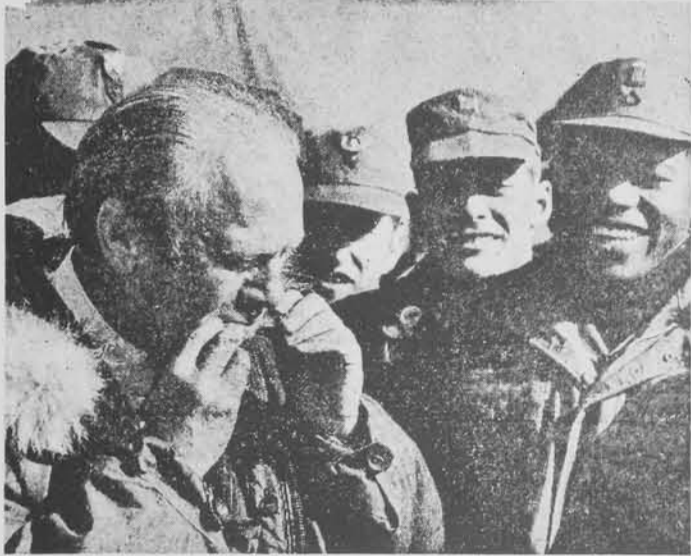
U.S. President Gerald R. Ford, surrounded by soldiers, munches a piece of fried chicken at an improvised mess hall at Camp Casey when he visited there yesterday.