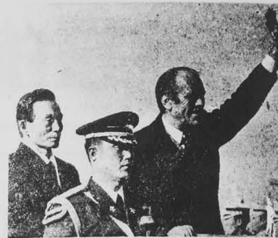
U.S. President Gerald Ford smiles and waves his left hand to Seoul citizens welcoming him while reviewing with President Park Chung-hee, left, an honor guard of the Korean Armed Forces at Kimpo International Airport upon President Ford's arrival here yesterday for his two-day state visit.

For the passage of the presidential motorcade, road traffic was totally cut off between the airport and the hotel. Many commuting citizens had to walk to their offices from 9 a.m. when the traffic cutoff took effect prematurely.