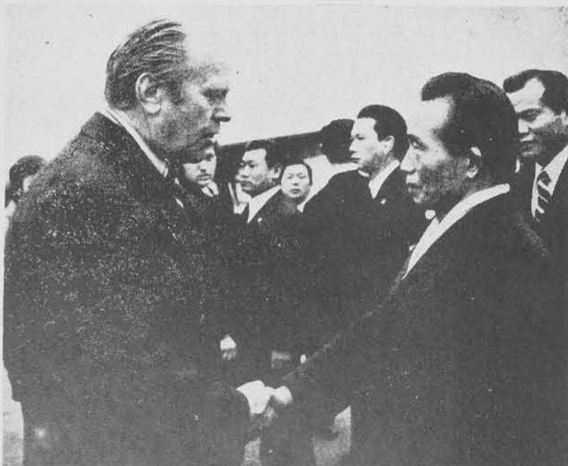
惜別의 악수나누는 兩國元首 「포오드」 대통령의 離韓하기 직전에 美 대통령과 朴 대통령의 악수를 나누고 있다.