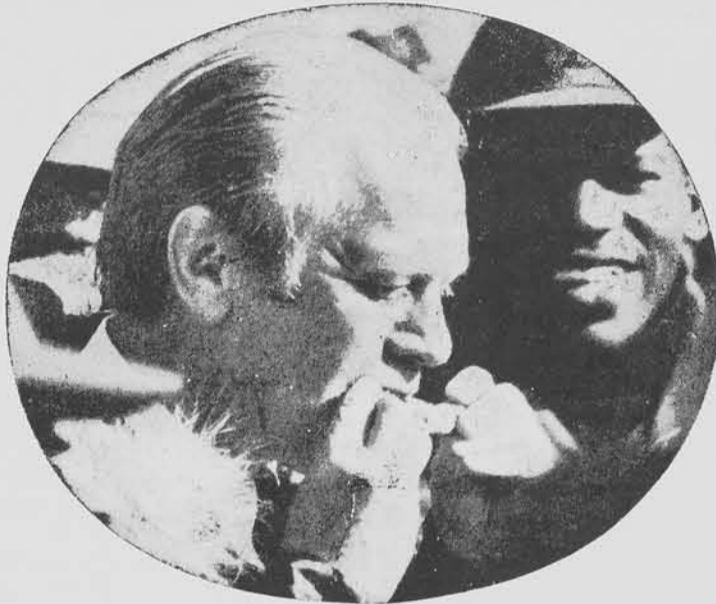
訪韓 첫 食事 미제 2사단을 방문한 「포오드」 美大統領이 야외에서 가진 점심식사에서 닭요리를 맛있게 먹고 있다. 옆에 흑인사병이 줄거로 모습으로 바라보고 있다. <미제 2사단에서 金順廉기자>