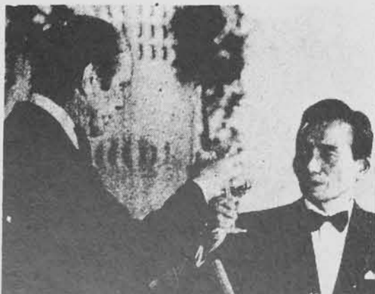
President Park Chung-hee, right, of Korea and Gerald R. Ford of the United States toast in a banquet the Korean Chief Executive gave in honor of his U.S. counterpart at the Capitol last night. The two leaders and other invited Korean and U.S. guests later viewed a Korean folk arts performance.