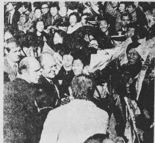
U.S. President Gerald R. Ford, center, surrounded by the crowd, shakes hands with young Seoul citizens near the entrance to the Chosun Hotel where he and his suite are staying on his way to the hotel from Kimpo International Airport yesterday.