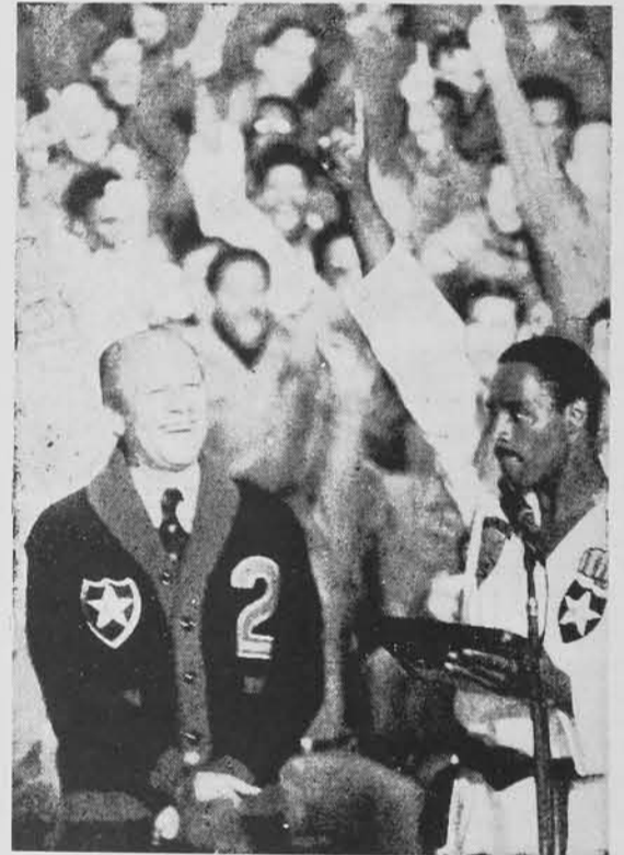
「우리大統領 최고」 미 2사단 실내체육관에서 태권도 시범을 관람한 「포오드」 대통령에게 장병들은 기념패를 전하면서 감지순가락을 높이들어 「우리대통령 최고」라고 환호성을 일러냈다.

沿道에 온 歡送人波 의 환호를 받으며 김대중(왼쪽)은 환영단 <세종대원>의 환영을 받는다.