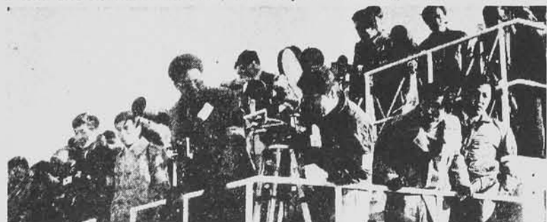
Scores of cameramen and their heavy equipment are positioned on a platform prepared for their coverage of the arrival of U.S. President Ford at the Kimpo International Airport yesterday.

The state dinner yesterday for visiting U.S. President Gerald R. Ford and his entourage was composed mostly of traditional Korean delicacies, such as "kujol pan," "sinsullo" and fried sliced fish.