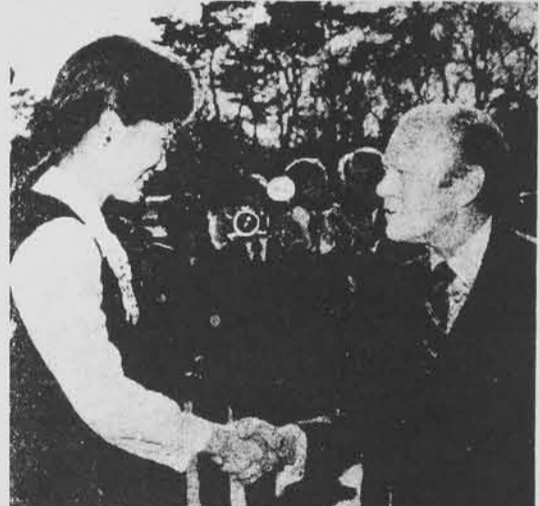
U.S. President Gerald R. Ford, right, is greeted by Miss Park Keun-hye, first daughter of President Park Chung-hee and hostess of Chong Wa Dae, yesterday when the U.S. Chief Executive arrived at the presidential mansion for the first of his summit meetings with Park.