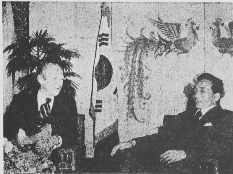
President Park Chung-hee, right, and U.S. President Gerald R. Ford wear smiles during their summit meeting dealing with a wide range of issues of mutual concern at Chong Wa Dae yesterday.

Touching on the current U.N. General Assembly consideration of the Korean question, the two Presidents agreed on the importance of favorable General Assembly action on the draft resolution introduced by the U.S. and other member