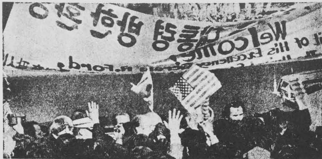
U.S. President Gerald Ford, seen below the Korean national flag at center, is almost enveloped in a crowd of citizens who extended their whole-hearted welcome to the

Following the summit talks, President Ford attended a reception and ensuing state dinner given by the Korean President in honor of the state guest.