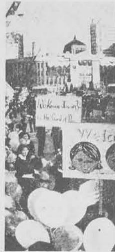
A crowd of schoolgirls line the sidewalk in front of the Seoul City Hall, carrying amusing and interesting signs welcoming President Ford. The president arrived here at 10 a.m. yesterday.