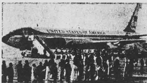
U.S. Air Force One is seen on the tarmac of Kimpo airport while U.S. President Gerald R. Ford, speaks in a plane-side welcoming ceremony.

Luxurious presidential compartment is divided into living room and bedroom with two single beds. The President mostly uses the bedroom on flying, while the living room is often used for conferences.