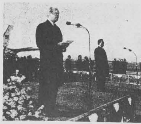
U.S. President Gerald R. Ford, left, reads an arrival statement following a welcoming statement by Korean President Park Chung-hee, which highlighted the 40-minute airport welcoming ceremony.