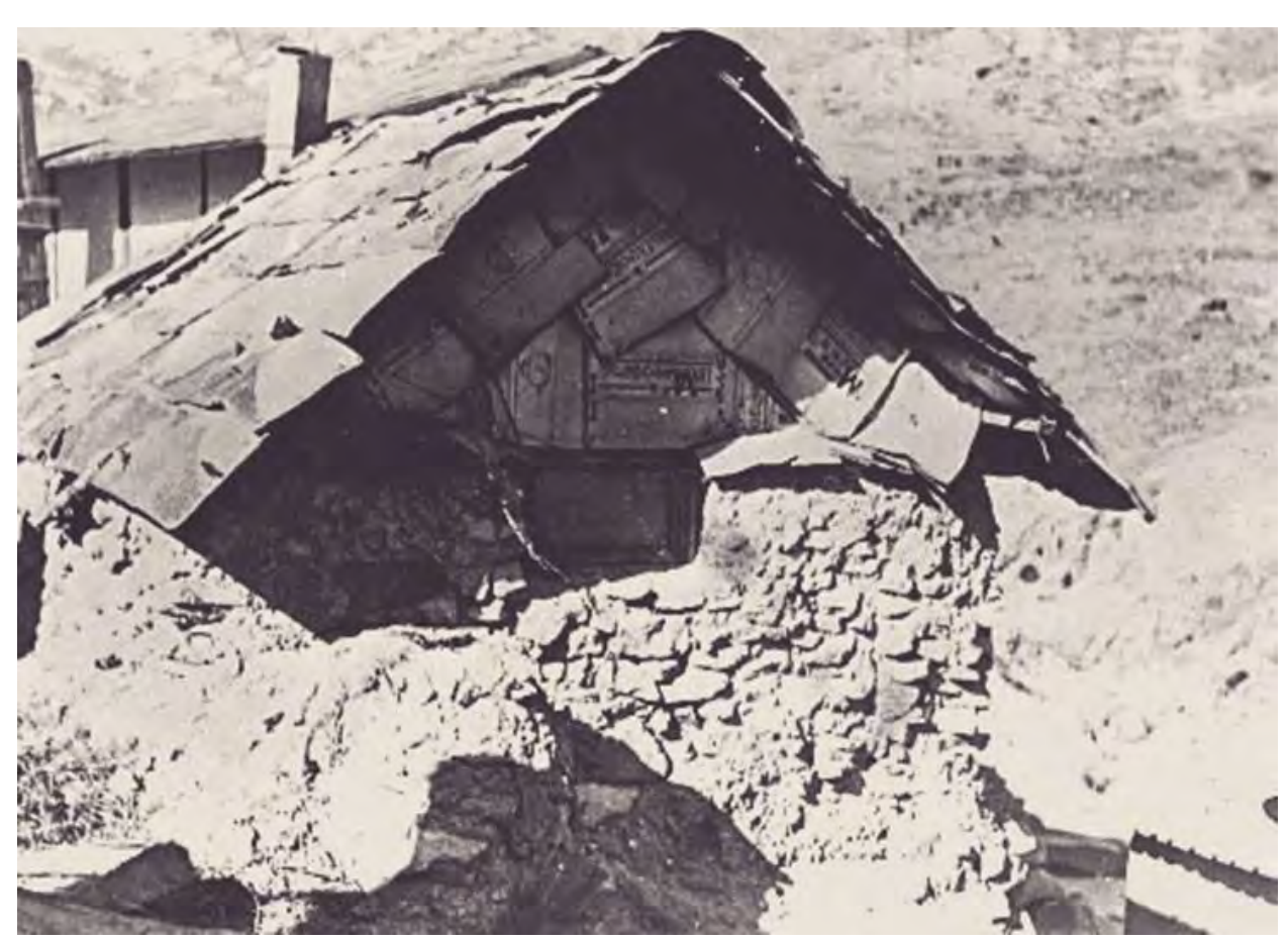
Sun Myung Moon built, lived and taught in this shack, built with rocks, dirt and cardboard boxes in 1951-52

Thus, people tried to pull the pile from both ends. But the more they pulled, the tighter the tangles became until the pile was but a lump, like a noose of sin. It began rolling here and there, depending on who was pulling it.