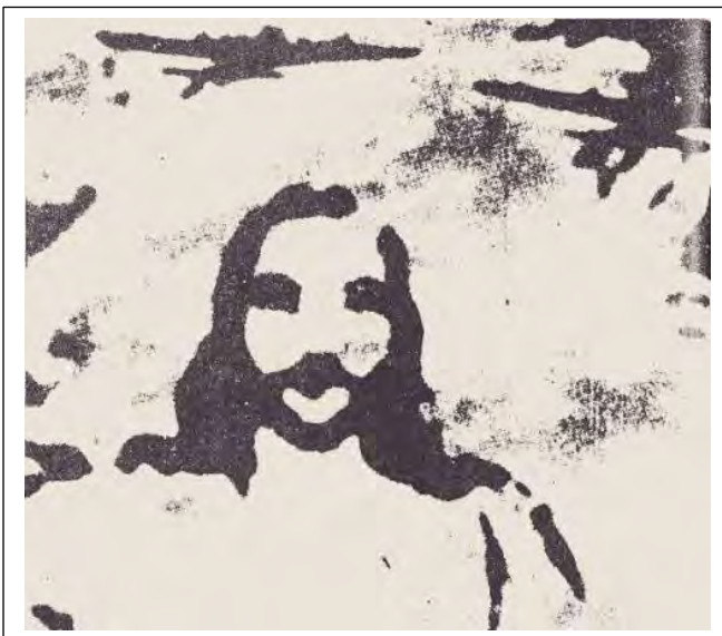
This photo was circulated in 1951 among Korean Christians, where newspaper accounts stated that it was taken in the skies over Korea.

Therefore, Korean War should realize the purpose of Second Coming on the earth, along with the Second Coming in the air that is mentioned in the Bible. Only then can God establish the foundation to embark on a new history based on nations that center on Godself.