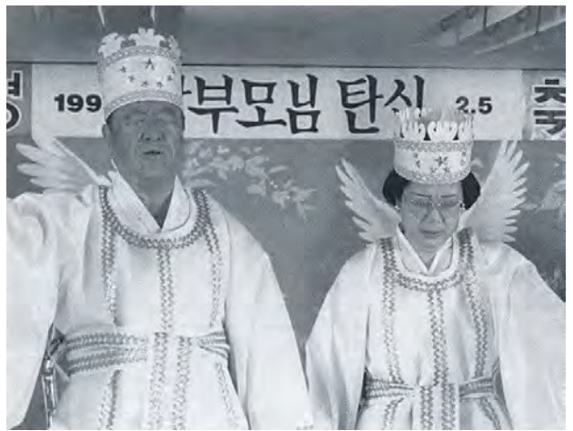
Father and Mother pray during the Main Pledge Ceremony, February 5, 1995.

I have established an absolute line of faith and an absolute father-son relationship with God. If you follow True Parents' footsteps, you will receive the same blessing and enjoy the same privilege. Do you understand? Like me, you need to be absolutely centered on God; you must center on True Parents with absolute faith and absolute love. This connection makes us one body. God is turning, True Parents are turning and humankind is turning, becoming one body going from Satan's side to God's side.