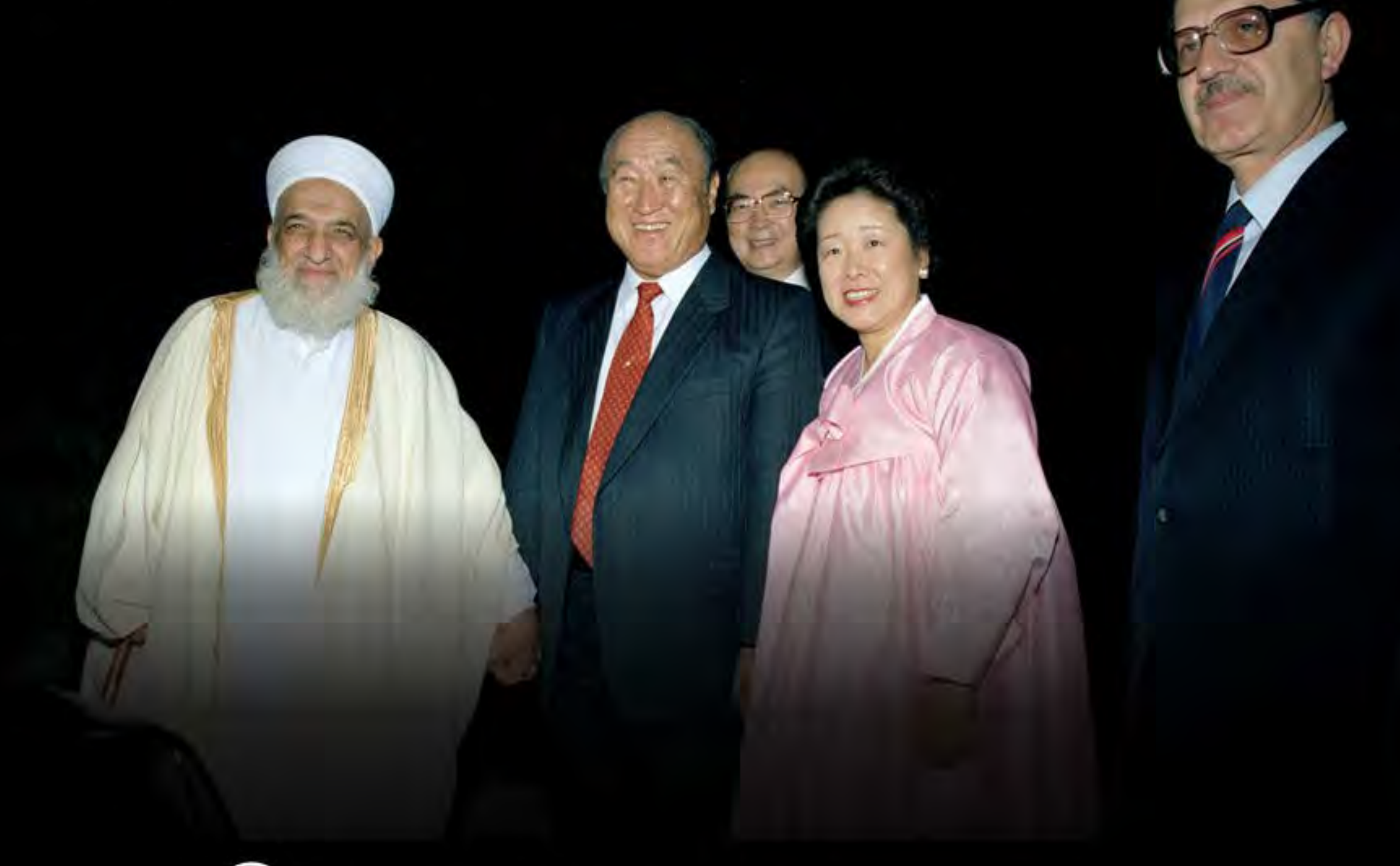
On November 14, 1990

True Parents held the welcoming banquet for the Grand Mufti of Syria.