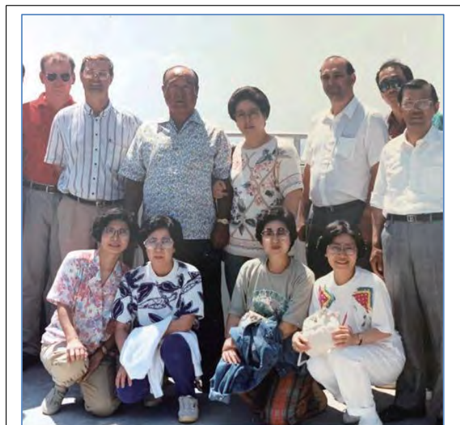
True Parents with Canadian members and the four prominent Japanese woman leaders who were to support True Mother and her mission