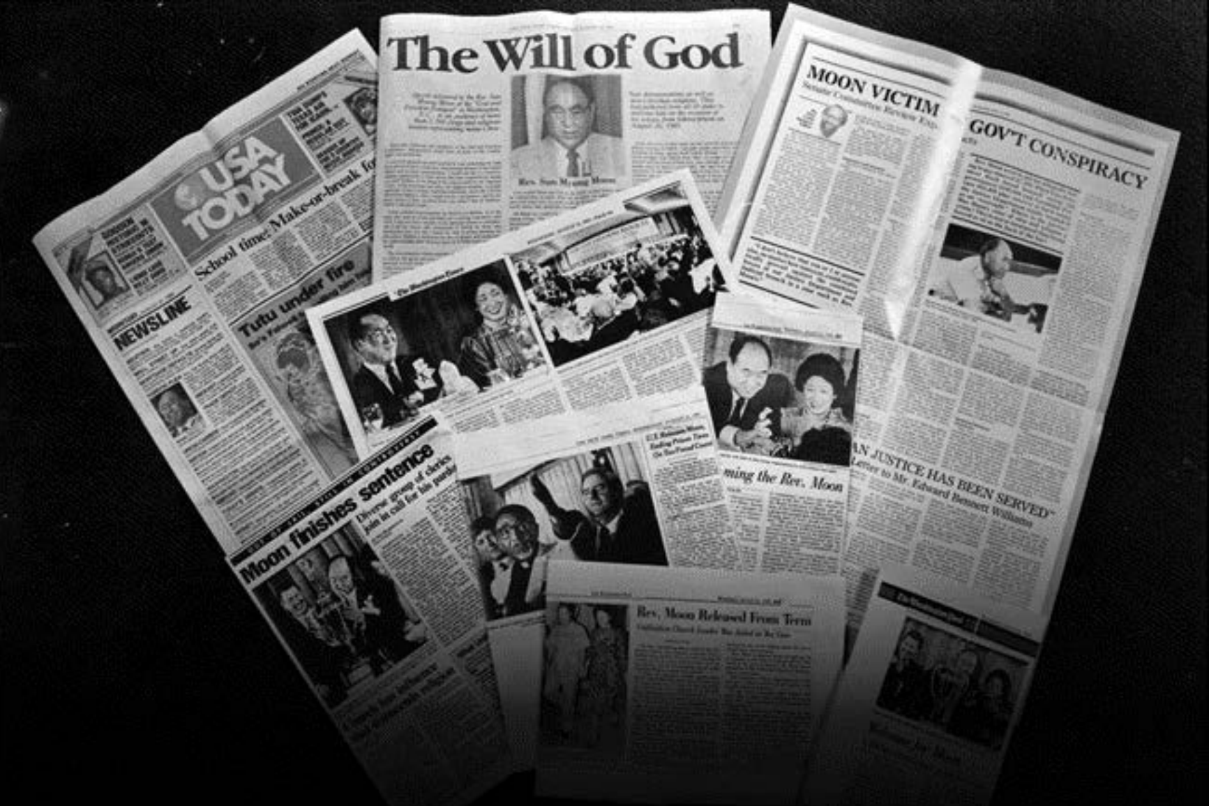
▲ American News Paper article related to True Father's release from a prison

True Father indemnified the cross through the Danbury Prison and resurrected what Jesus could not. This is the first step for Eastern Unification church culture to lead a society instead of Western Christian culture society.