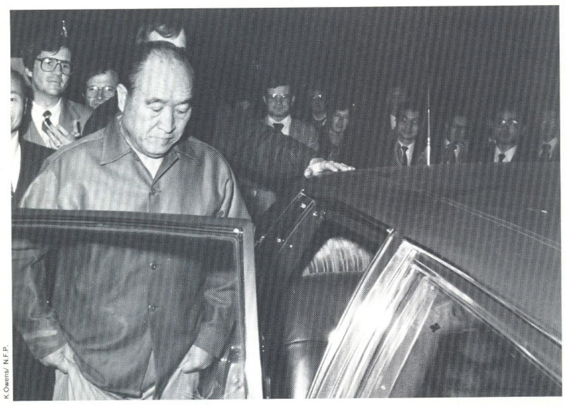
Father returns to Danbury in the evening.

I would like you to be with me all the time, for eternity, but you must have the same vibration of spirit. Our goal is still far away, our training is still long; but we will not get tired—we will move on. Win the battle, and reach my spiritual vibration. Look at me, follow my example, learn from my experiences, and become like me. There is nothing more that I can ask. Thank you.