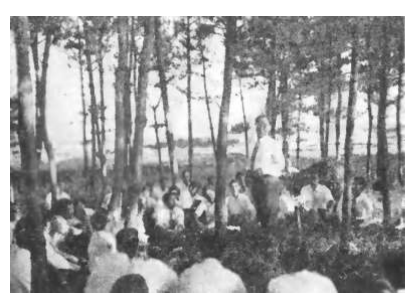
Master speaks to Japanese Unification Church leaders at Cheju Island during their tour across Korea country in September 1972

Sun Myung Moon April 1972 Paris, France Unification Church