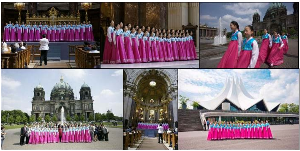
Little Angels singing in the Berlin Dom