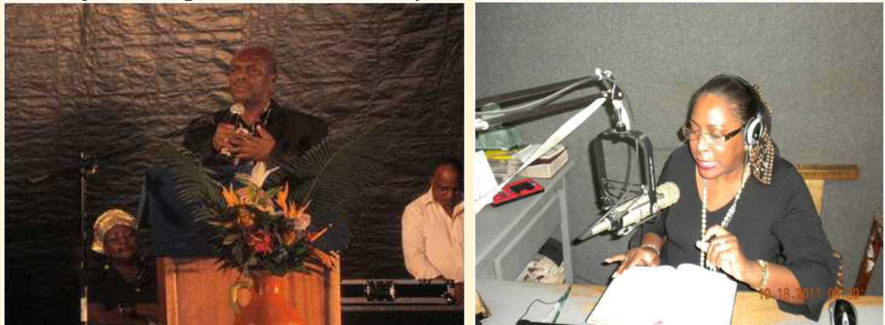
October 21, Rally for Healing and Peace

Rally for Healing and Peace, Divine Principle lectures aired on NICE radio