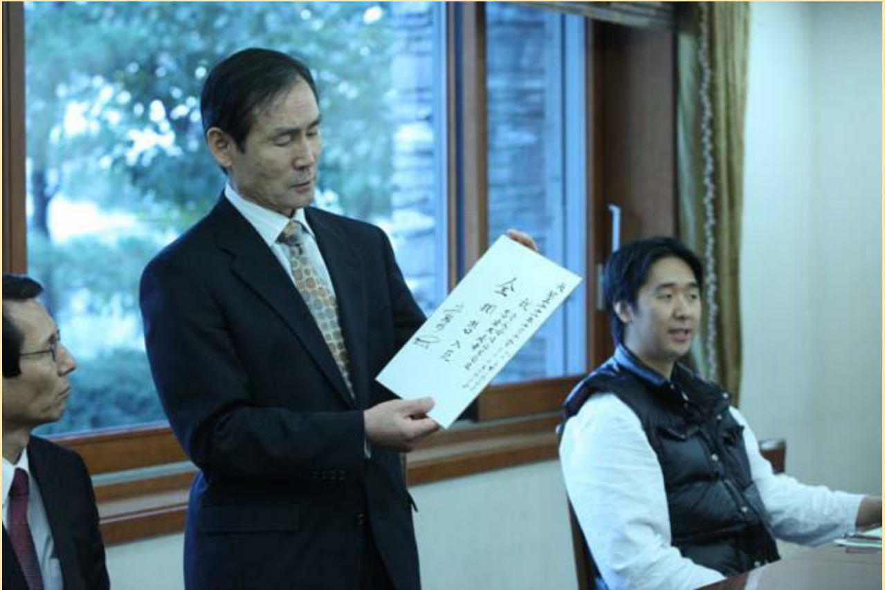
A message written by True Father personally, in calligraphy