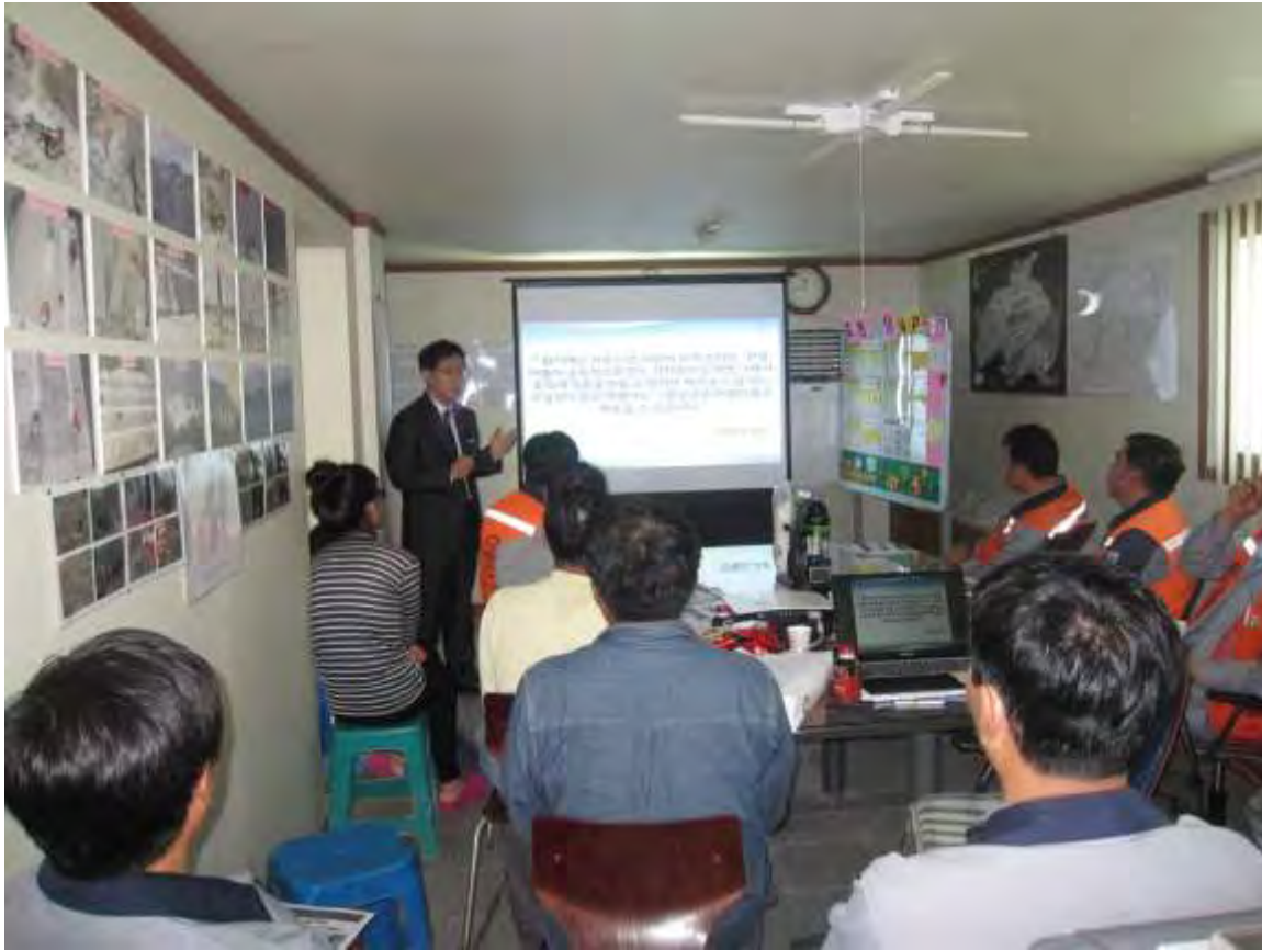
Scene of values education