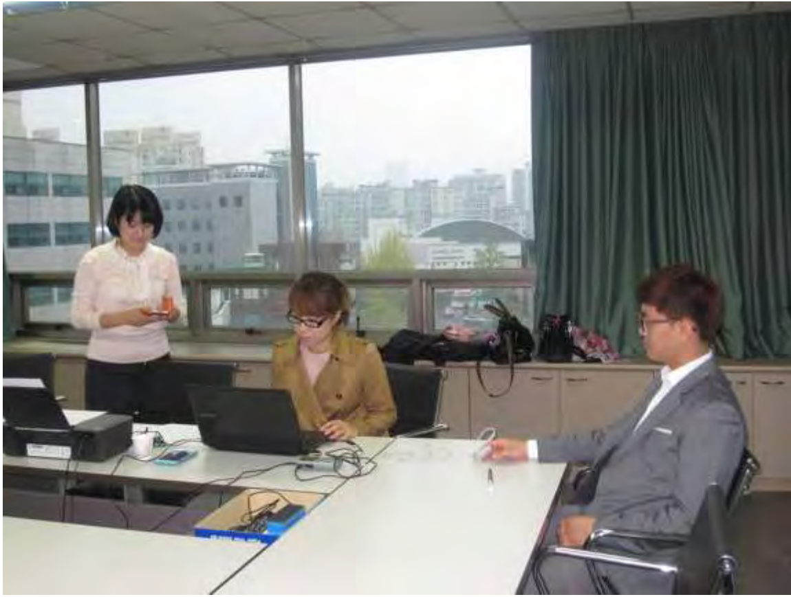
Employee assistance program