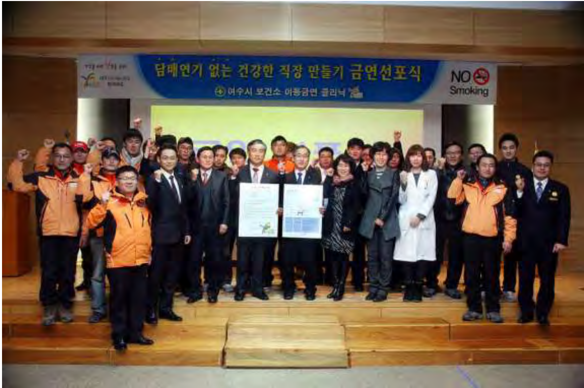
Group photo of the enthusiastic quit smoking declaration ceremony