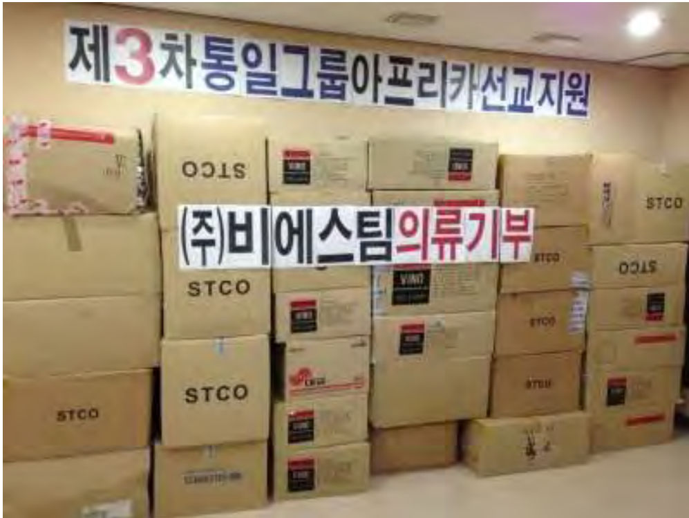
We would like to offer thanks to the B.S. Team employees for donating the 34 boxes of new clothes.