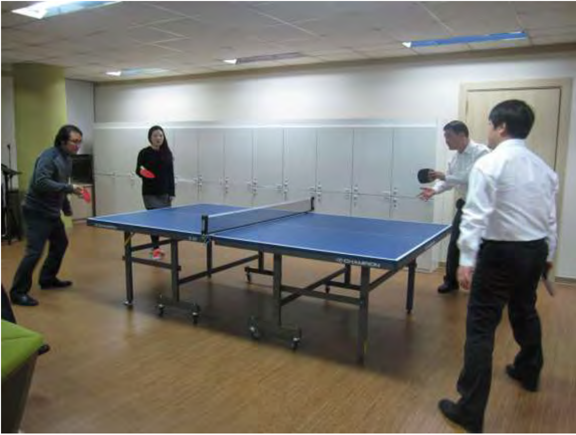
Il Shin Stone employees enjoying table tennis