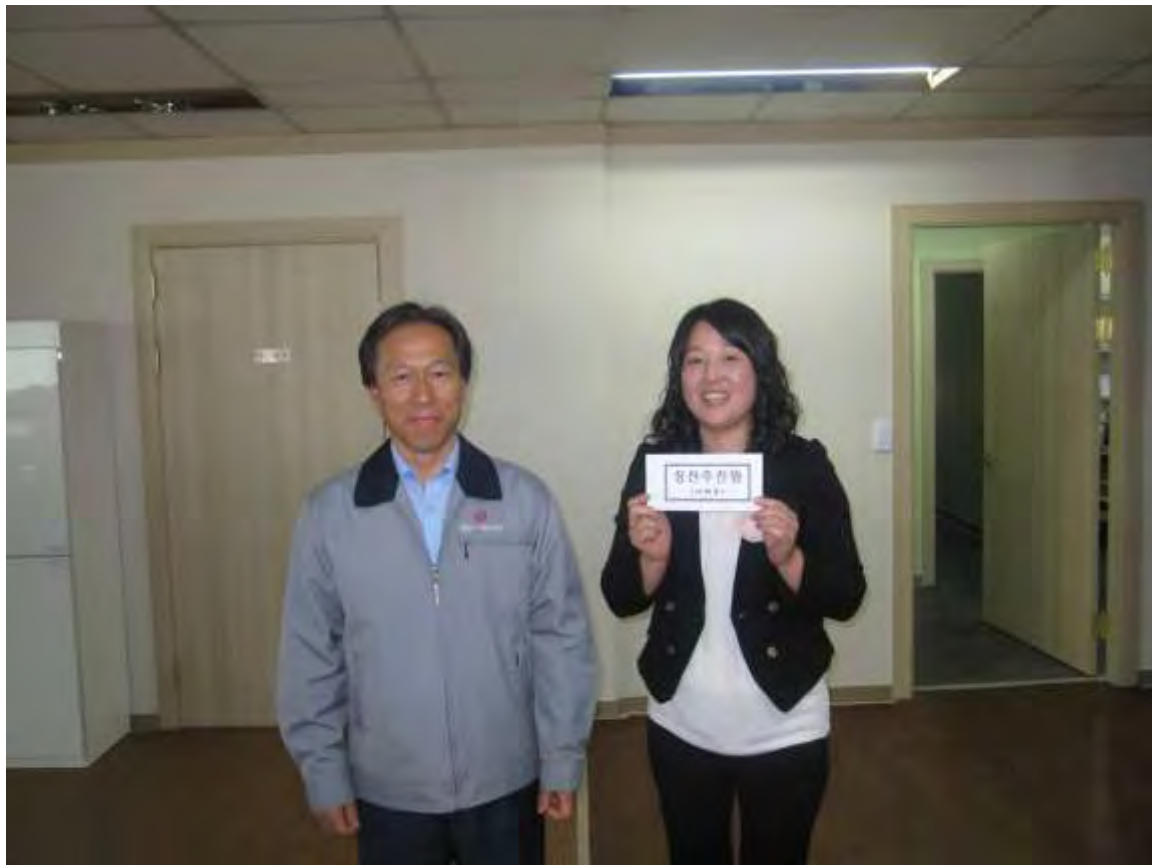
Scene of a 'King of Praise' awards

By citing 'King of Praise' and 'King of Praise Runner-up' efforts were made to change the atmosphere within the company to a bright one