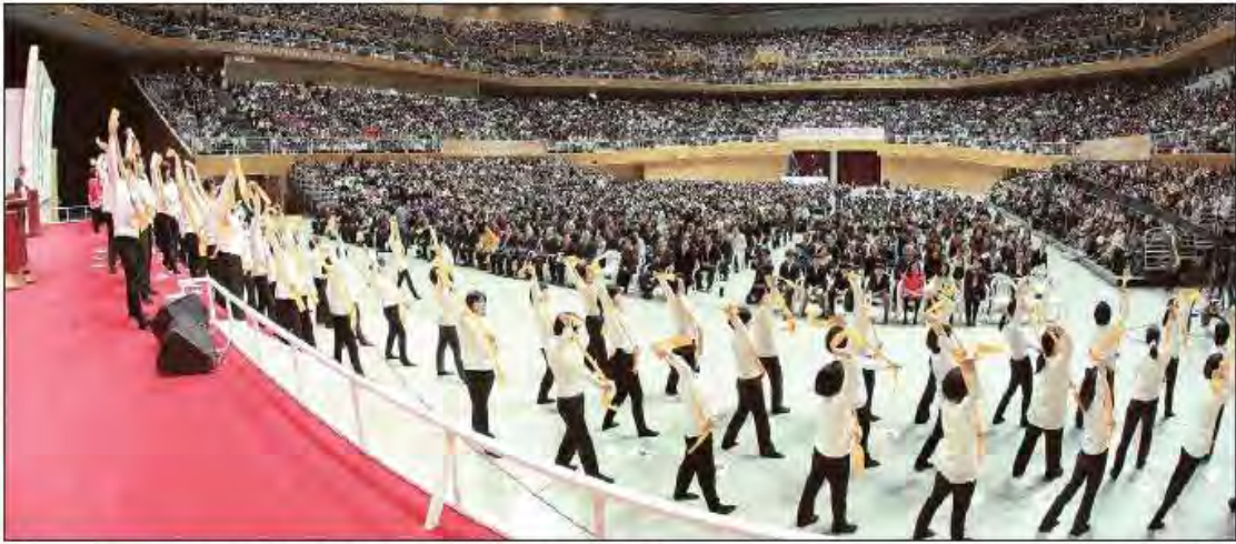
20일 경기 가평 청심평화월드센터에서 '전국 식구 연합예배' 시대에 앞서 대학생들이 시전 찬양을 하고 있다.