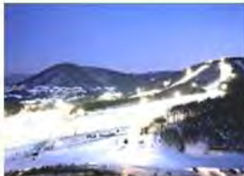
[Yongpyong Resort] Favorite Destination