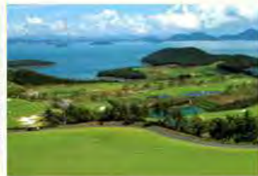
[The Ocean Resort] Quit-Smoking Declaration