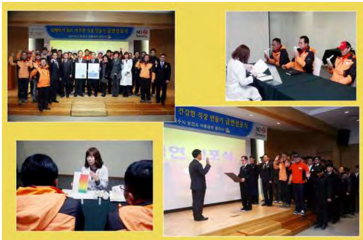
Scene of detecting the nicotine levels of each smoker and distributing a patch to help quit smoking