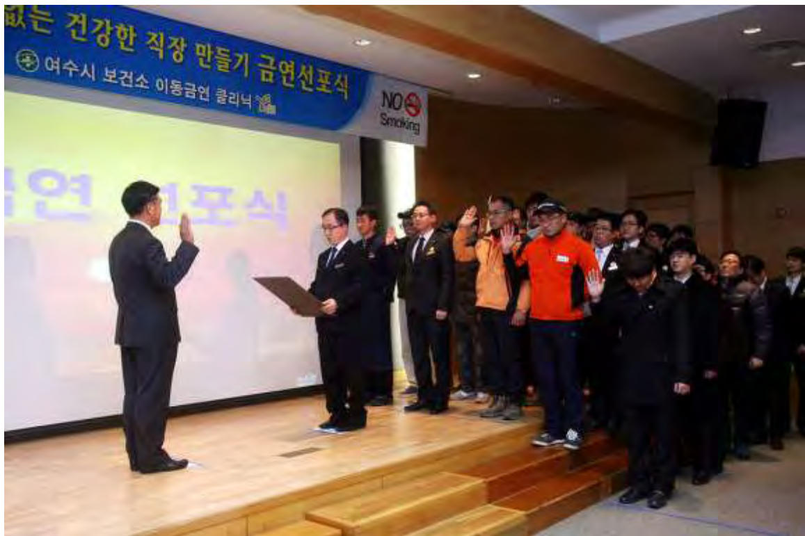
Scene of the quit-smoking declaration ceremony