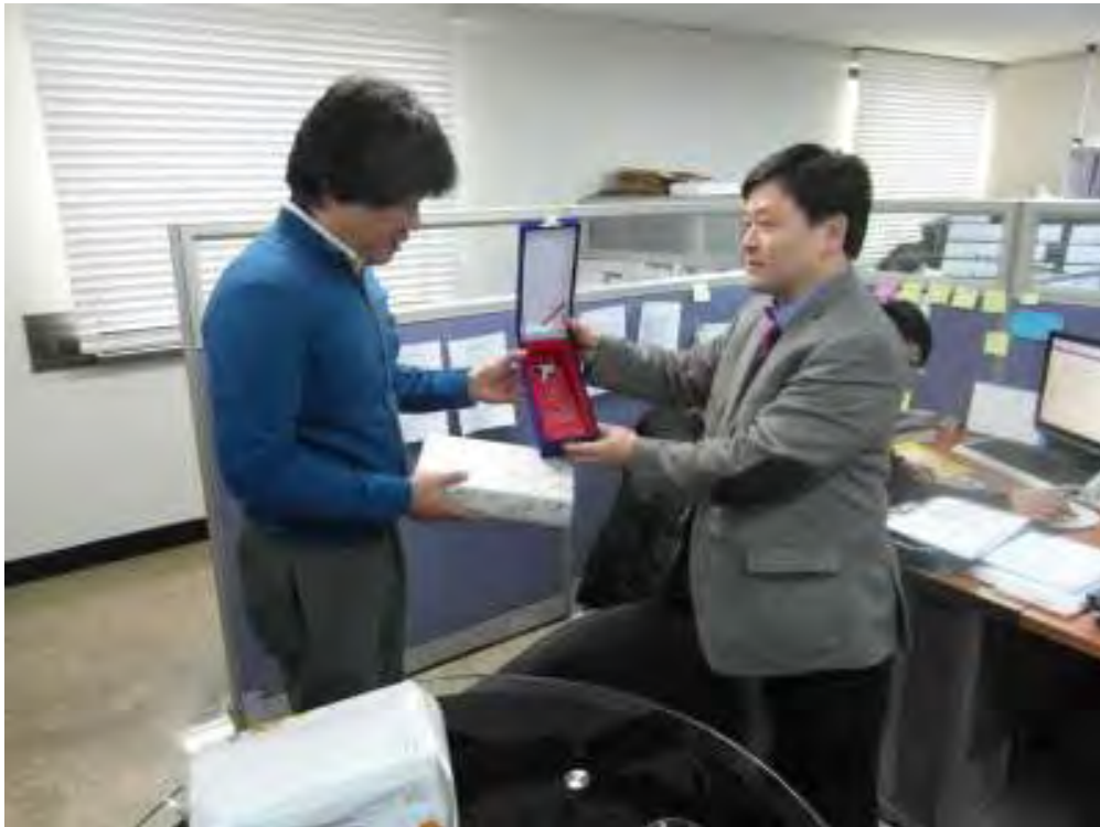
Receiving the thank you plaque

We know that everyone should take part in volunteering and giving donations, but it is never easy. I am lead to believe that by provided actual help to those in society that really need help through such projects is another way to save the world."