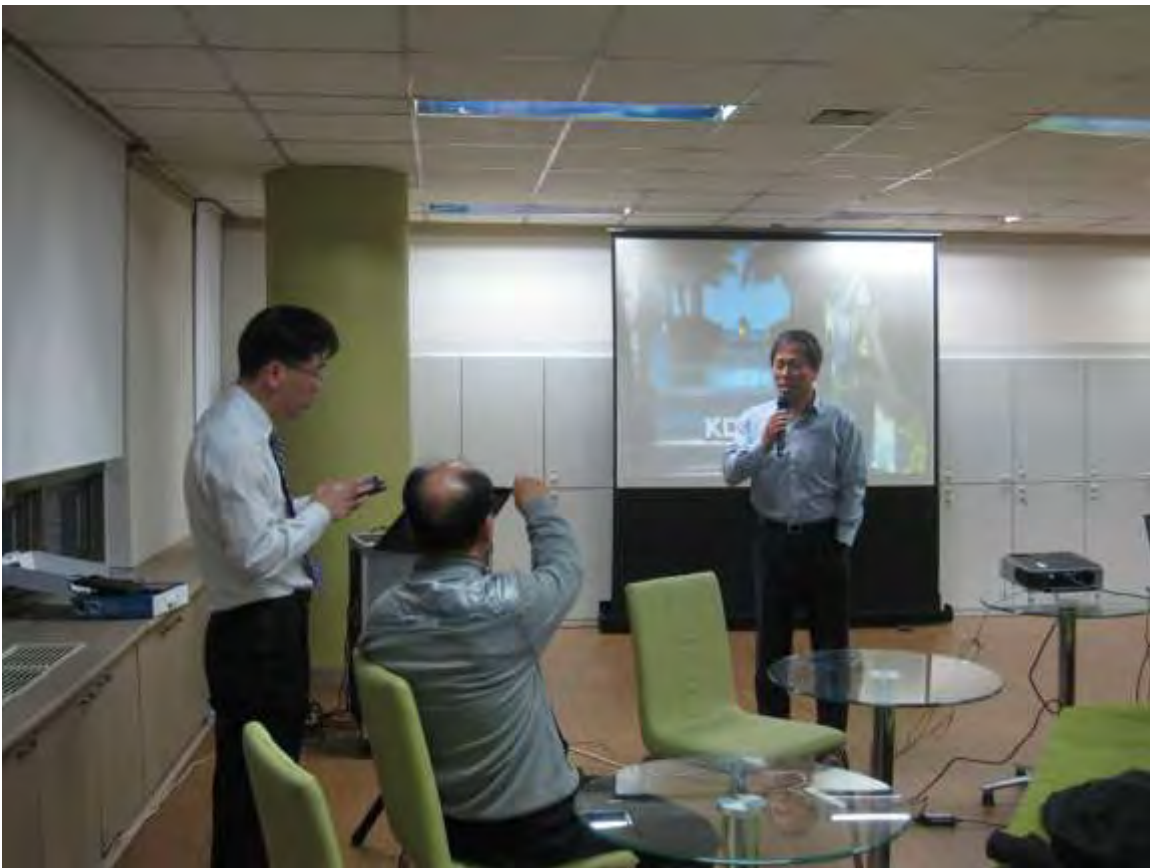
View of the karaoke machine in the company