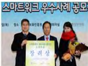
[Ilshin Stone] Case of Smart Work