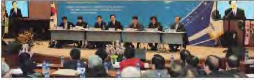
세계일보와 남북통일운동국민연합 공동 주최로 23일 서울 여의도 국회 현명7층에서 열린 ‘2013 통일기념 시민사회단체 초청 국민대토론회’에서 남북 문제 전문가들이 토론하고 있다.