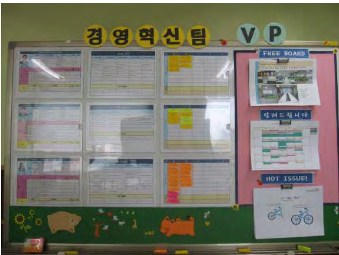
Sharing of visual work that is taking place