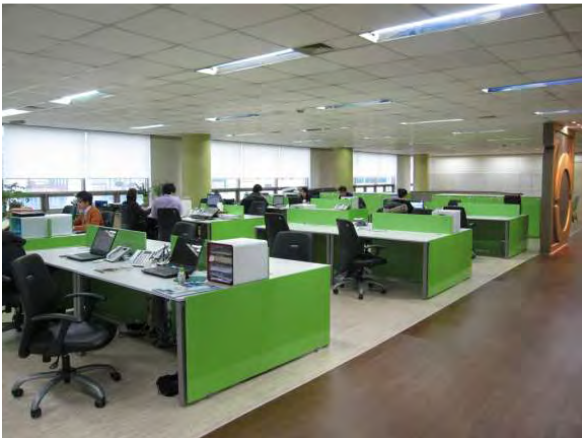
Relaxed office atmosphere

· Achievement of an open office : introduction of reassigned seating, building of an IP Phone System, video conferencing · efficient use of space : conference room expansion, intensive work spaces, individuals lockers and changing room flexible, creative thinking skills, building of a lounge within the office, informal layout·effect of displaying company products (Cork)