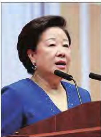
한학자 세계평화통일가정연합 총재가 20일 '전국 식구 연합예배'에서 참가자들에게 말씀을 전하고 있다. 세계평화통일가정연합 제9

“국내외적으로 불필요한 모든 송사(訟事)를 내려놓고, 관계자들은 회개하라.”