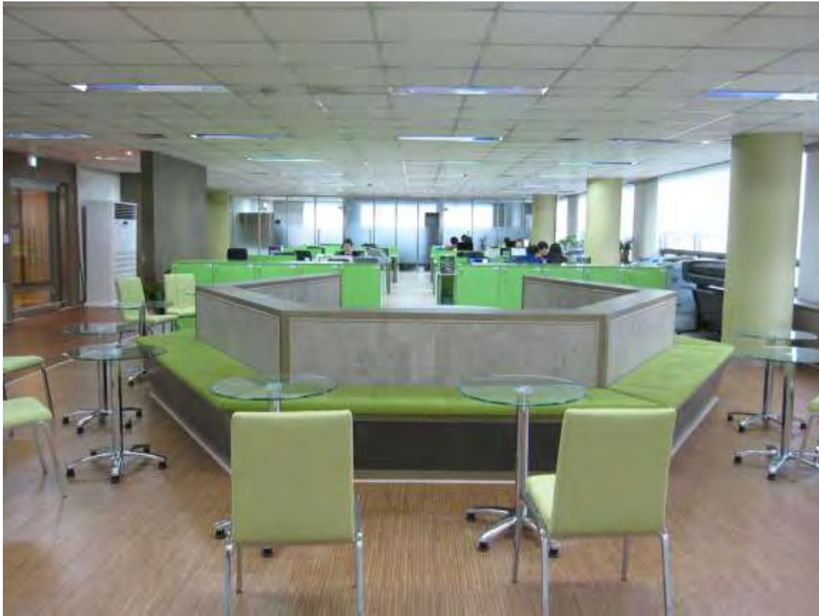
Building of a lounge within the office, informal atmosphere