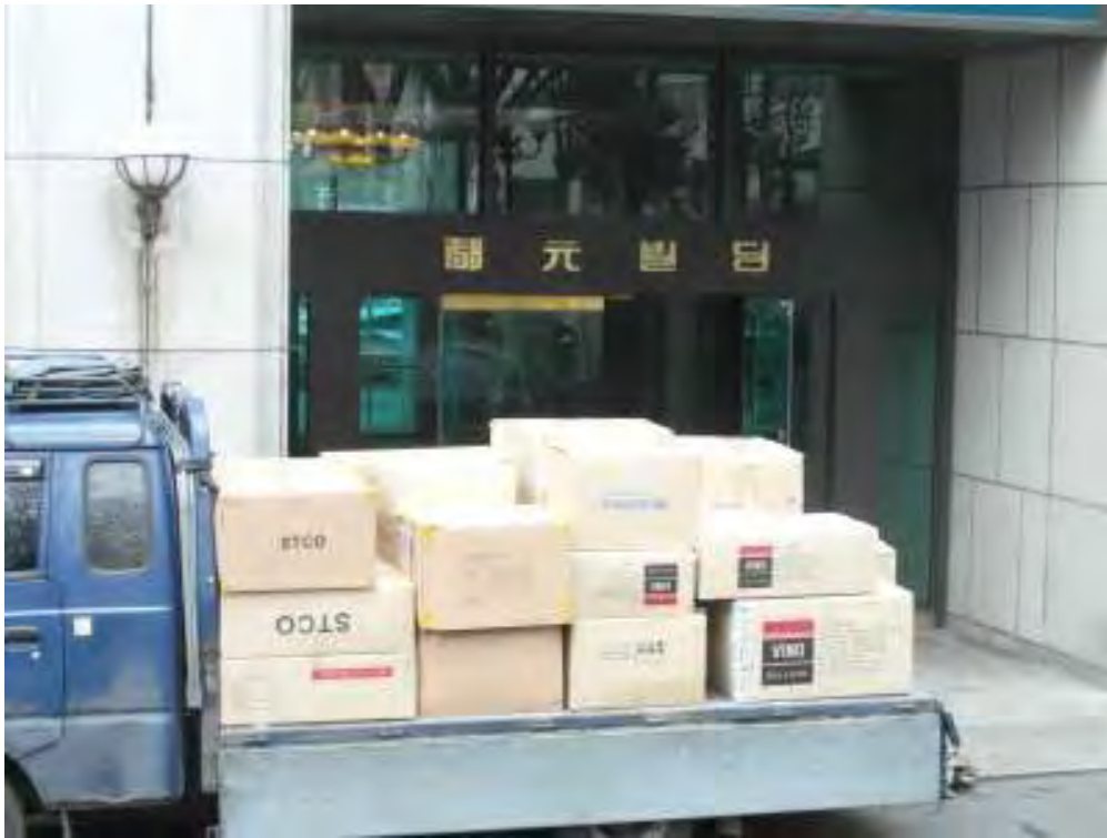
Clothing arrives at the Dowon Building in Mapo.