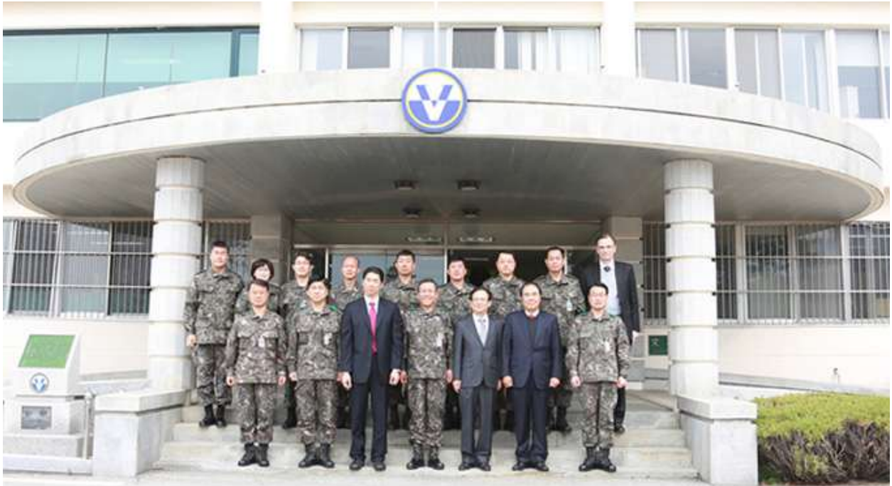
Picture commemorating the visit to the Fifth Corps