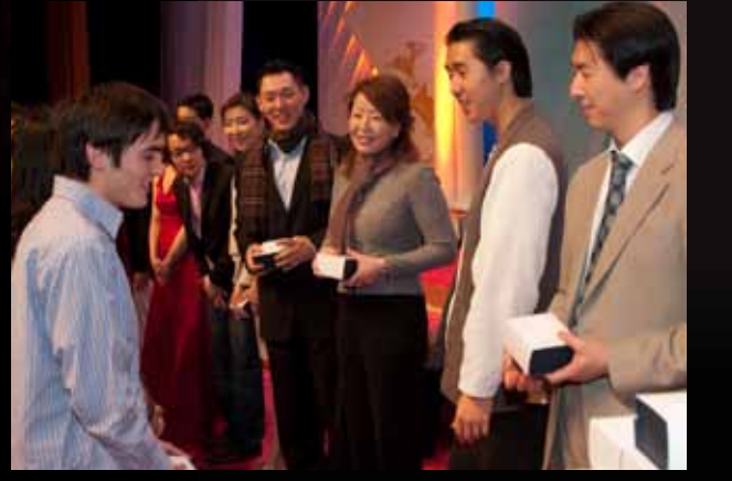
CRYSTAL PIECE TO COMMEMORATE TRUE PARENTS' BIRTHDAY COMMISSIONED BY REV. IN JIN MOON TO BE PRESENTED TO DONORS AND BLESSING ATTENDEES