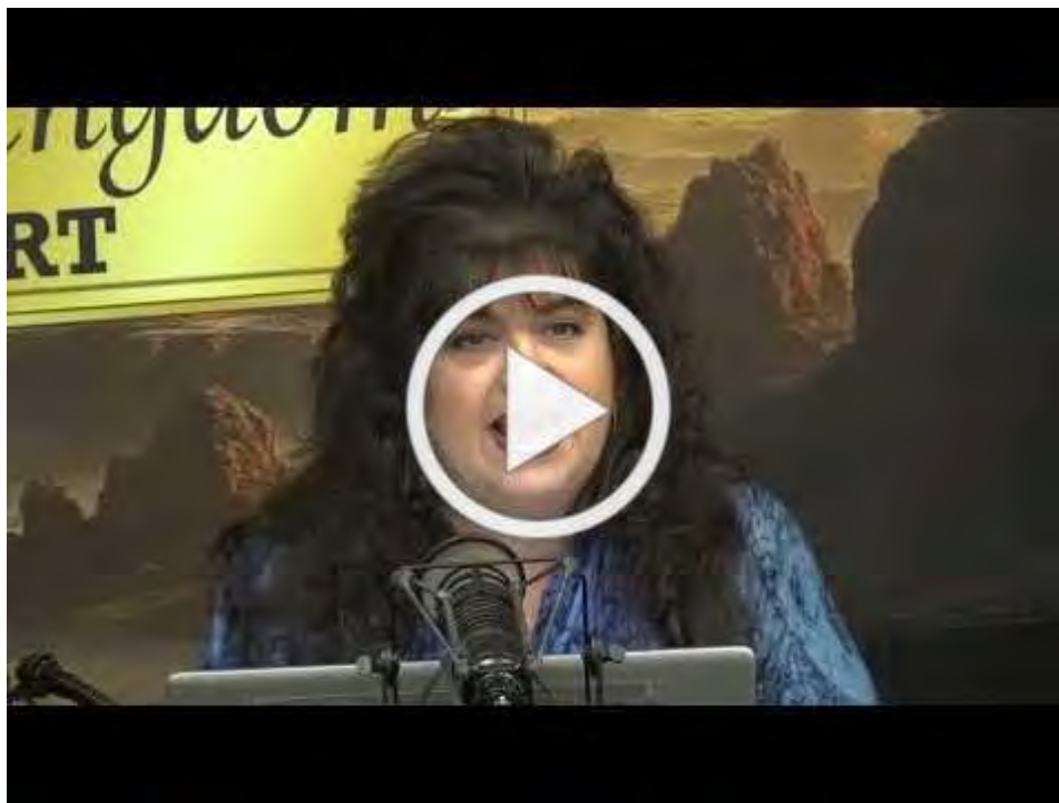
Trevor Loudon on Left's SMEAR CAMPAIGN Against Charlie Kirk

You must get down to work and achieve results. You do not even have to ask me to come help or ask God to help; when you become an indispensable person in the sight of God then He cannot afford to not help you. I do not think about how much I have already done and how I do not need to make any further effort. I am not dwelling on the past or even on the present; I am looking at the future and seeing how much work there is to do.