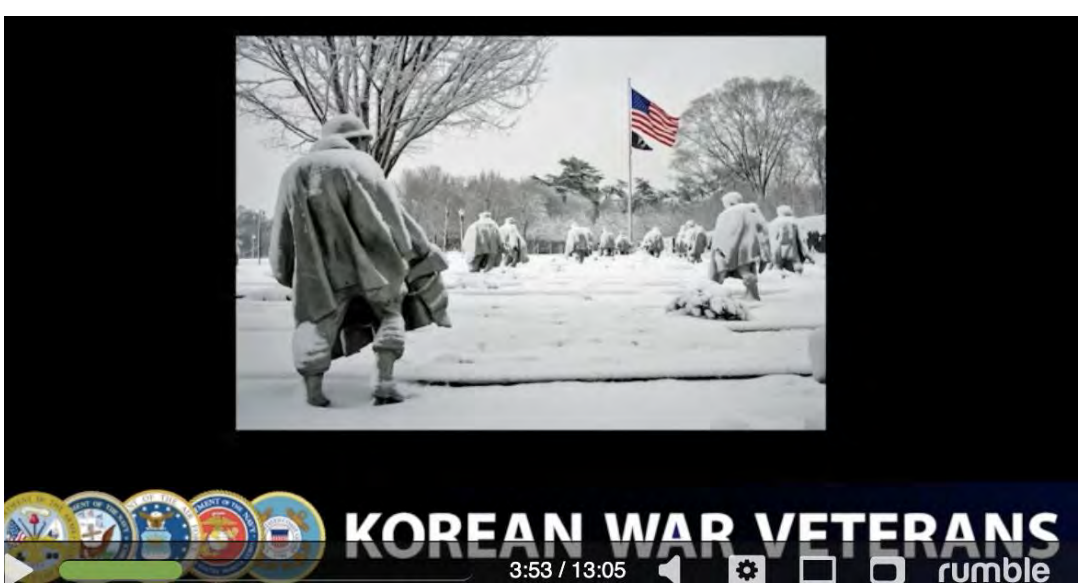
Korean War Memorial Dedication at the ROI Freedom Festival