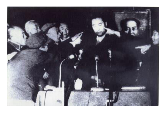
The 10th Panchen Lama during a struggle session

This is when public shaming becomes more developed during the Communist Revolution. There are a lot of scholarly writings on this, and if you study any Communist Cultural Revolution, you'll see that this always happens.