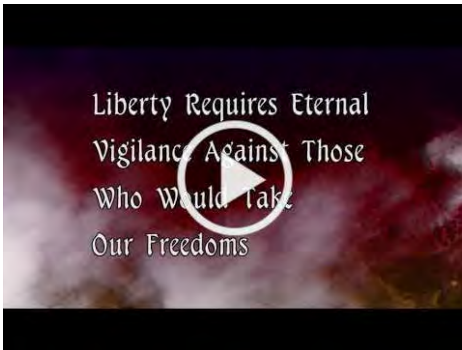
Rod of Iron Freedom Festival 2020 - Art Show