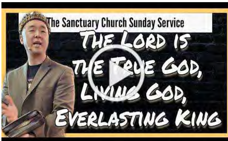
The Lord is the True God, Living God, Everlasting King (Sunday Service 2/2/2020)

Pres. Trump is an unlikely one to be chosen as the champion of religious freedom and the Biblical foundation of America. When he spoke at Liberty University he said he never saw the need to repent for his sins. Metanoia means to turn away from what Satan likes to what God likes. Since then President Trump has arguably done more to defend the rights of Christians and Jews than any president in history. The Democrat/Communist party is trying to destroy our nation, but they have been confounded.