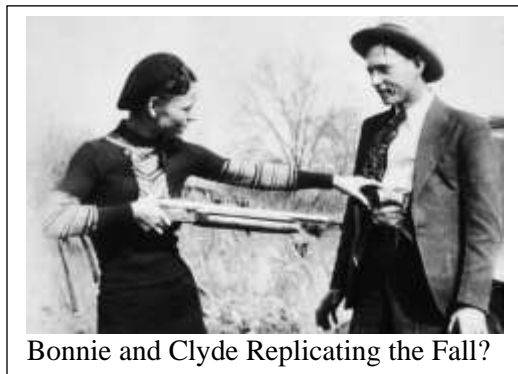
Bonnie and Clyde Replicating the Fall?

I imagine that this new teaching could be attractive to Leftists who believe that private property is evil and want government to confiscate wealth in order to redistribute it to preferred groups. Concentration of power has always been a key objective of centralized tyrannies.