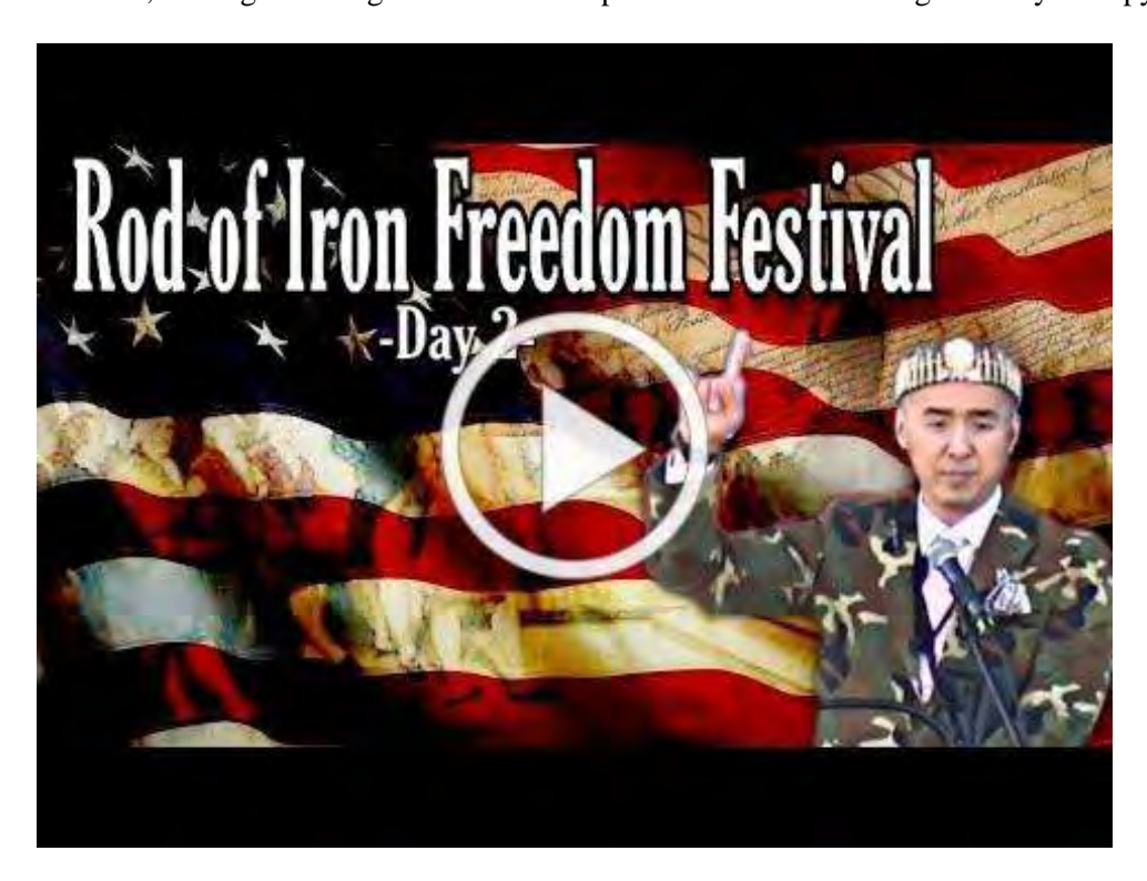
Day 2, Rod of Iron Freedom Festival 10/13/19

She said, "taking action against these child predators is more healing than any therapy!"