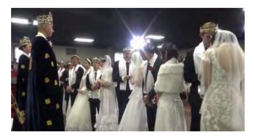
10/14/2019 CIG Book of Life Registration Blessing

Public education teaches that we must be subservient to a master class and system, which is based on materialistic teachings like Charles Darwin's theory of evolution, leading to cultural and moral relativism. It is regrettable that even many practicing Jews and Christians accept Darwin's materialistic theory of evolution.