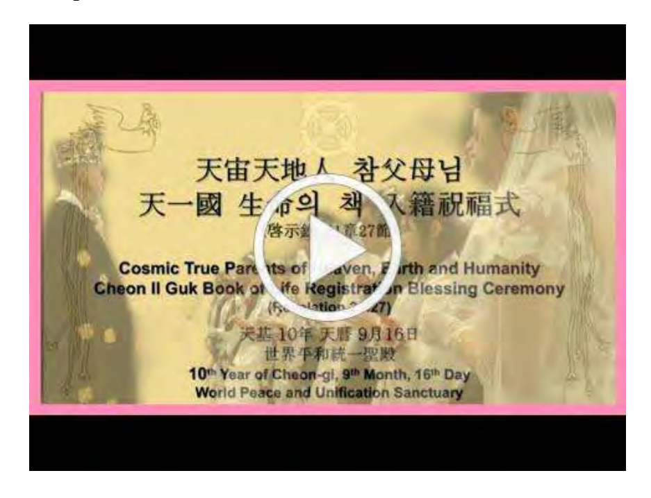
Cheon II Guk Book of Life Registration Blessing 10/14/19

On the next day, a beautiful and moving Cheon Il Guk Book of Life Registration Blessing ceremony was held at the Sanctuary Church involving 13 Second Gen couples on location and many more participating through the Internet!