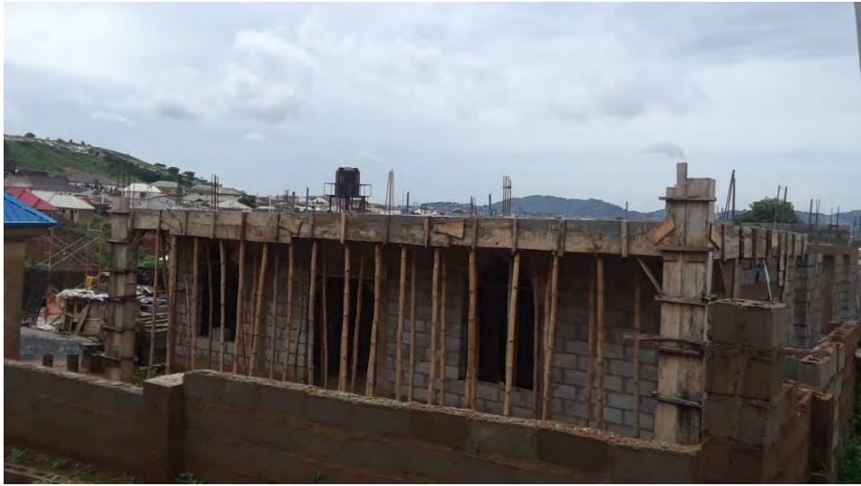
● Front of the church