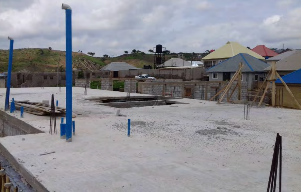
Finished decking for the office and Sunday School halls