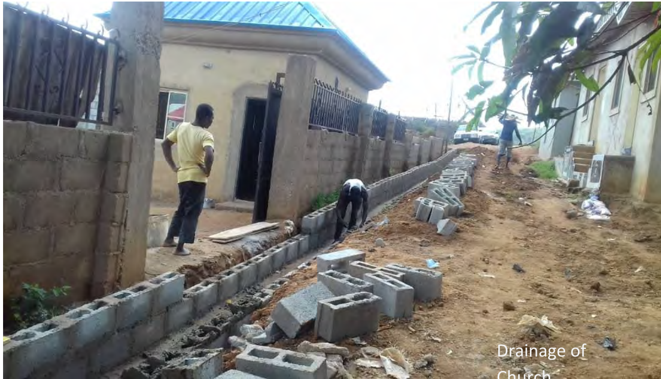
Drainage of Church