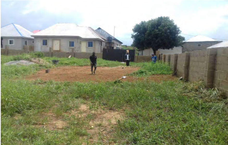
Land and fence around the land