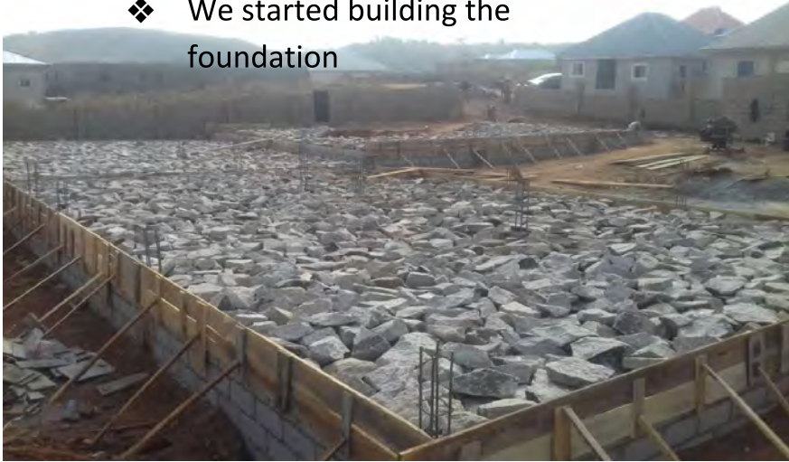
❖ We started building the foundation