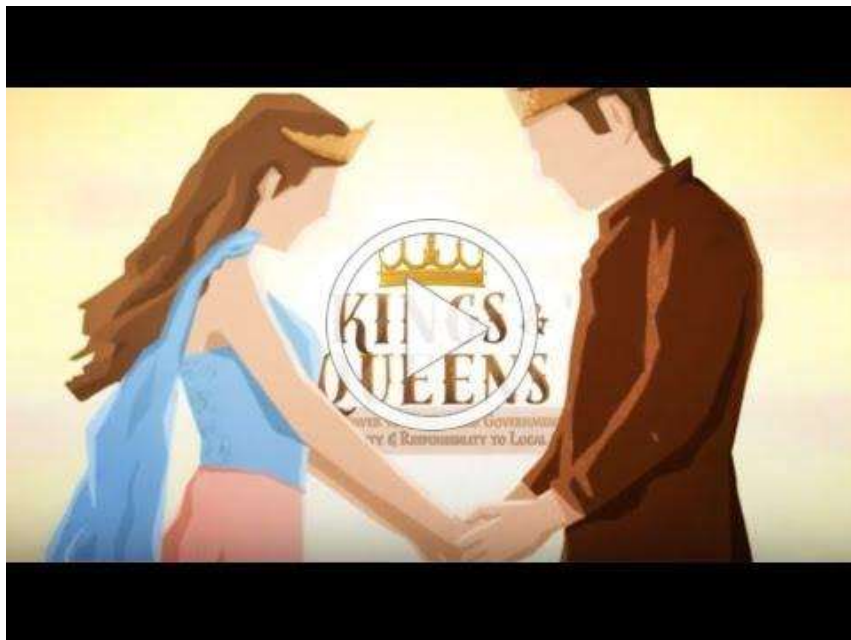
Rod of Iron KINGDOM