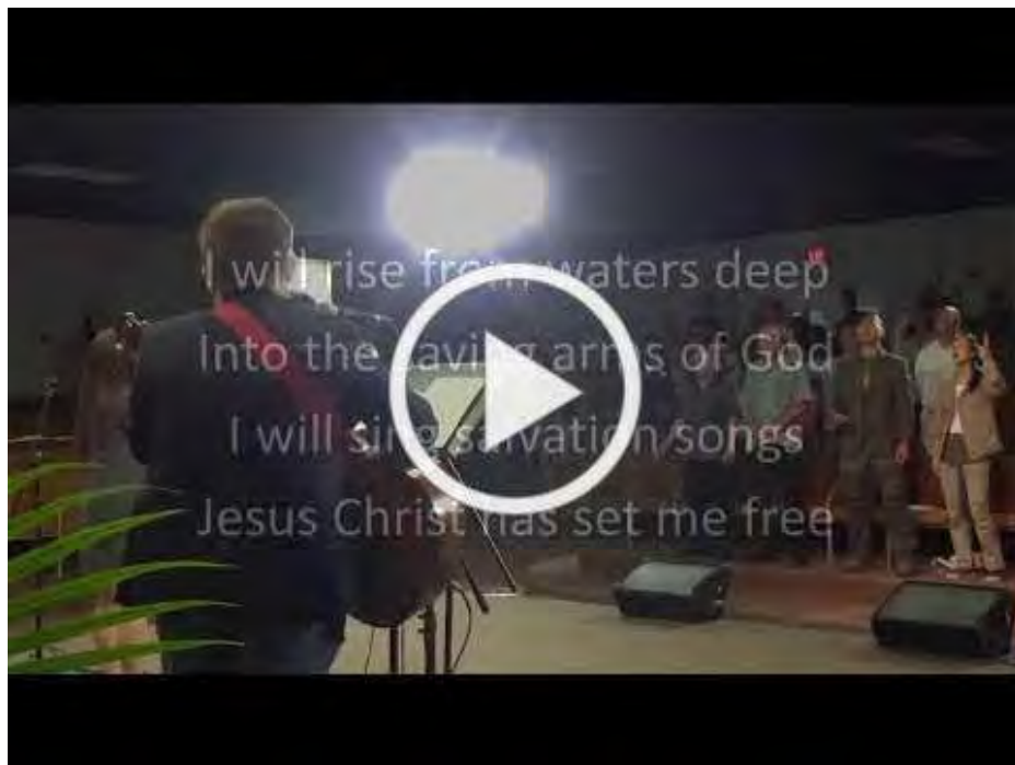
Unification Sanctuary Sunday Service 7/14/2019

He discussed the state-sponsored killing of children in ancient Carthage, which continued Baal worship of the Canaanite religion, explained in the new Our Father Forsaken book. The historicity of such crimes are confirmed by different historical sources. These practices are similar to current government sponsorship of abortion through the billions of dollars given to Planned Parenthood.