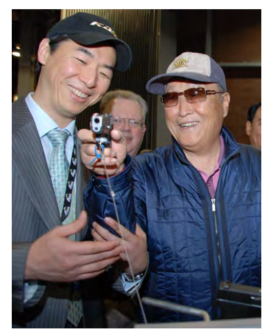
True Father at 2011 Shot Show

Last question -- is the gun in True Father's hand in the accompanying photo, an instrument of evil or an instrument of True Love?