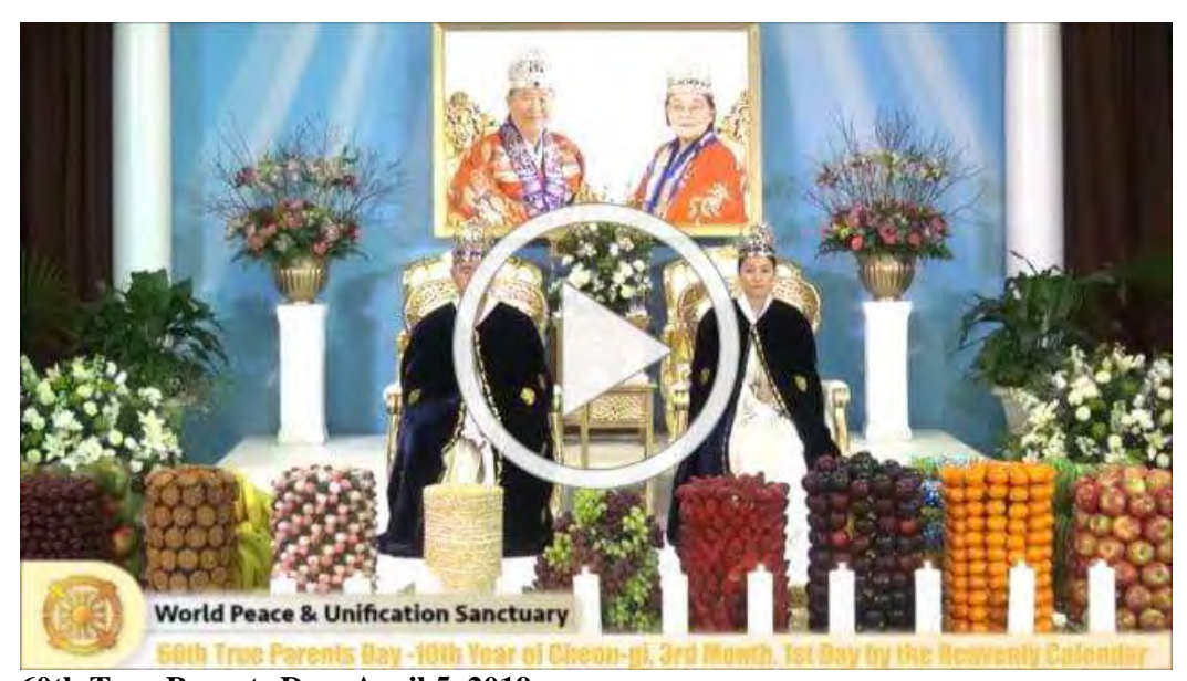
60th True Parents Day, April 5, 2019 Unification Sanctuary, Newfoundland, PA