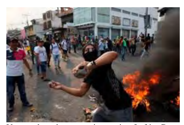
Venezuelans demonstrating against Leftist Government

That is why I don't see this as an issue of "name-calling." Her ideas are unprincipled and dangerous. Socialist governments killed hundreds of millions of people in the last century, most of whom were disarmed through gun control laws that were enacted under the banner of "fighting crime" and "reducing violence."