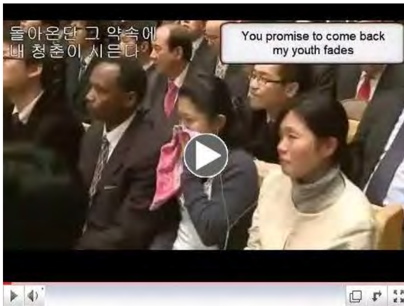
True Father on 3/7/2010 "I could not meet my bride."