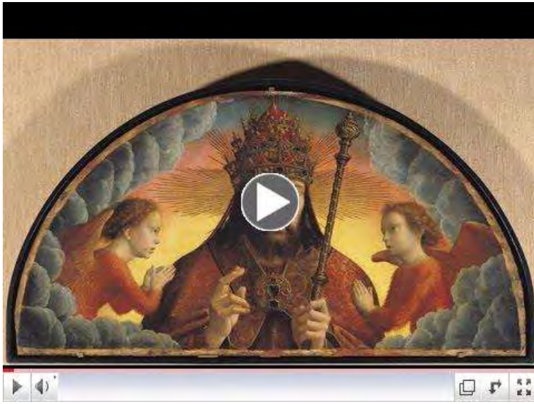
Jordan Peterson- Biblical Series I: Introduction to the Idea of God