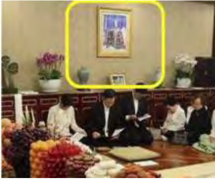
TPs' Portrait Replaced by Mother's in Palace

Another reason why it is correct to say that Mother's claim to be the Messiah, the object of love for all the "Brides of Christ" is a strange and illogical form of "theological lesbianism."