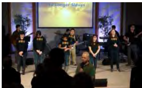
SOS band performs "No Longer Slaves to Fear"