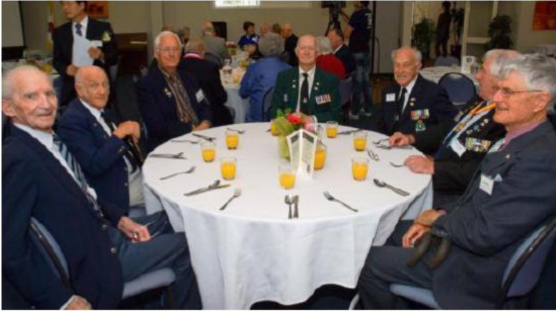
NZ -Korean War Veterans