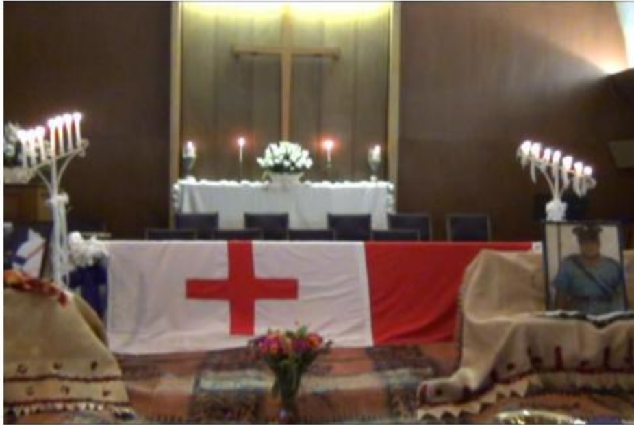
October 9 th , 2011 – Filming of a Tongan Memorial Service at Tongan United Methodist Church, Sacramento, Calif.

California, USA, October and November, 2011