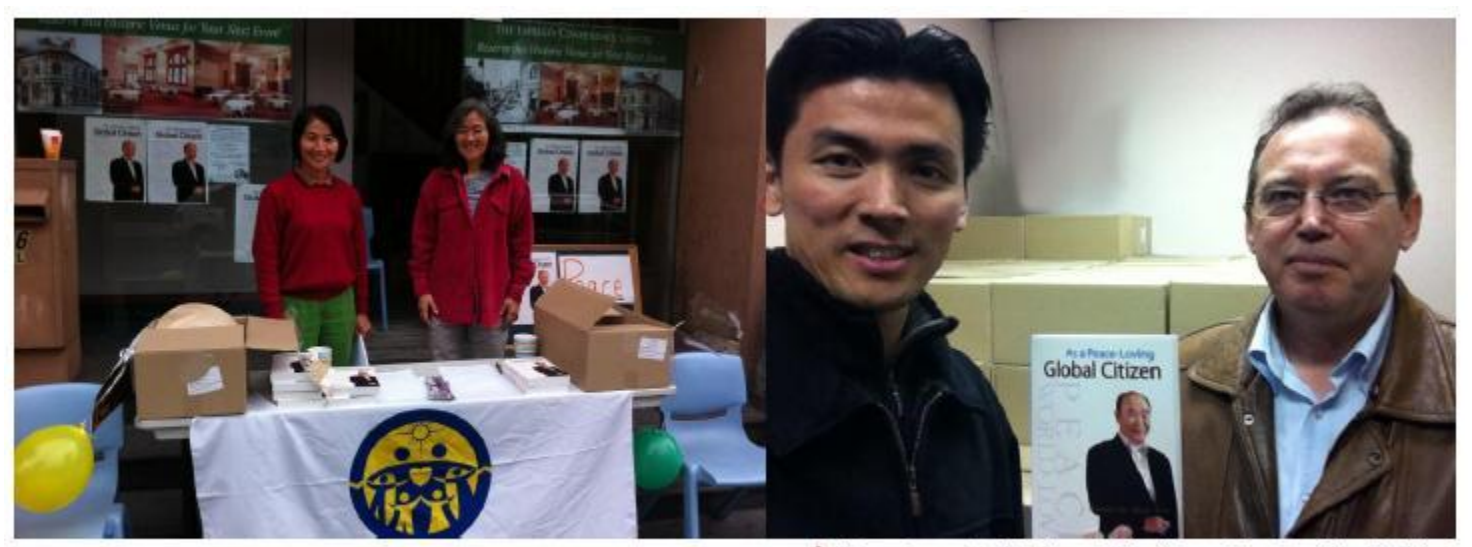
Autobiography Distribution in Sydney.

Orders were taken, and arrangements made for copyright permission and source text so that eventually there could be a first bulk printing of 10,000 copies of the Autobiography.