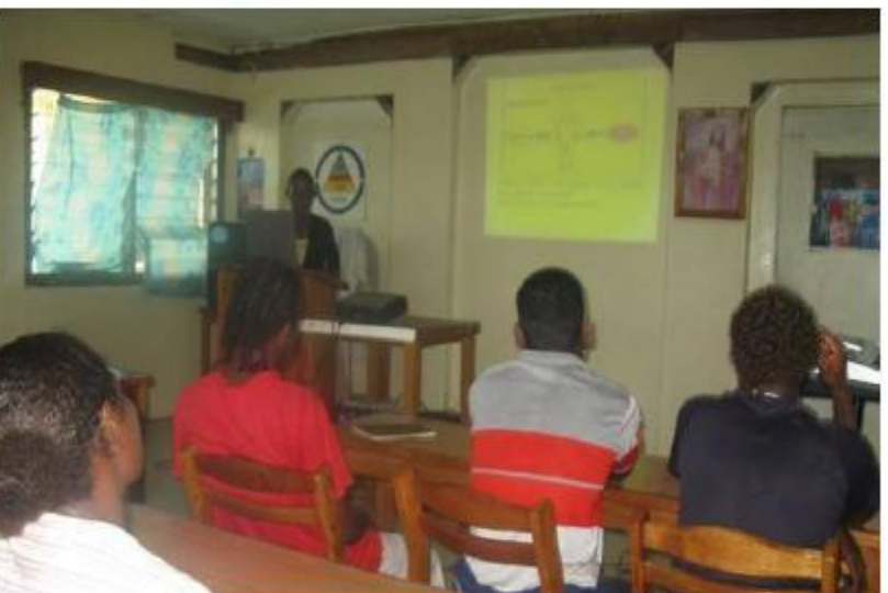
Right: New guests giving their reflections