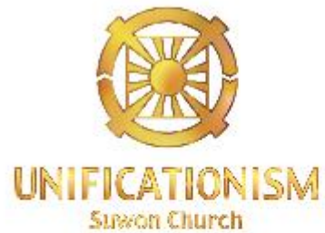
Logo [Korean-English combination]: horizontal