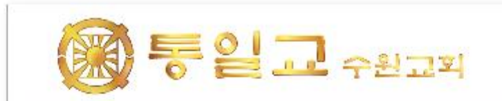
Signboard - horizontal type