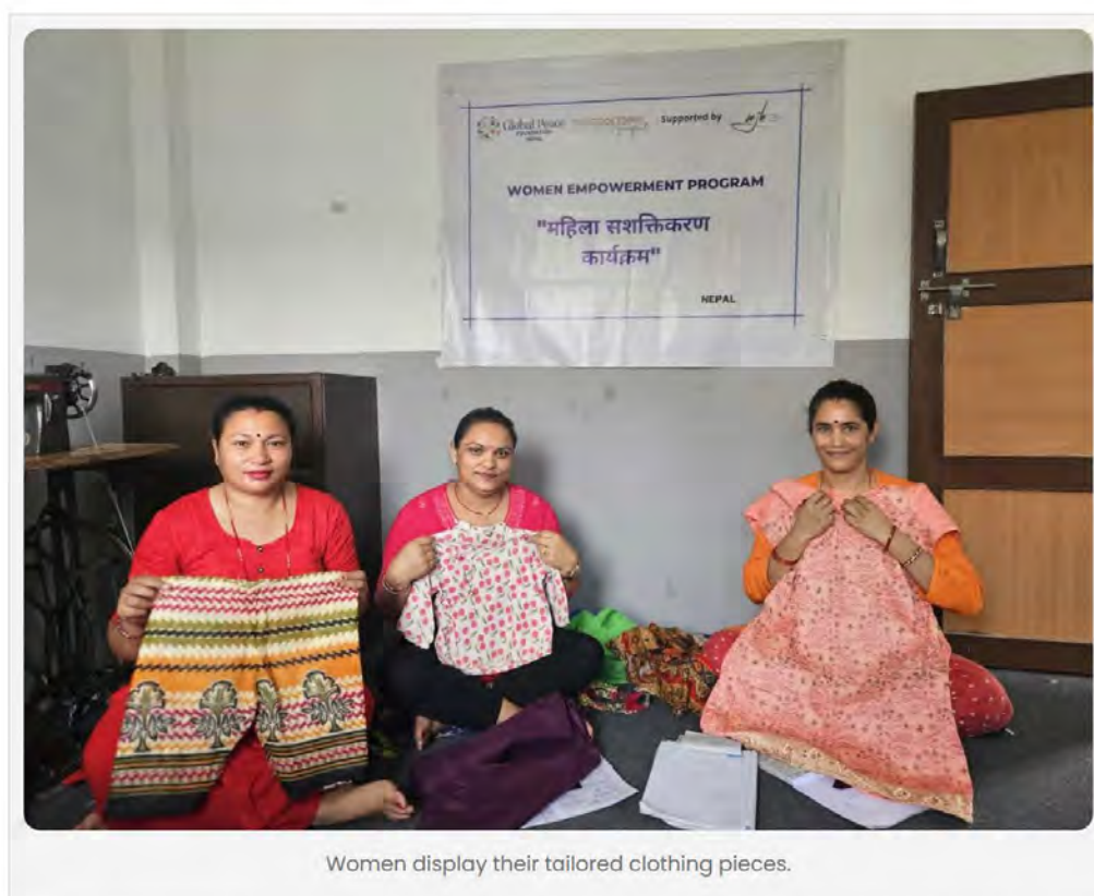
Women display their tailored clothing pieces.

Launched on February 1, 2025, in Dhadingbesi, Nilkantha Municipality, the 3-month training equipped 21 women with both basic and advanced tailoring skills, including pattern making. Aside from the tailoring training, the women also received sessions on Self-Confidence, Effective Communication, Cervical Cancer Awareness, and Leadership Values. In addition to the 21 women enrolled in the tailoring training, five more women participated in these sessions.