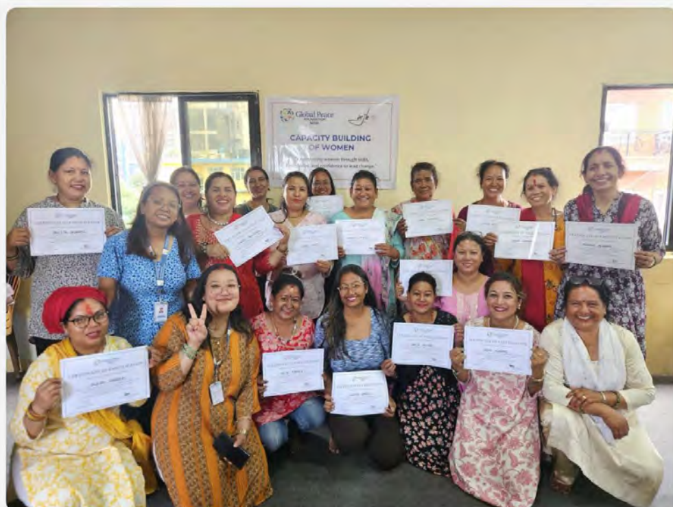
Women in Nepal participate in capacity building workshops hosted by Global Peace Foundation.

Global Peace Foundation (GPF) Nepal organized a series of activities through its Capacity-Building of Women project designed to empower women by equipping them with leadership values and essential skills. Recognizing the vital and transformative roles women play within their families and communities, the project focused on building their confidence and leadership skills, enhancing communication and collaboration abilities, and developing practical skills for income