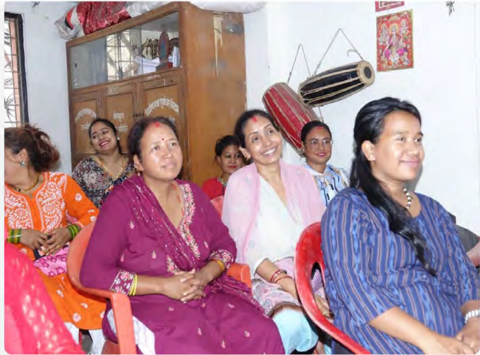
Nepalese women join a leadership session hosted by Global Peace Foundation.

With increased confidence and a deeper understanding of the vital role women play in society, they are inspired to take on leadership roles with a service-oriented mindset. As an initial step, the women organized a cleaning drive at a local temple the following day. The collective effort not only helped in maintaining the hygiene of the place but also demonstrated service, teamwork, and ownership towards their community.