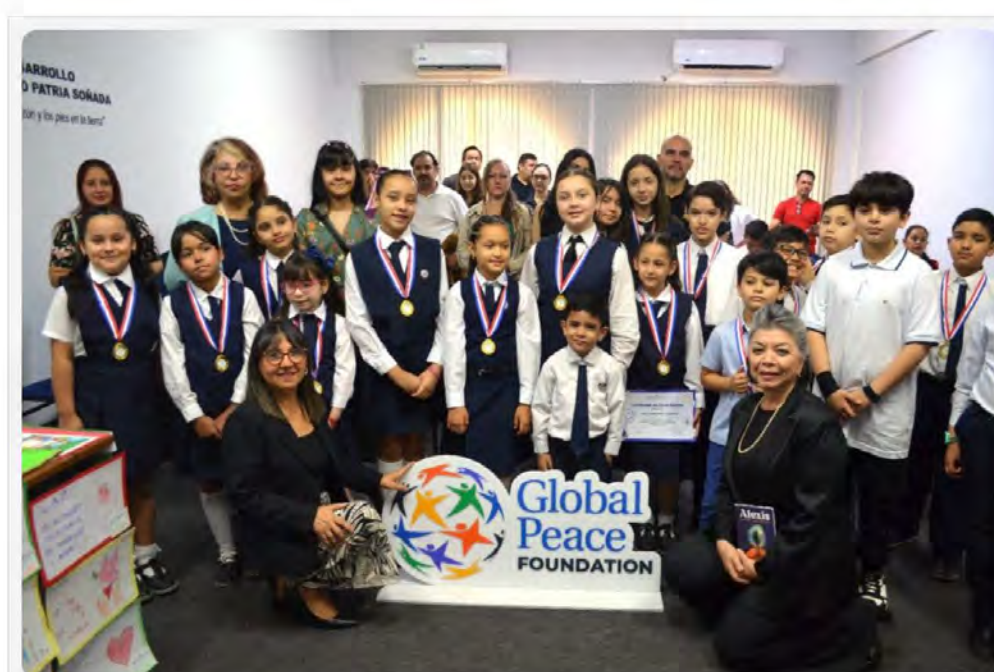
Students and teachers join Global Peace Foundation representatives during the award ceremony of the second “Narrating Peace” Literary Contest in Asunción.

Students, teachers, and families gathered on Friday, December 5, 2025, to celebrate the winners of the Second “Narrating Peace” Literary Contest, an initiative of the Global Peace Foundation that encourages children to explore the meaning of peace through creativity and imagination.