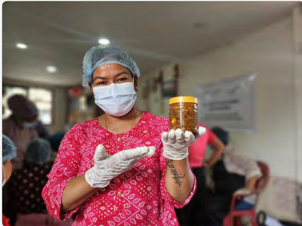
A participant showcases her product from pickle-making training.

The training commenced on July 22, 2025, with a session titled “Self-Confidence for Women Entrepreneurs,” which focused on mental well-being, self-worth, and building an entrepreneurial mindset. Participants engaged in interactive exercises and group discussions that fostered confidence and readiness for business ventures.