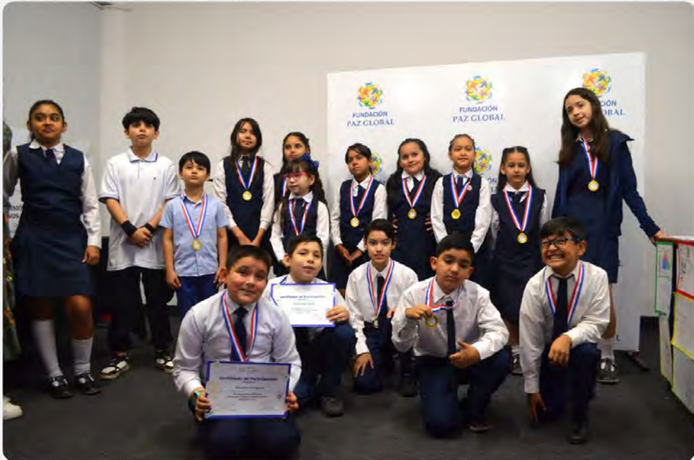
Young writers and artists pose following the awards ceremony of the second "Narrating Peace" contest.

Seventeen students participated in this year's edition, each offering a unique interpretation of peace and its various expressions in daily life.