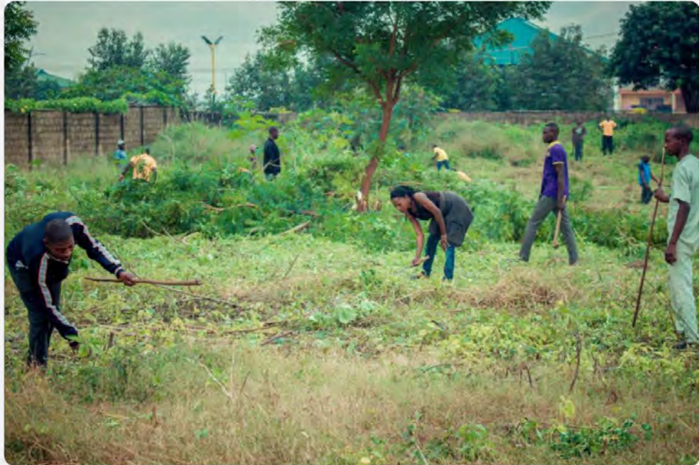
Participants during the cemetery work