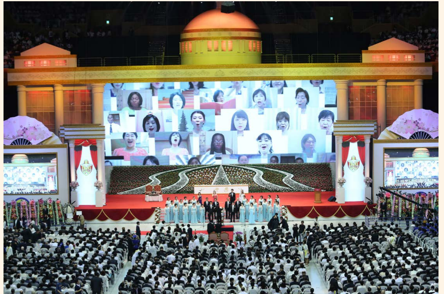
1. True Mother leading the Third Universal Seonghwa Memorial 2. True Mother makes a floral tribute to True Father