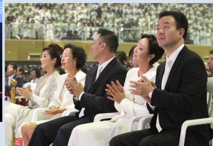
1-4. A scene from the commemorative musical – A Person Who Loved Japan More than Anyone Else 5. Leaders from across the world enjoying the commemorative musical