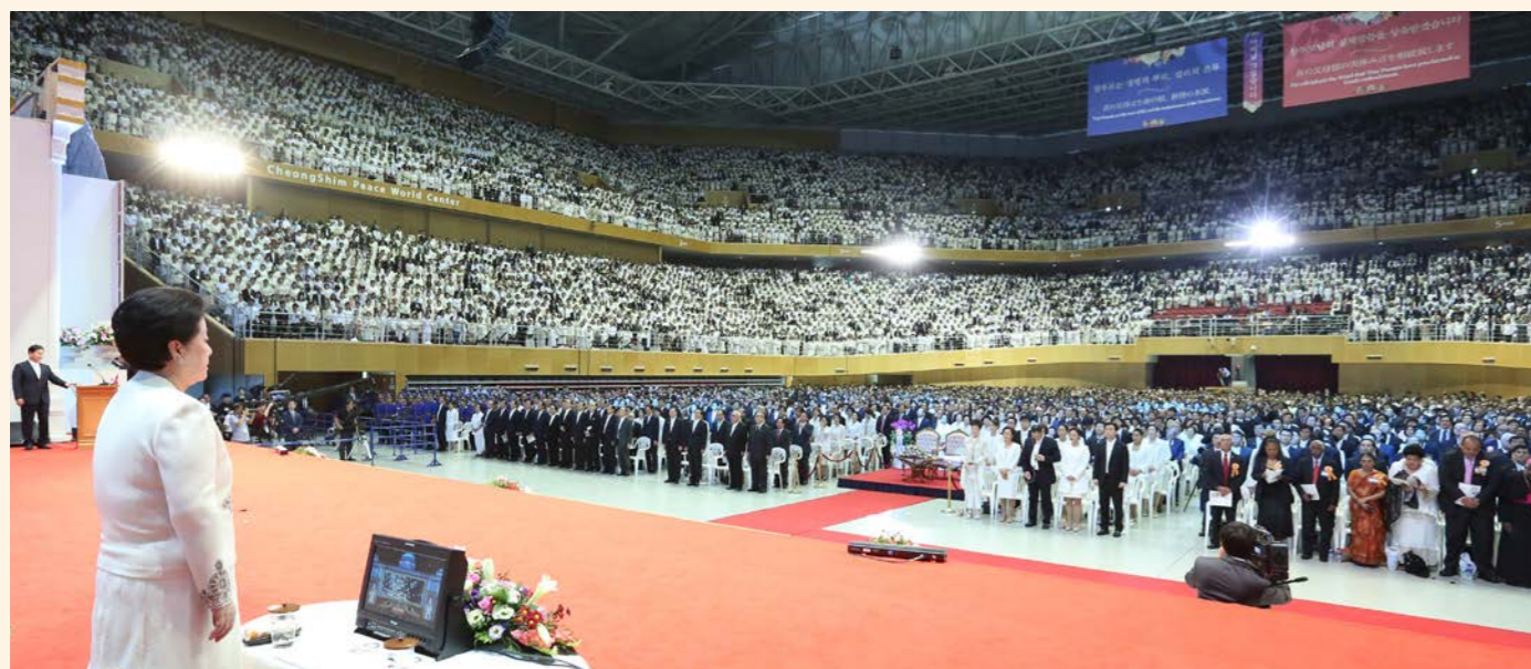
1. True Mother leading the Third Universal Seonghwa Memorial 2. True Mother makes a floral tribute to True Father 3. Children and grandchildren of the True Family make floral tributes