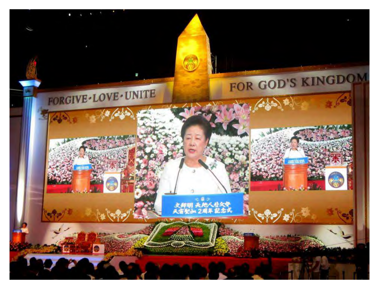
Unite In One Heart, One Body, One Mindset and One Harmony

Humankind is now living in a blessed era where the Second Advent of the Lord has occurred on this earth. The Lord has found his bride, God's only-begotten daughter, and they have manifested as the True Parents. All of humankind needs to meet the True Parents, who are the representatives of the Heavenly Parent. They should attend and follow the True Parents. Only then can they eradicate original sin, which has been passed down for six thousand years.