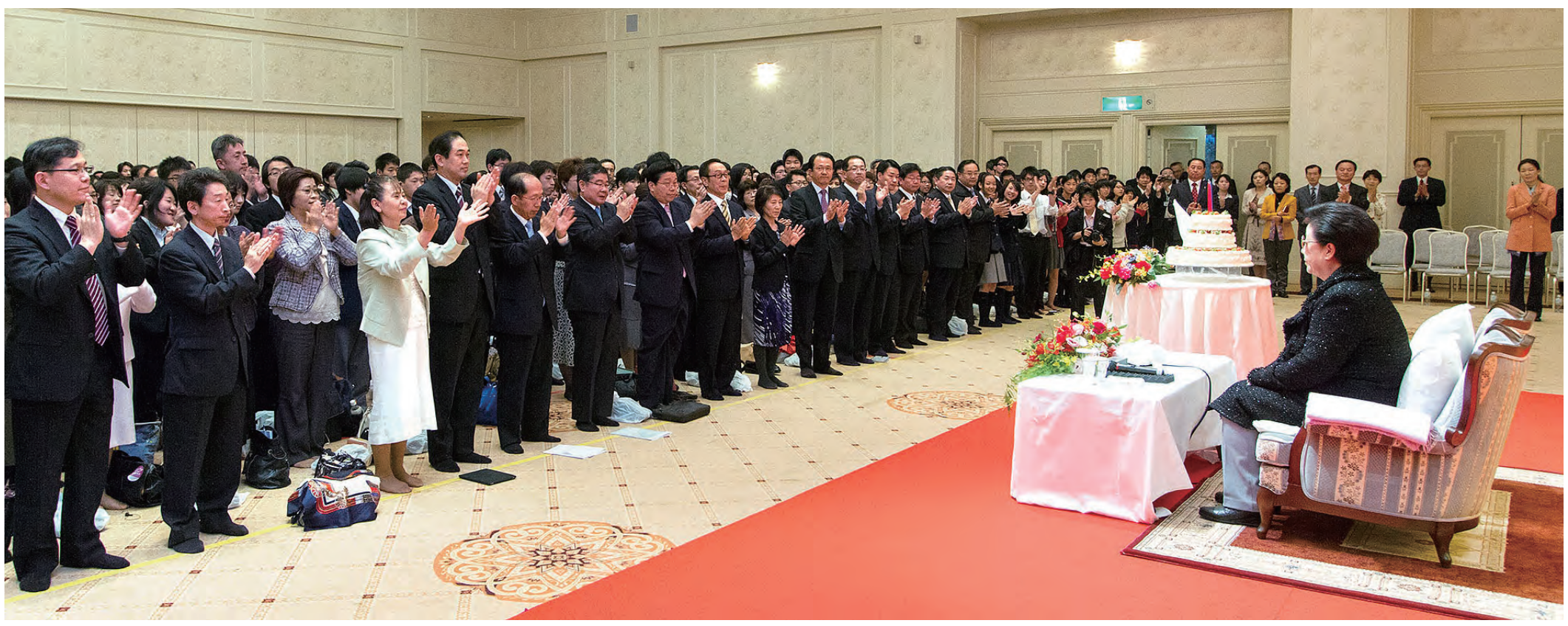
Church members of Hokkaido and Tohoku regions welcome True Mother with applause

characters!" Original point of 55-year mission inscribed at the commemorative rally