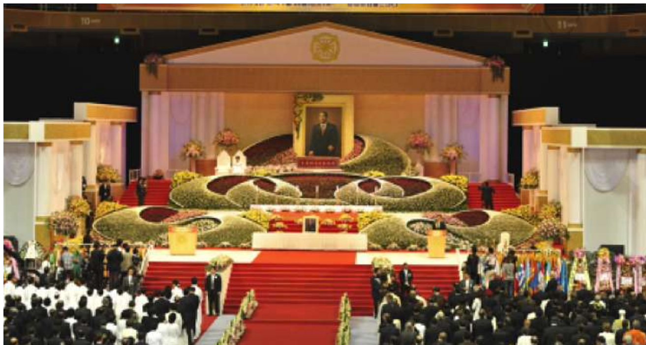
Rev. Sun Myung Moon's Seonghwa (Ascension) Ceremony held on September 15, 2012 in Korea.

Rev. Moon was a peace-loving world citizen. In his autobiography, he reflected on his life this way: "Since I was called by God at Mount Myodu, I have lived life like a marathon athlete who only runs for God's will. It wasn't a life that could compromise. It was a life of blood, sweat and tears." In the Bible Jesus said, "a prophet hath no honour in his own country." At the one-year anniversary of Rev. Moon's Seonghwa, many will gather in Rev. Moon's homeland to evaluate his extraordinary life properly.