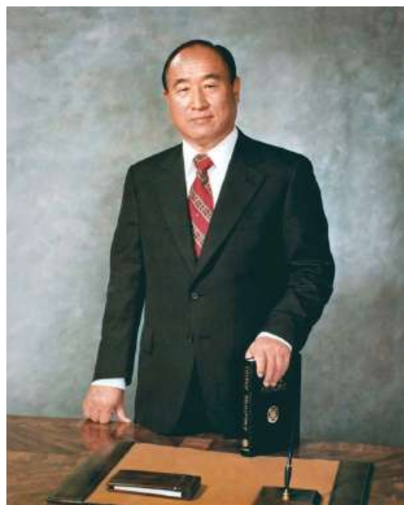
Official Seonghwa portrait of Rev. Sun Myung Moon.

The Memorial ceremony for the one-year anniversary of Rev. Sun Myung Moon, founder of the Family Federation for World Peace and Unification (FFWPU) will be held at the Cheongshim Peace World Center in Gapyeong, Korea on August 23, 2013 at 10 a.m. Upwards of 25,000 people are expected to attend. The official title for the ceremony is "The First Anniversary of the Universal Seonghwa of Sun Myung Moon, the True Parent of Heaven, Earth and Humankind." A full week of memorial events in Gapyeong starts on August 17th and will end on Saturday, August 23rd.