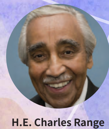
US House of Representatives Korean War veterans