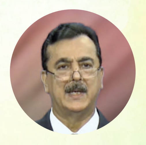
H.E. Yousaf Raza Gillani Prime Minister of Pakistan (2008~2012)

We have an opportunity to realize our common bonds of humanity. The pandemic threatens us all and we can only overcome this together.