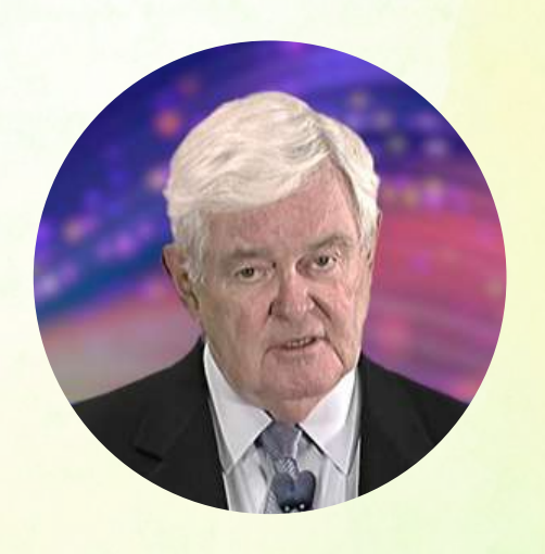
Hon. Newt Gingrich Speaker of the US House of Representatives (1995~1999)

We can reach across national boundaries, we can reach across parties and differences, and we can find a way to create a dramaticall better future for our children and our grandchildren.