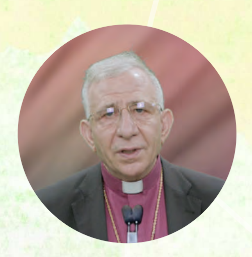
Bishop Munib Younan Bishop Emeritus of the Evangelical Lutheran Church (2010 – 2017)

As the world suffers from the Covid-19 crisis, working together, enhancing international cooperation and universal solidarity are essential and indispensable for our common interest.