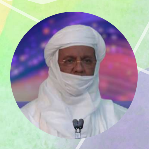
H.E. Brigi Rafini Prime Minister of the Republic of Niger

We must promote mutual love, mutual respect, and the value of humanity, coexist peacefully and harmoniously, and respect the diversity of faiths, religions, and cultures within and between societies.