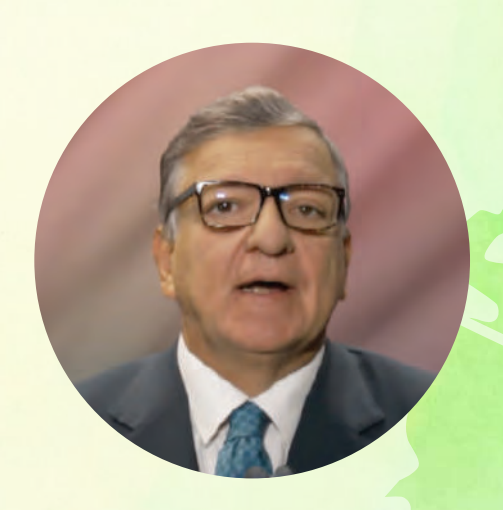
H.E. Jose Manuel Barroso

We know that true peace comes about when people can unite and the best way to come together is to recognize that there are universal values that can serve as a compass setting for everyone.