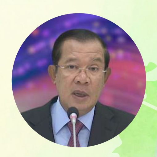
H.E. Hun Sen Prime Minister of the Kingdom of Cambodia

Self-centeredness is not an option if we are to bring victory. Rather we need to work in solidarity and human fraternity, as UPF has always done.