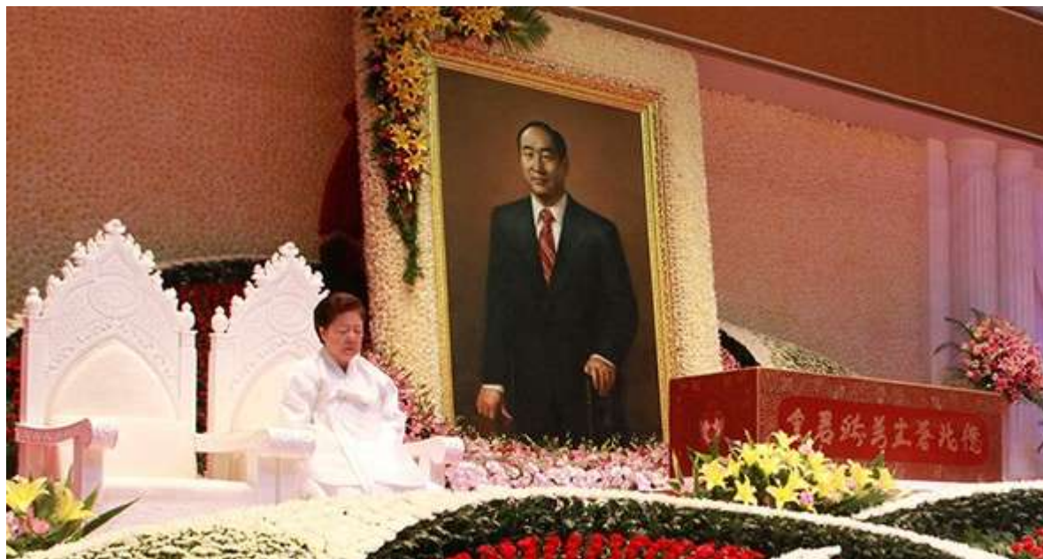
Dr. Hak Ja Han Moon sits in one of two seats reserved for her and her late husband Rev. Sun Myung Moon during Rev. Moon's Seonghwa, or ascension, ceremony on Saturday, Sept. 15, 2012 at the Cheong Shim Peace World Center in Gapyeong, Korea.

2012 marked a pivotal year in the history of the Unification Church when its founder, the Rev. Dr. Sun Myung Moon, ascended to the Spirit World on September 3, 2012. Indeed, to some Unificationists, it seemed that the Mayan prediction that 2012 would usher in universal catastrophe rang true, yet for others, the recent changes within the leadership of the church have established a sturdier foundation on which the worldwide Unificationist community can rise to new heights.