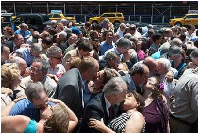
Approximately 200 of the 8,000 couples joined in marriage by Rev. and Mrs. Sun Myung Moon in 1982 gathered on the sidewalk opposite Madison Square Garden for a historic “unison kiss” photo shoot during their 30th Anniversary celebration.

June 19-24, 2012: More than 80 young Unificationists gathered for the Collegiate Association for the Research of Principles (CARP) America’s first retreat, “Live Life on Purpose,” at the Angeles Crest Christian Camp in La Canada, CA.