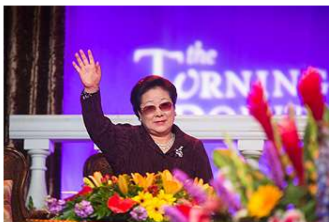
The 20th National Women's Federation for World Peace (WFWP) assembly, attended by more than 1,200 people, marked Dr. Hak Ja Han Moon's third public appearance at a WFWP event.

International news in 2012 that provoked thought and action amongst church members included the discovery of a fourth-century fragment of papyrus that mentions Jesus' wife, which some scholars view as a reinforcement of the Unification Church's belief that Jesus intended to marry and have a family; the elemental devastation of Hurricane Sandy, which distressed Unificationists in the New York- and New Jersey areas but inspired actions of goodwill among those less affected by the storm; and the election of the first female president for South Korea, Geun-Hye Park, on December 19, 2012, which seemed to reinforce Rev. Sun Myung Moon's recent and consistent message of a new era emerging in which women will have unprecedented influence in politics, economics and culture.