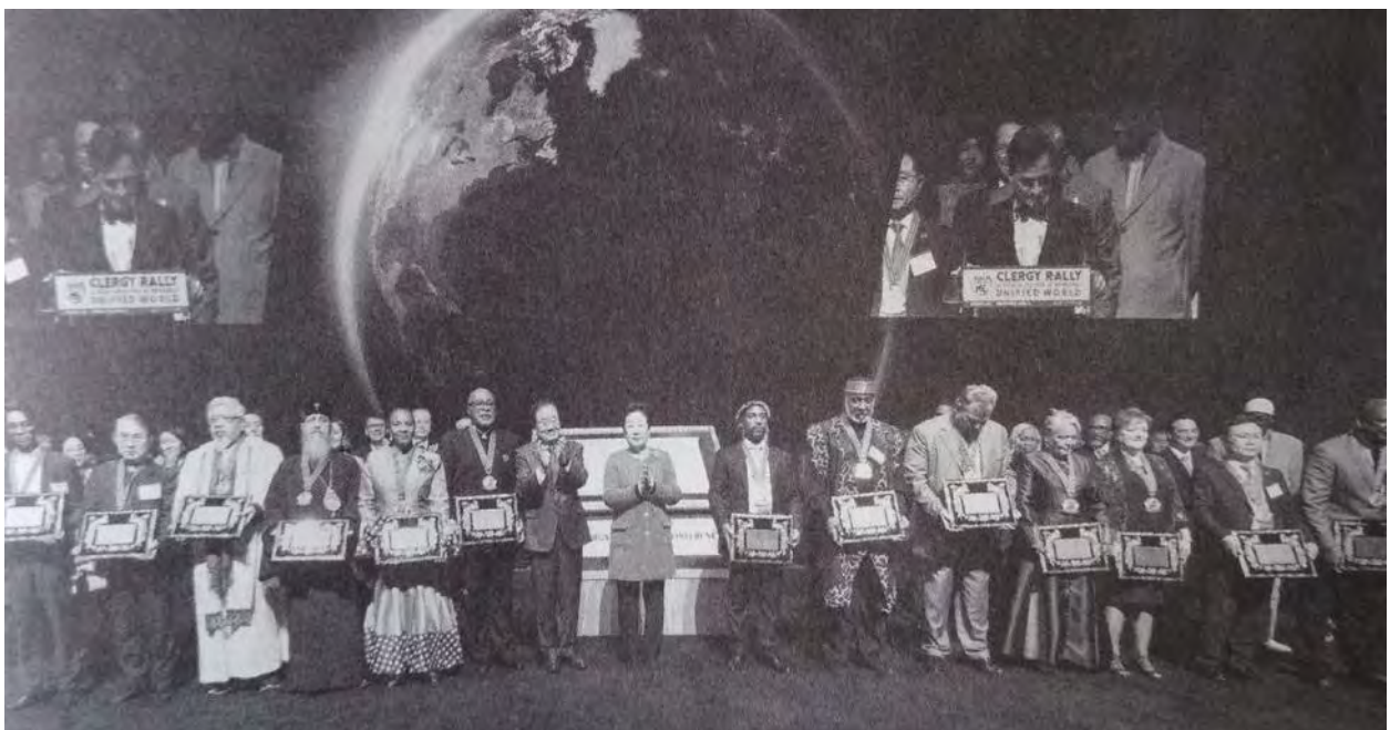
December 28, 2019: World Clergy Leadership Conference (WCLC), Rally of Hope, Newark, New Jersey