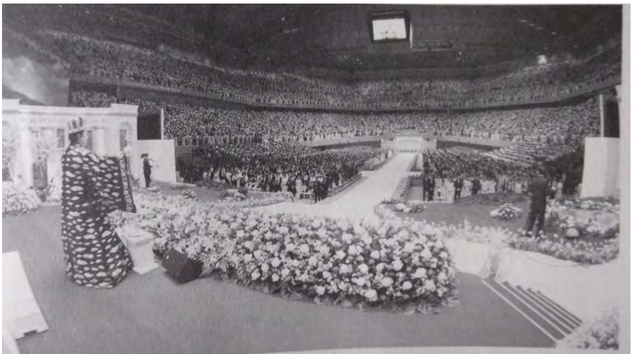
February 22, 2013: Mother Moon proclaiming the coming of God's kingdom of Cheon Il Guk at the Peace World Center, HJ Cheonwon, South Korea

Standing before True Father's holy body in 2012, I promised in tears, "By the end of my days, I will absolutely bring about the settlement of Cheon Il Guk on this earth!" Whenever the opportunity arises, I repeat these words. After True Father's ascension, I set forth like a female Don Quixote spreading our teachings and embracing the world, I have lived every day with my promise to Father Moon in mind.