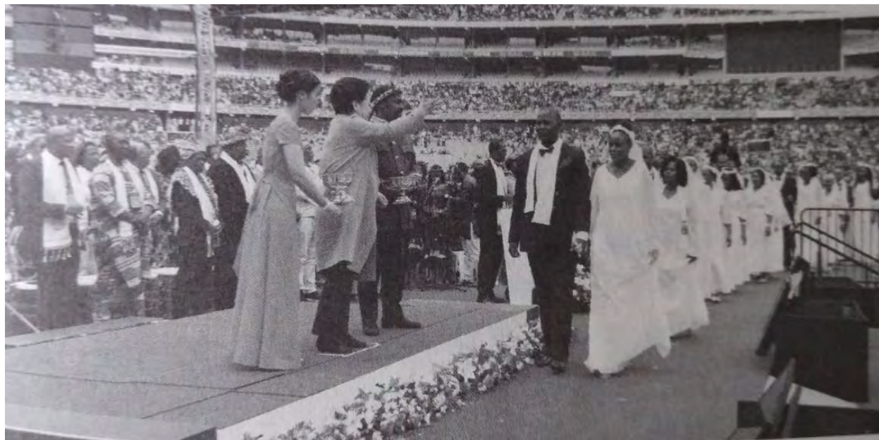
December 7, 2019, Marriage Blessing Ceremony for 200,000, Johannesburg, South Africa

Among them was the king of South Africa's largest tribe, the Zulus. The Zulu tribe is famous for resisting conquest by European forces and for playing a key role in shaping the identity and tradition of modern-day South Africa. Assembling such a galaxy of distinguished couples and witnesses on stage added to the significance of the Blessing Ceremony.