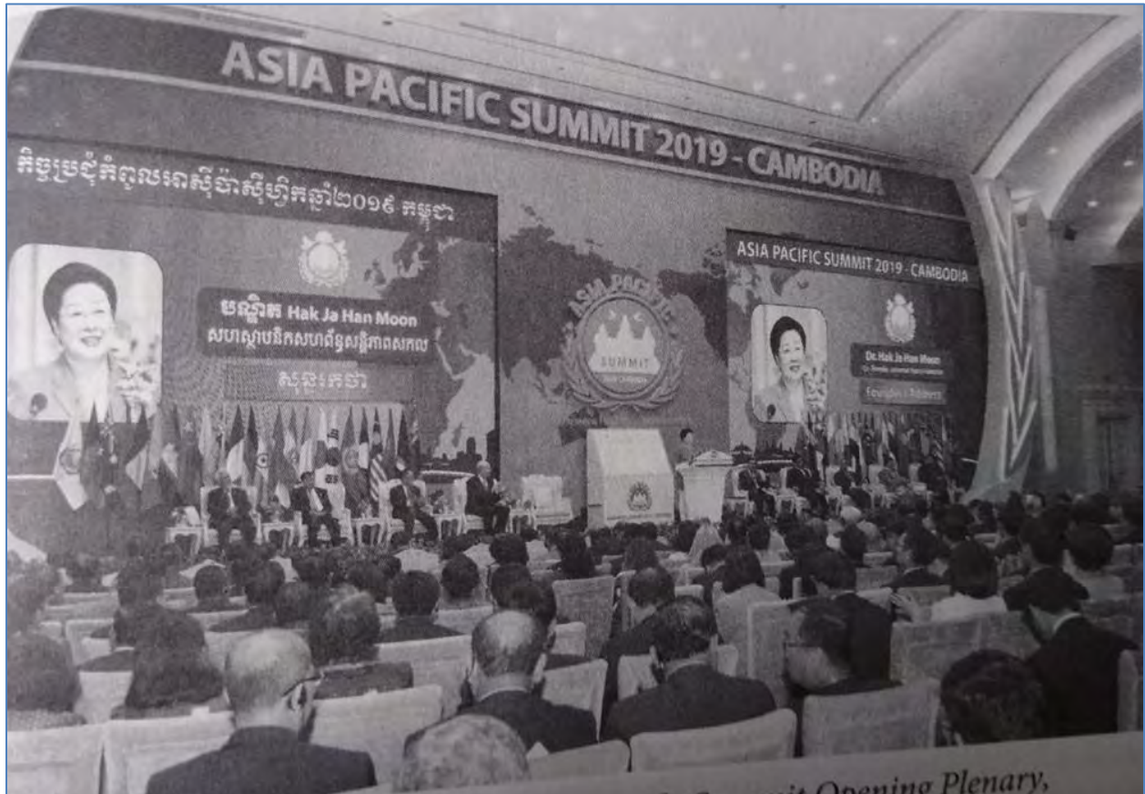
November 19, 2019: The Asia Pacific Summit Opening Plenary, Phnom Penh Peace Palace, Cambodia

have been very pleased with the outcome of the Summit.