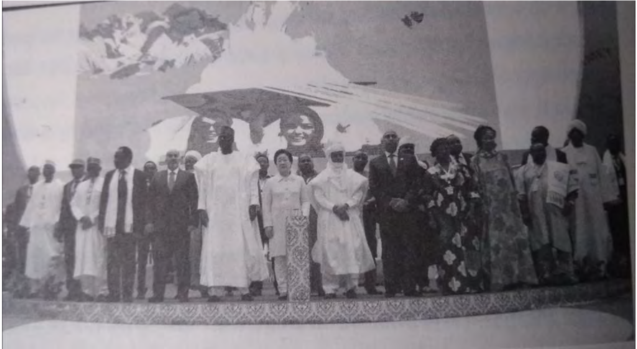
November 29, 2019: The Family Renewal and Blessing Festival in Niamey, Niger