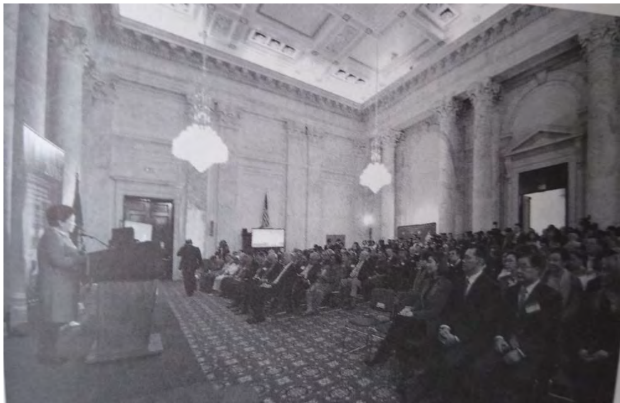
November 30, 2016: Establishment of the International Association of Parliamentarians for Peace, Kennedy Caucus Room, Russell Senate Office Building, Washington DC

Our final rally took place in Washington, DC. The choice of venue for this IAPP conference, which was the culmination of all previous efforts, was very important. In the end, members of the United States Senate offered the Kennedy Caucus Room one of the Senate's most prestigious and historic rooms, as the event location. I was told by the Senate sponsors, "There are many rooms available for the launching ceremony. However, in view of this meeting's important to us, we will prepare the Kennedy Caucus Room."