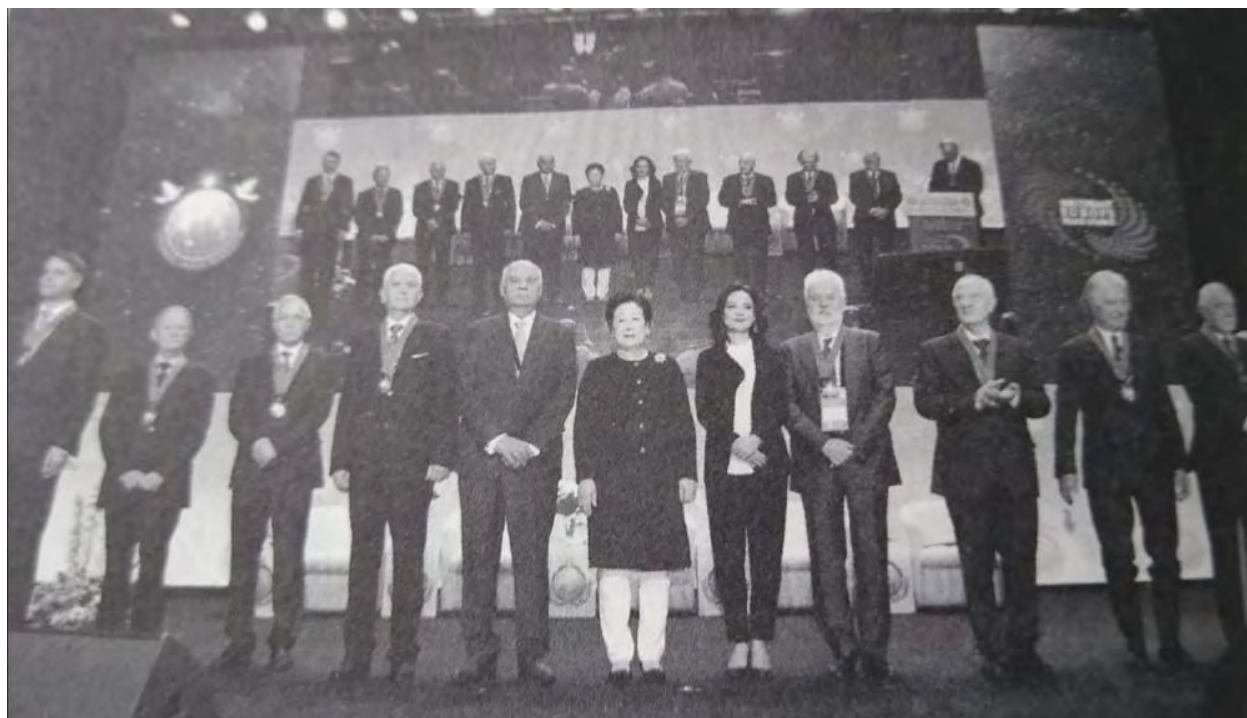
October 26, 2019: Southeast Peace Summit 2019, Palace of Congresses, Tirana, Albania

Earlier that same day, former President Moisiu, now a sprightly 90-year old and Senior Minister Elisa Spiropali welcomed me on behalf of the government to speak to the Albanian people at the Summit. We were joined on stage by President Hashim Thaci of Kosovo and President Stevo Pendarovski of North Macedonia, and the event was broadcast on national television.