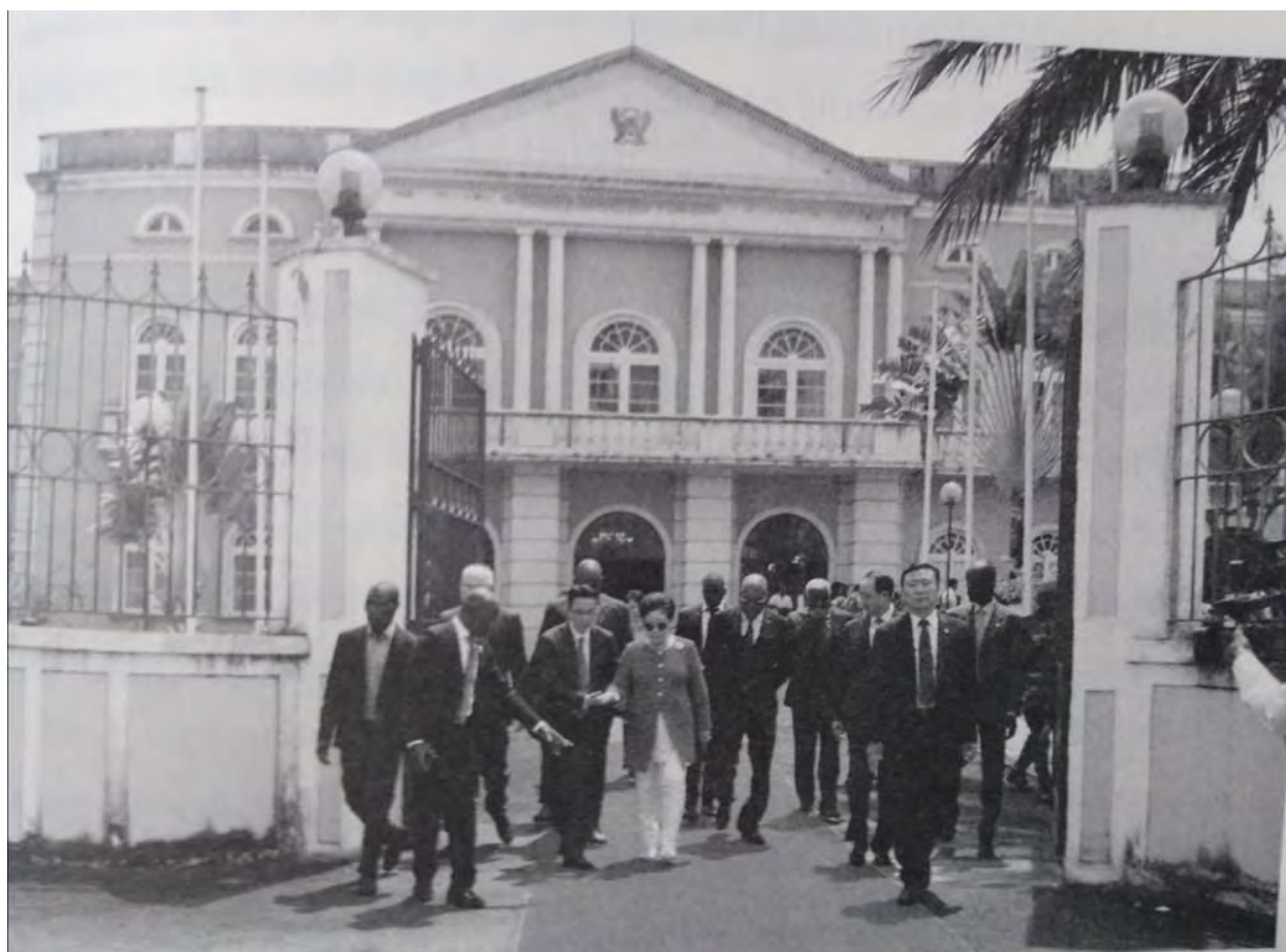
September 4, 2019: At Sao Tome and Principe's presidential palace

This is a beautiful equatorial island nation in the Gulf of Guinea off the coast of Central Africa. It gained its independence from Portugal in 1975. After we had traveled for more than 40 hours, including two layovers, the government of Sao Tome offered an extraordinary welcome. Cabinet ministers welcomed me warmly at the airport, and the next day His Excellency, President Evaristo Carvalho welcomed me at the Presidential Palace for a private meeting. Following our cordial meeting, the Presidential honor guard escorted me to the National Assembly building to open the Summit.