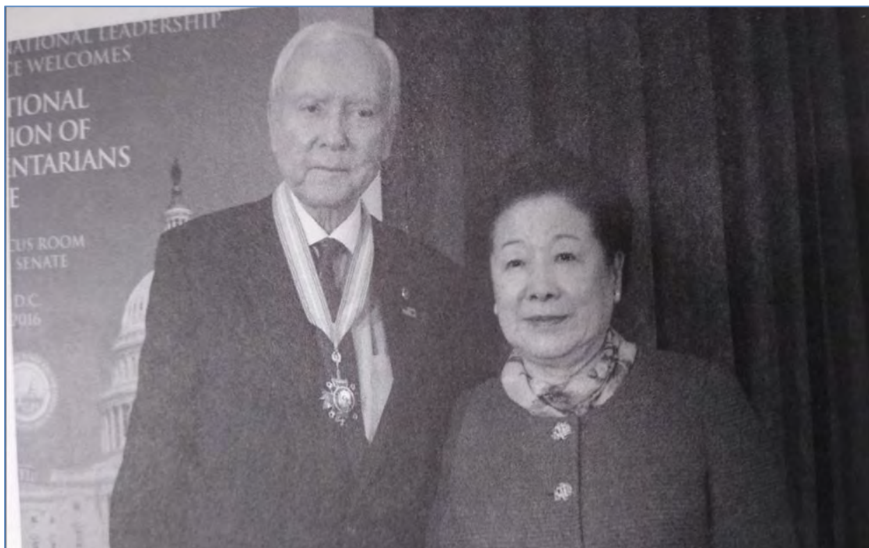
November 30, 2016: Mother Moon with US Senator Orrin Hatch at the United States Capitol

young, I learned Father and Mother Moon's principles of peace, and today I continue to practice their peace philosophy."