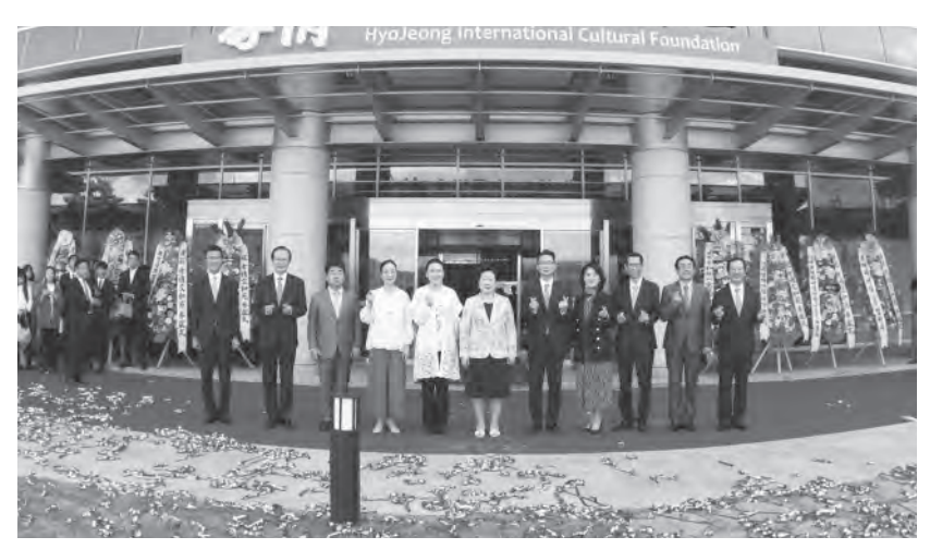
August 11, 2019: Dedication of the Hyojeong International Cultural Center, HJ Cheonwon, South Korea

After a warm welcome by Nepalese students and citizens upon the arrival in Kathmandu, the Little Angels performed brilliantly at the inauguration of the International Association of Parliamentarians for Peace, an event that took place in 2016. The Nepalese were deeply moved by the concert held at the presidential palace as well as in other performance halls, and their media gave the Little Angels high praise: "The Little Angels are representatives who are answering God's call; they are guardian angels, spreading peace worldwide."