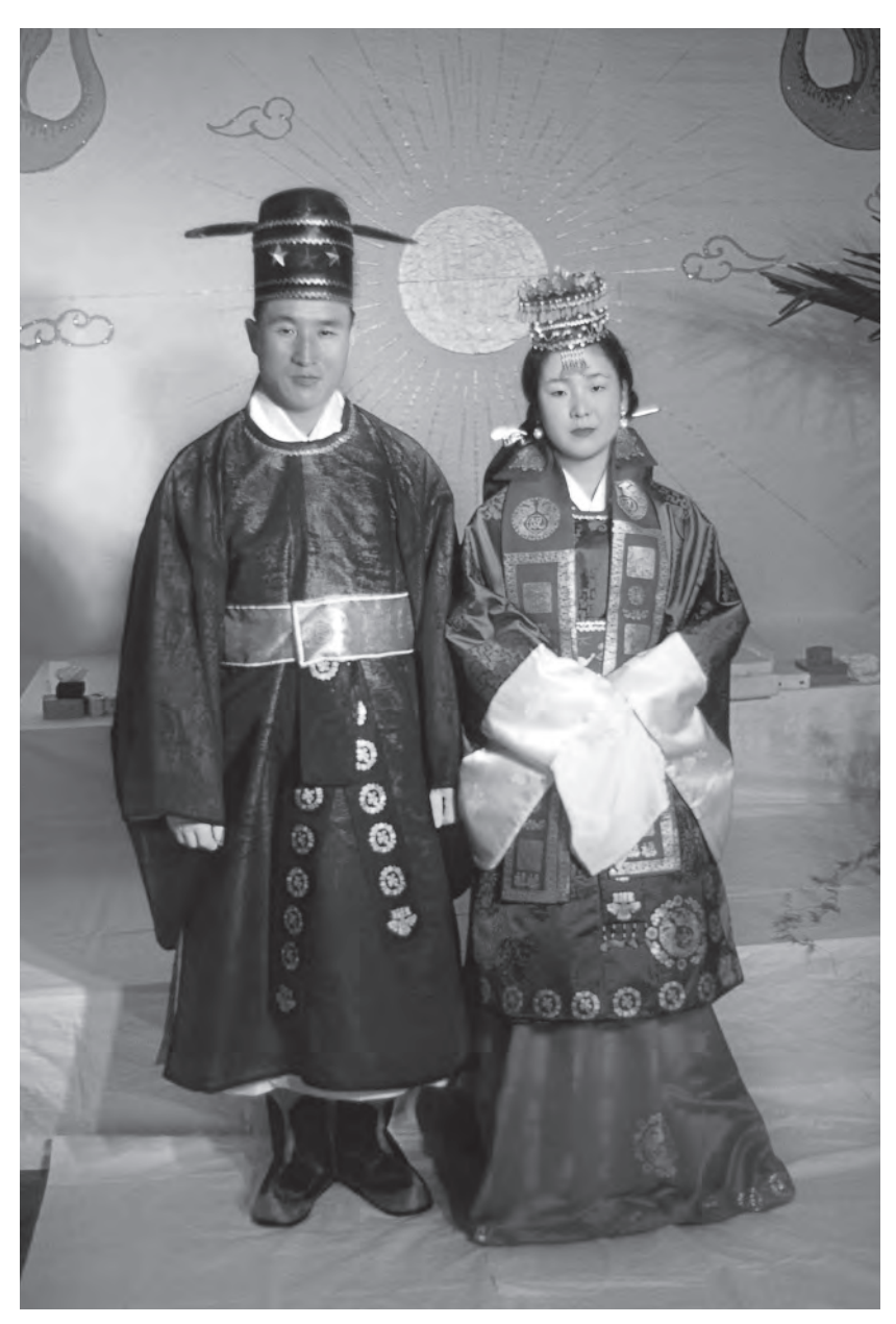
April 11, 1960: The second part of the Holy Wedding, in traditional Korean attire