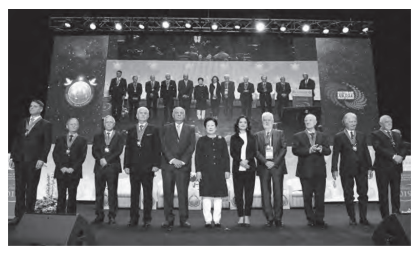
October 26, 2019: SouthEast Europe Peace Summit 2019, Palace of Congresses, Tirana, Albania

Finally, the challenge was fulfilled in October 2019 during the South-East Europe Peace Summit when 3,000 energetic school and college students gathered for the Youth and Students for Peace Rally in Tirana, followed by the launch of the Balkans Peace Road.