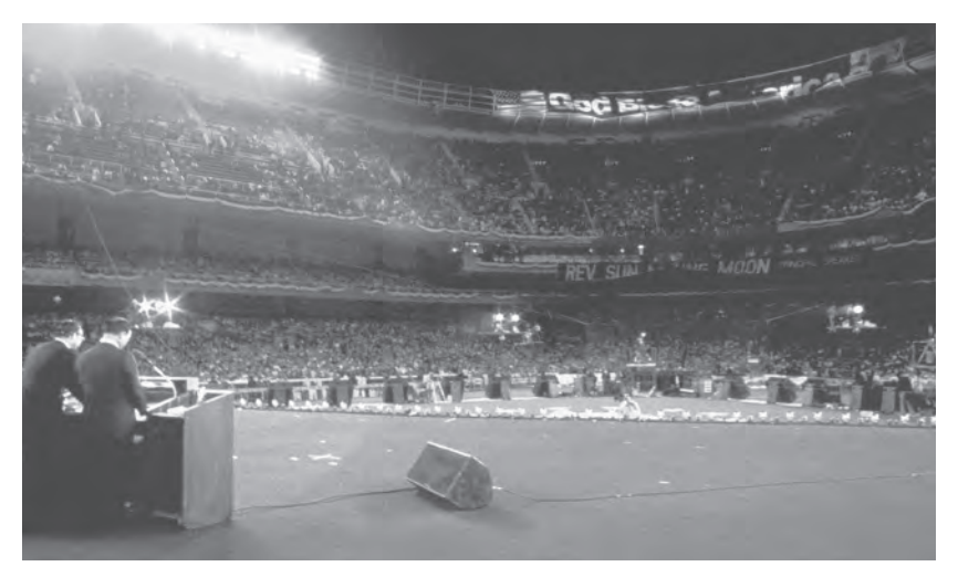
June 1, 1976: The God Bless America Festival, Yankee Stadium, New York

the tri-state area and our supporters from other states and nations gathered.