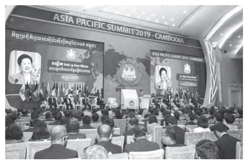
November 19, 2019: The Asia Pacific Summit Opening Plenary, Phnom Penh Peace Palace, Cambodia

Pacific civilization, the final point of settlement in Heaven's providence. I stated that the Pacific civilization will be one of true love characterized by attendance to God as the Heavenly Parent. In the presence of several current and former heads of state and ambassadors, His Excellency expressed support for the vision of regional peace anchored in the Asia-Pacific Union initiative I had proposed.