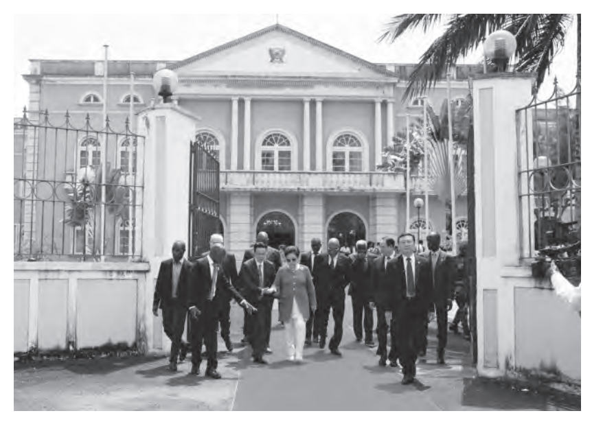
September 4, 2019: At São Tomé and Príncipe's presidential palace

Presidential honor guard escorted me to the National Assembly building to open the Summit.