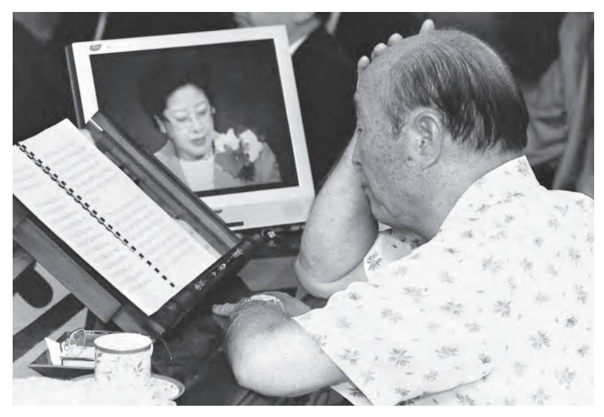
Father Moon attends Mother Moon's speech via the internet

Over the months following that event, I traveled the world to encourage women leaders and launch a true women's movement that could win the