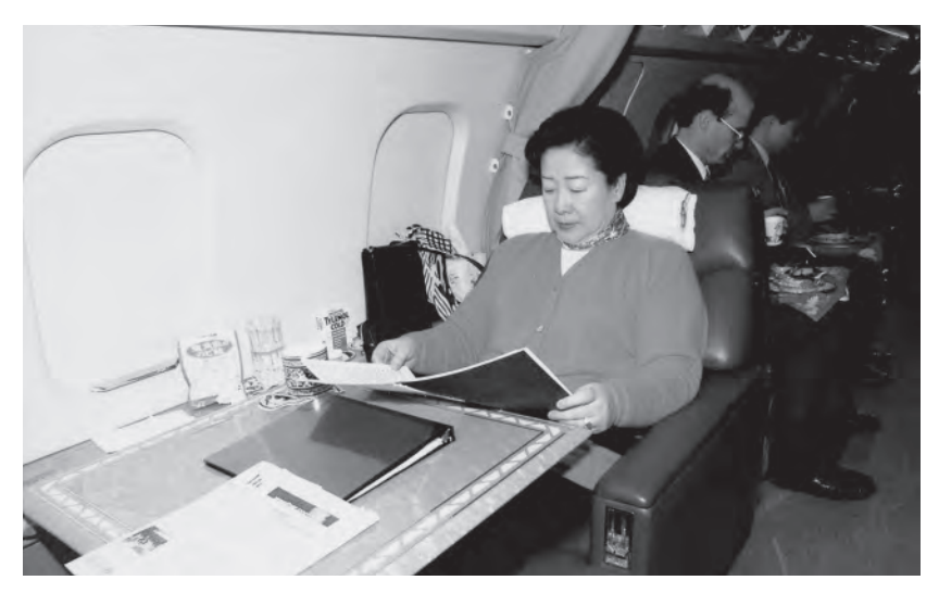
Mother Moon studying her speech as she travels between countries