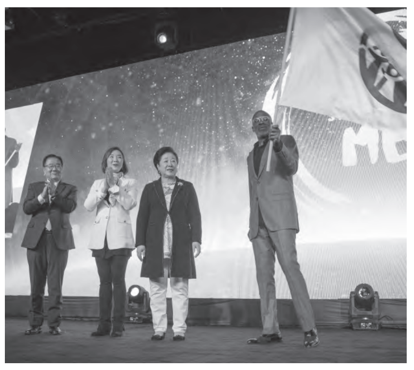
April, 2019, Mother Moon with Bishop Noel Jones of the City of Refuge Church, Los Angeles

True Parents. Who are the chosen people of this age? The answer is, you! You are the chosen people centered on True Parents in the 21st century."