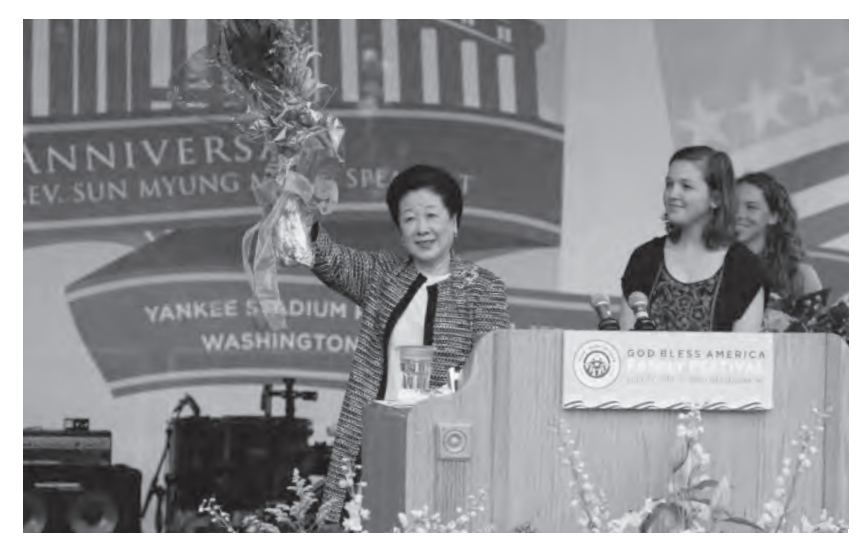
2016: The 40th anniversary of the Yankee Stadium Rally, Belvedere, New York

backgrounds. My husband and I toured the United States to encourage and inspire not just the public, but our members. We called them to establish schools, create newspapers, get their doctorates, link cultures through programs such as the Little Angels, dance troupes and rock bands, raise funds going shop to shop and door to door, create home churches, fish businesses and restaurants, and organize volunteer service projects. On every path we trod, the blood, sweat and tears of our frontline missionaries, domestic and international, continued to flow. I was constantly in prayer.