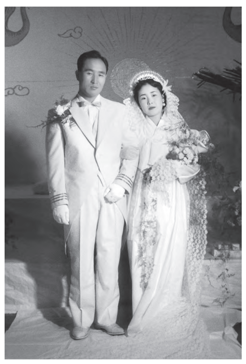
April 11, 1960: The first part of the Holy Wedding, in western attire