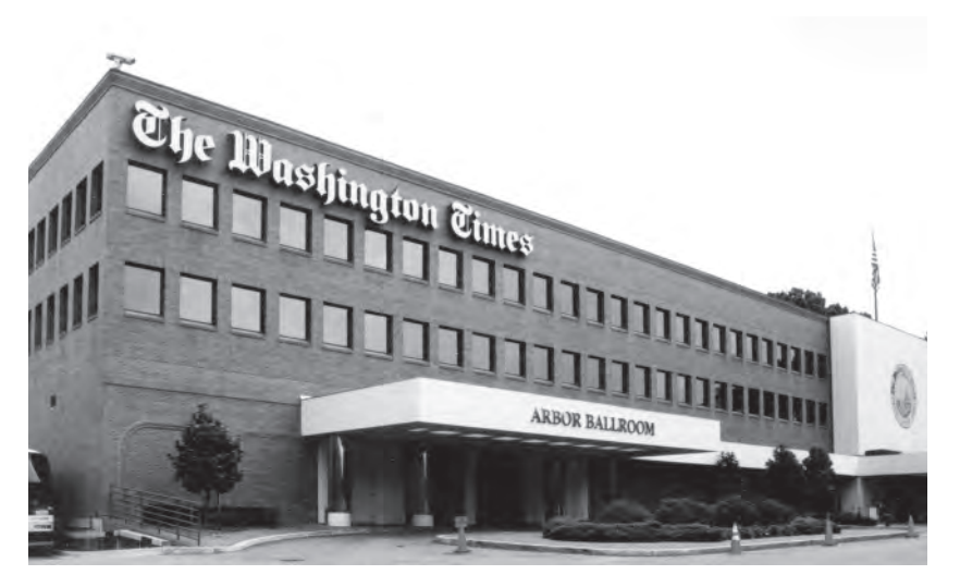
May 17, 1982: The Washington Times, Washington, DC

There was a need for a newspaper in Washington that would protect faith, freedom and family values, and no American conservatives were willing to step into the breach. When my husband and I decided to take this on, people trying to be prudent and wise told us again and again that it would be difficult to publish a new newspaper in the capital of the United States. We had never shied away from a task because it was difficult, and we didn't then.