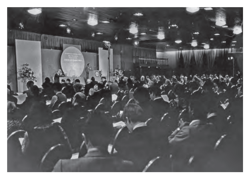
Father Moon gives the founder's address at an early ICUS

By 1981, when we held the 10th ICUS in Seoul, 808 scholars attended from approximately 100 nations; ICUS had become the leading global forum of its kind. During that event, we proposed the free and generous exchange of technology among nations, something that had never been imagined in history. Our view is that because science and technology are revealed and given by God, they are the common wealth of all humanity. We emphasized that no country should monopolize these common assets. My husband and I sponsored the ICUS forums to promote the free exchange of science and technology.