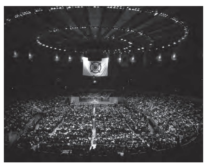
September 18, 1974: The New Future of Christianity rally, Madison Square Garden, New York

On the heels of our meeting with the president, we went out again, this time to speak in 32 cities, completing our coverage of all 50 states, including Alaska and Hawaii. At first, most Americans were perplexed to hear about a Christian leader from the East. But to know us is to love us, and wherever we went, people were touched and took something valuable from our message. Public interest increased by the day, and with it came controversy.