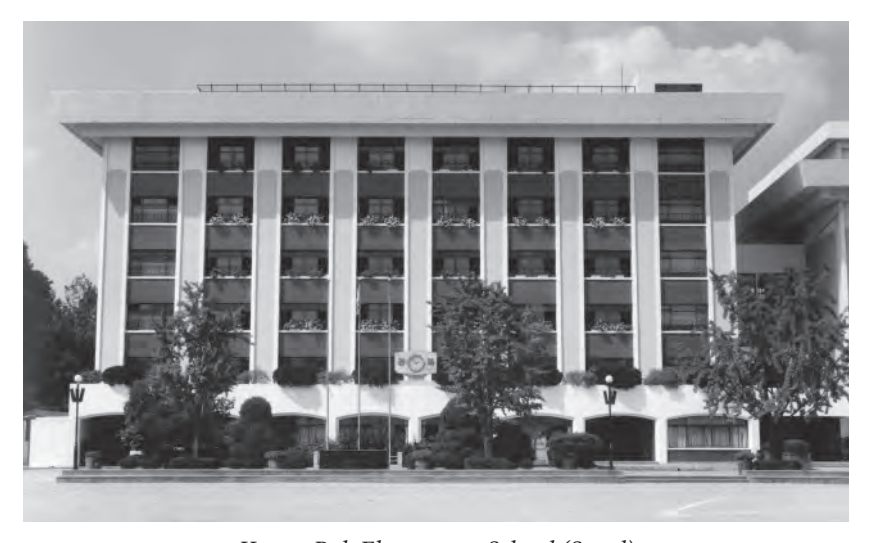
Kyung Bok Elementary School (Seoul)

Despite the postwar chaos, I graduated from Seongjeong Girls' Middle School in Seoul. I cannot forget that school, my alma mater and cradle of my life. The school you attend during your teenage years can be a significant influence on your future. When I visited the school 30 years later, its name had changed to Sunjung, but some of my teachers were still there. They remembered me and, of course, I had not forgotten them. We were overjoyed to see one another and talked for a long time about those difficult days in the past.