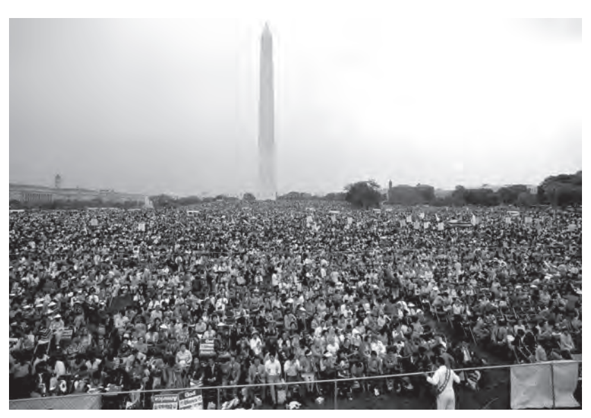
September 18, 1976: The God Bless America Festival at Washington Monument, Washington DC.

Arrayed against us at the Yankee Stadium and Washington Monument events were more than 30 opposition groups, including the US Communist Party. Nonetheless, without a trace of fear or the remotest consideration about pulling back, my husband and I set aside our personal safety and dedicated our lives to the future of the United States. We invested all we had to wake up the American churches and people to the reality of God, the truth of the Bible and the supreme importance of God-centered marriage and family life, beyond race, nation and religion. Declaring this message on the vast expanse of the National Mall was our goal, and nothing could change that.