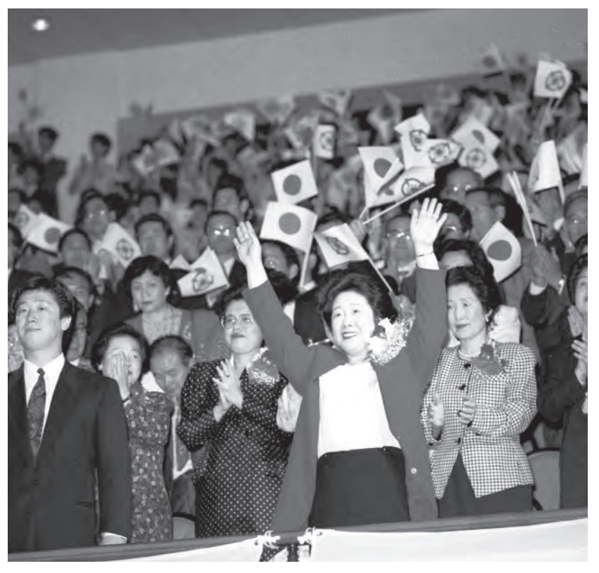
September 18, 1991: Mother Moon at a speaking event in Japan, with eldest son Hyo-jin

time, the path of a true wife and the path of a true daughter. Women have the magical power to create harmony and to soften hearts. Brides build bridges. The world of the future can be a world of reconciliation and peace, but only if it is based on the maternal love and affection of women. This is the true power of womanhood. The time has come for the power of true womanhood to save the world.