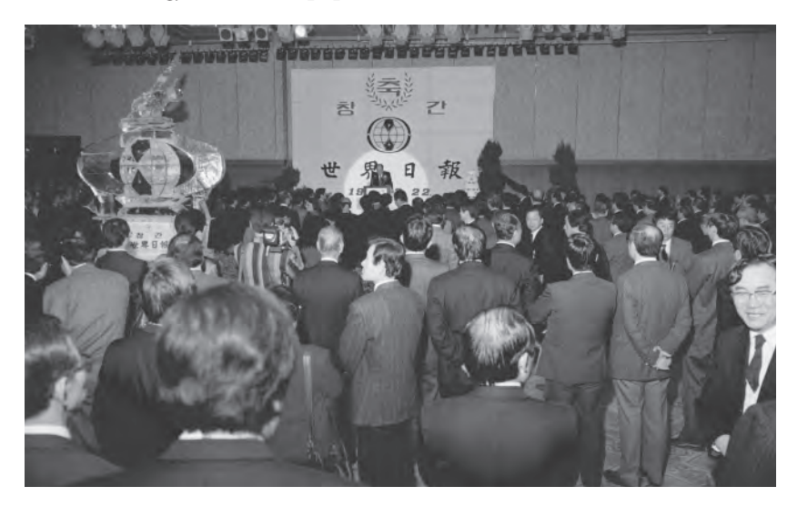
February 1, 1989: Founding of Segye Ilbo, Seoul, Korea

As well as launching newspapers in Japan and the United States, our movement launched Tiempos del Mundo in Latin America and The Middle East Times in Istanbul. But it was only in 1989 that the Korean government instituted the freedom of the press that allowed us to launch the Segye Ilbo newspaper in Seoul.