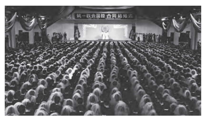
October 30, 1988: The 6,500-couple International Blessing Ceremony brought thousands of multicultural families to Korea.

especially seen after our International Blessing Ceremony for 6,500 Korean-Japanese couples in 1988, the year the Summer Olympics was held in Seoul.