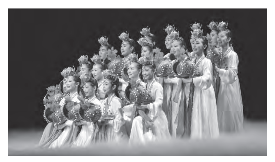
Founded in 1962, the Little Angels have performed some 7,000 times around the world.

my husband coined the Korean word, "shimjeong," is the essence of beauty and original root of love. It is beauty that stimulates love to surge forth eternally. The culture of heart transcends time and space. In the world where God's will has been realized, a pure and immaculate culture of heart will flow forth like a river and waft like a breeze through all forms of artistic creativity.