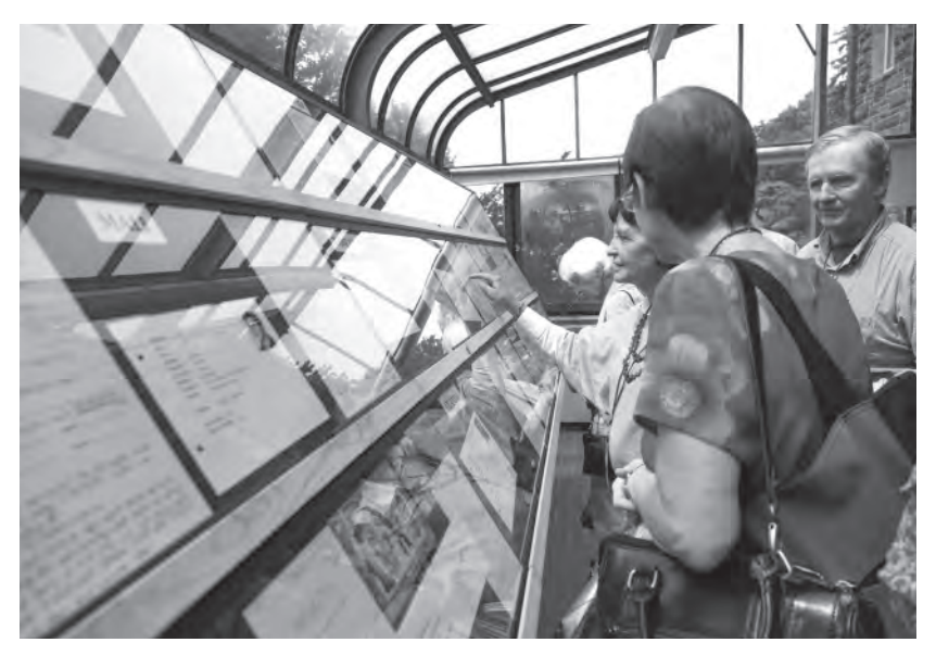
May 2017: At a reunion for the 1975 international missionaries, participants review a display of their original reports and letters, now carefully archived at the East Garden Museum in Irvington, New York.

my husband's words, shared late one evening: "There will always be reasons that we cannot send them. But if we do not send them now, we will never send them. There will never be a moment without difficulties. Let us make a firm decision when things seem the most difficult."