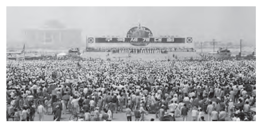
June 7, 1975: the World Rally for Korean Freedom, Yoido Plaza

Without a moment's rest, we held even more rallies that impacted the world. Our confidence to fill large arenas led to greater gratitude to God, our Heavenly Parent, and to our members who were, and are, devoted to Heaven's principle and providence. In the midst of this, in Korea, we displayed the power of the Victory Over Communism (VOC) movement at a rally of 1.2 million on Yoido Island in Seoul. This led to a nationwide movement aimed at the reunification of North and South Korea in the 1980s. The VOC teaching spread beyond Japan and Asia. Through the Confederation of Associations for the Unity of the Societies of the Americas (CAUSA), leaders in the Western Hemisphere, including national leaders in Latin America and 70,000 members of the clergy, attended the CAUSA workshops.