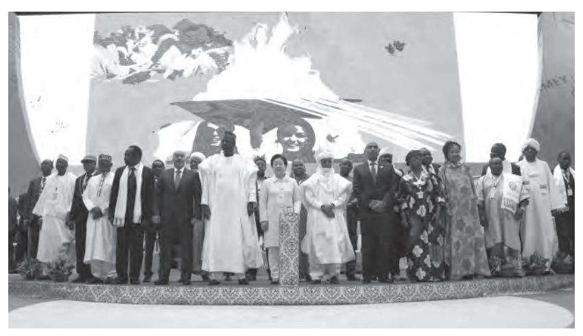
November 29, 2019: The Family Renewal and Blessing Festival in Niamey, Niger

proclamation, beginning in June, the Universal Peace Federation and other organizations began working to secure the support and participation of African governments in the "Heavenly Africa Project," a package of 10 projects aimed at promoting peace and development that includes the True Family Blessing Movement. At times, it took as many as 10 days for our delegates to meet with a head of state. As it wasn't unusual for meetings to be rescheduled, our delegation would skip meals and be on standby for many hours to ensure the meetings would happen.