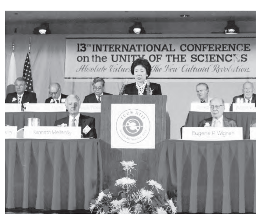
September 2, 1984: The 13th ICUS in Washington DC. Mother Moon read the welcoming address on behalf of her husband.

That did not happen. Quite the opposite: the number of our members and allies only increased. People understood that the US government had sent Father Moon to serve an unjust prison sentence for the crime of dedicating his life for the salvation of humanity. In their innermost hearts, all people cherish religious freedom.