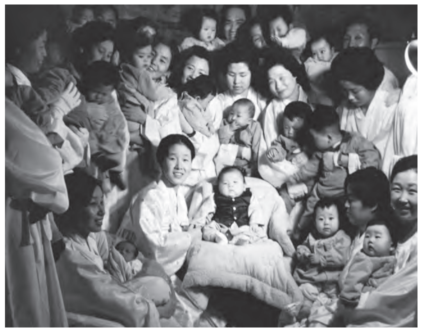
Mother Moon together with Unification Church wives and their young children

When I was pregnant I craved tangerines, but we could not afford them; they were so expensive. One member learned about this, however, and bought some tangerines for me. I ate six or seven of them on the spot. I was so grateful, I cried.