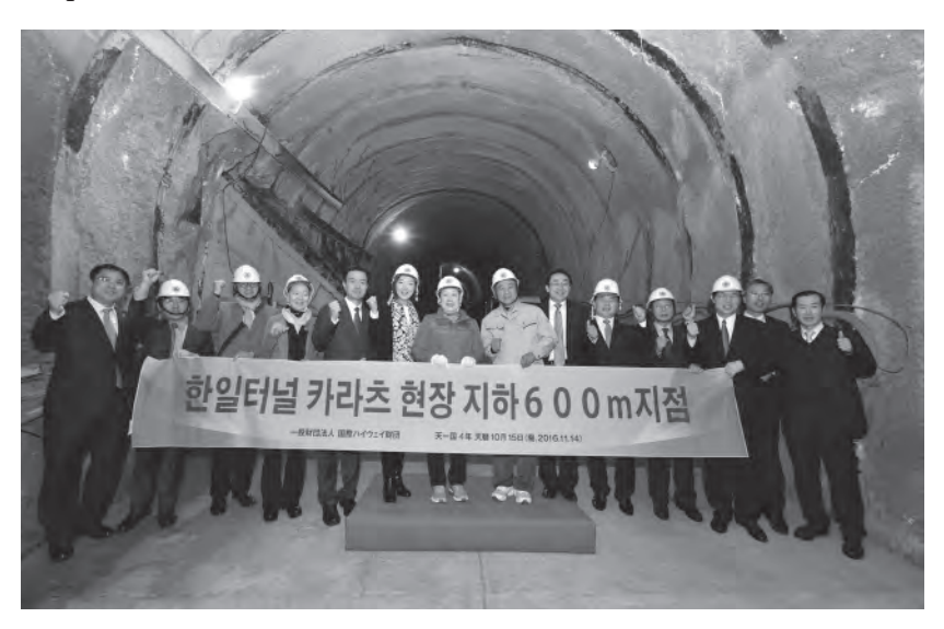
November 14, 2016: At the construction site of a test tunnel built for the Korea-Japan Underwater Tunnel, Karatsu, Kyushu, Japan

That highway would pass through a tunnel connecting Korea's Busan with Karatsu, and there, in 1986, we commenced a pilot tunnel construction. I had long been interested in visiting the site. Finally, in 2016, I had the opportunity to go and see it. During my visit, I renewed our movement's commitment to the peace highway. I believe that the world's peoples are ready for this and that the time is ripe for launching the project based upon a global plan. To tell this story to the world, from the streets to the senate buildings, I had already created an affiliated project, "Peace Road." It consists of public activism publicizing the international highway, and it has turned into a global movement for peace. I'll share more about Peace Road later.