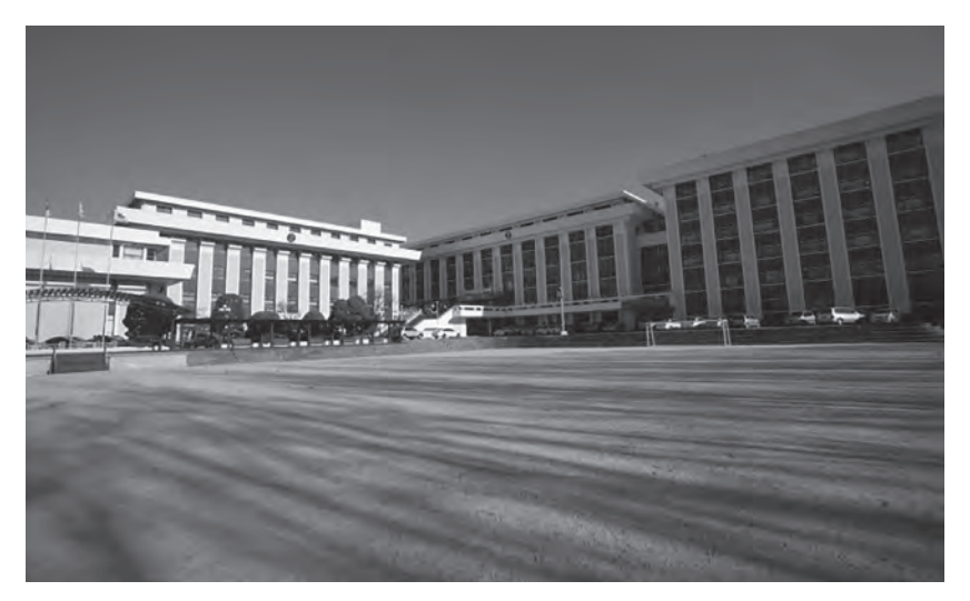
Sunhwa Arts Middle and High School (Seoul)

These schools have produced internationally renowned vocalists and ballerinas. When you leave the school through the main gate, you see a sign engraved with the words, "Gateway to the World."