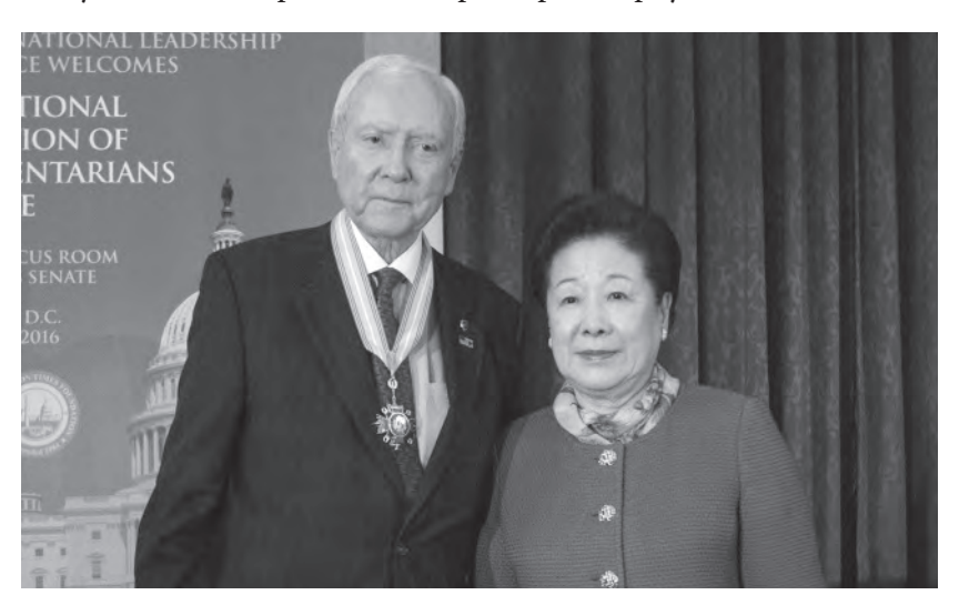
November 30, 2016: Mother Moon with US Senator Orrin Hatch at the United States Capitol

expressed their pleasure at participating in a global event for peace. The words of Hon. Gilbert Bangana, representing the president of the National Assembly of Benin, touched people's hearts: "When I was young, I learned Father and Mother Moon's principles of peace, and today I continue to practice their peace philosophy."