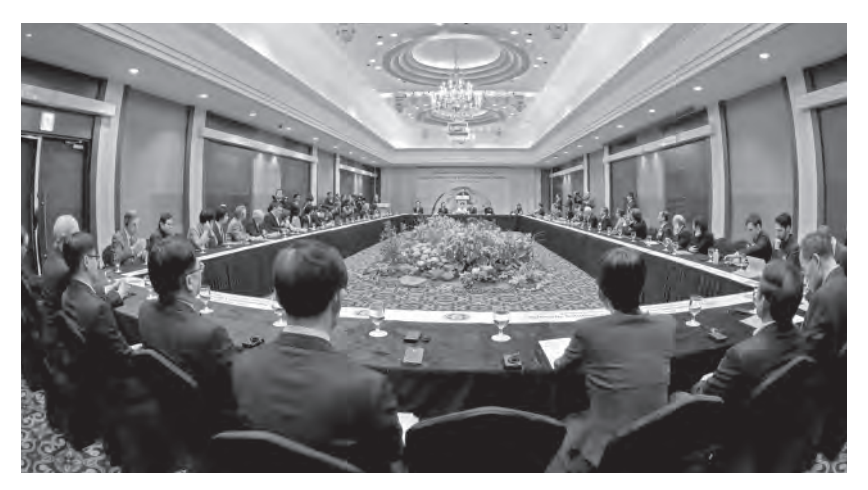
February 23, 2018: The 24th ICUS (Seoul); following a hiatus since the year 2000, ICUS was relaunched with the 23rd ICUS in 2017

We purchased automobile assembly lines in Germany and established automobile factories in China and North Korea. When we saw farmers doing the back-breaking work of sowing rice by hand, we acquired an agricultural machinery factory and supplied them with the equipment they lacked. Looking upward into the sky, we established Korea Times Aviation to support state-of-the-art aviation technology and space engineering. These efforts and more naturally go through ups and downs, but our vision is unchanging. We learn as we go and our investment will continue.