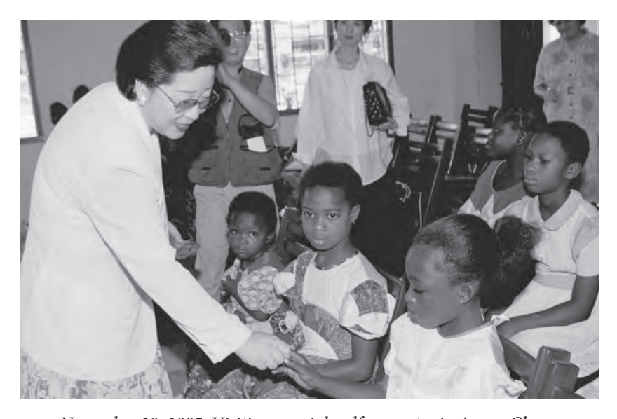
November 18, 1995: Visiting a social welfare center in Accra, Ghana

to give all I have as gifts to those who are working hard day and night for the providence. Just as I did at the Cheongpa-dong Church and the Hannam-dong residence in Seoul, here in Cheongpyeong I open up our closet and give away clothes and shoes when missionaries and guests visit. My husband's shirts and pants, belts and neckties, along with my clothes and accessories, find new owners. When I see the hard-working members, I feel at ease only after giving them something, even if it is small.