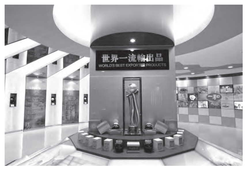
Research and development of Ilhwa Company Ltd,. ginseng products for health

Next, we established the Ilhwa Company Ltd., which pioneered the export of high-quality ginseng products. Ginseng was unknown in the West at the time but now it is a household item. Ilhwa is recognized both for its excellent products and as a leader in ginseng science.