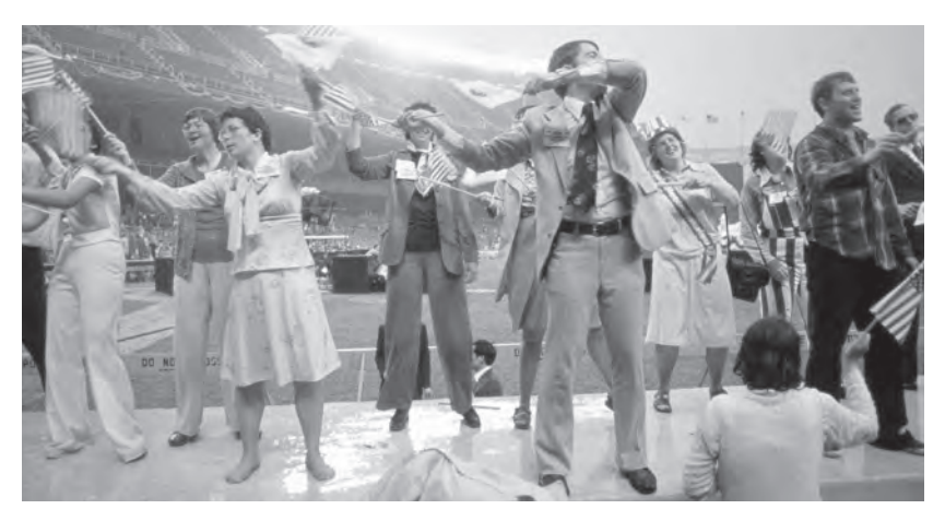
Unification Church members lead the crowd in "You Are My Sunshine," the song that created a miracle

And on that first day of June, others gathered as well. Just as in Korea, where from the right and left, Christians and communists united to accuse and attack, outside Yankee Stadium the demonstrators were