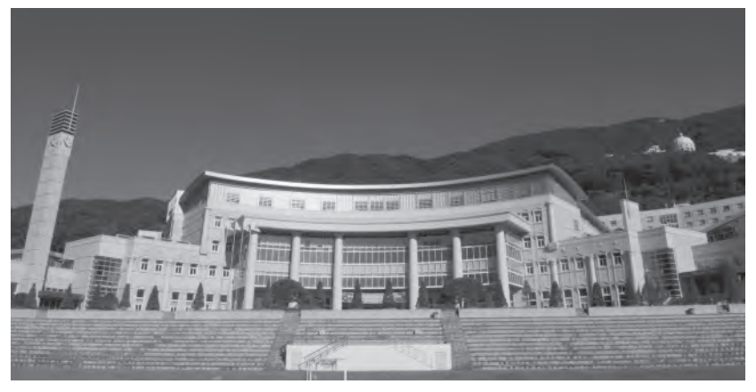
Cheongshim International Middle and High School (Gapyeong-gun, Korea)

CheongShim International Academy, overlooking Cheongpyeong Lake, is another international middle and high school. We invested a