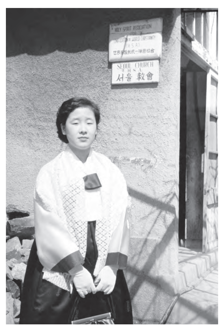
Mother Moon as a young wife, standing in front of her home, the Headquarters Church in Cheongpa-dong, Seoul (1960s)