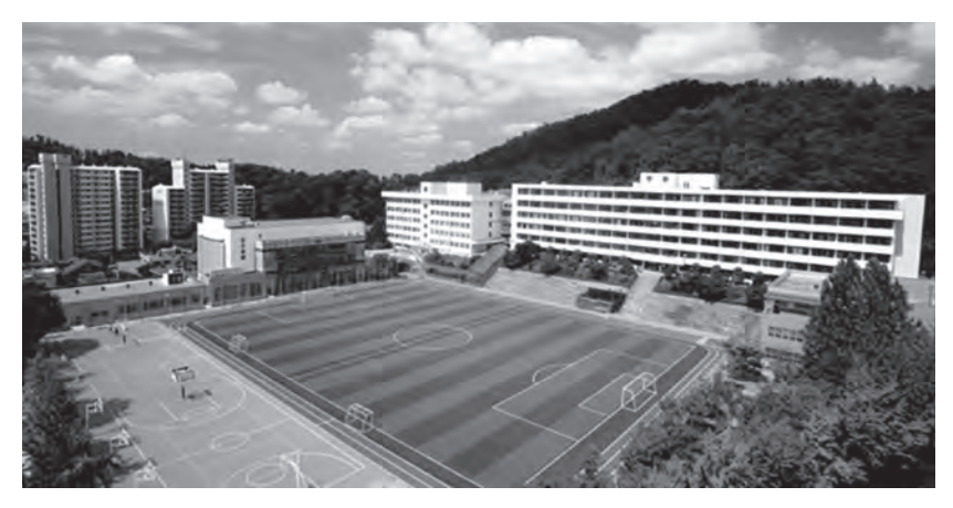
Sunjung Middle and High School, and International Tourism High School (Seoul)

This school is now affiliated with our Sunhak Educational Foundation. Applying our philosophy, it has become an exemplary educational institution. Our foundation includes three other specialized schools. Kyong Bok Elementary School, which opened in 1965, has a proud history and tradition. Sunjung Middle and High School produces competent young people by offering character education based on heart, in addition to excellent academics. These schools have international student bodies living and studying together with the aim of becoming global leaders. Another school, Sunjung International Tourism High School, prepares leaders for the hospitality industry. At that school, every year on National Teachers' Day, we invite teachers who have defected from North Korea to attend our Teachers' Day Event, in preparation for the day when the two Koreas will be reunited.