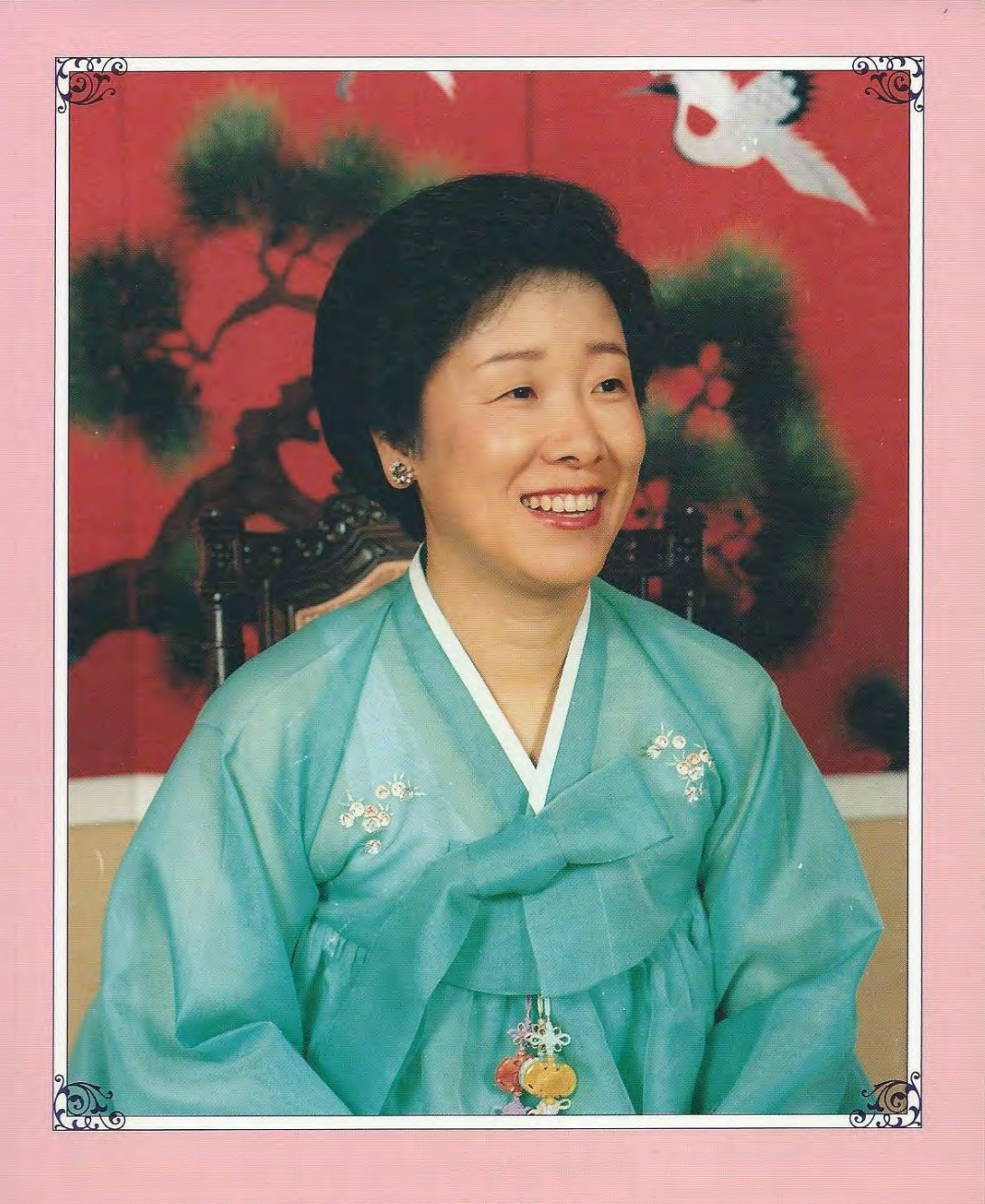
The Heart of True Mother