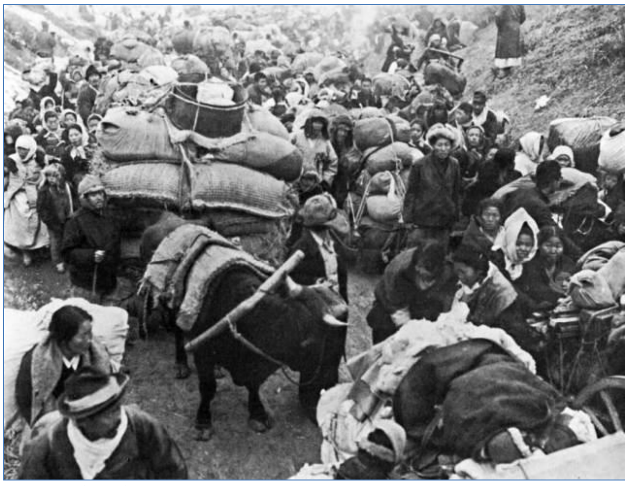
Refugees on the road to Hungnam 1950

Sun Myung Moon Republished by International HQ Mission Office December 10, 2021