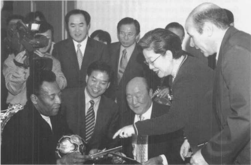
Rev. and Mrs. Moon meet with Pele in a planning meeting for the Peace Cup, which has rapidly become one of the top club competitions in the world