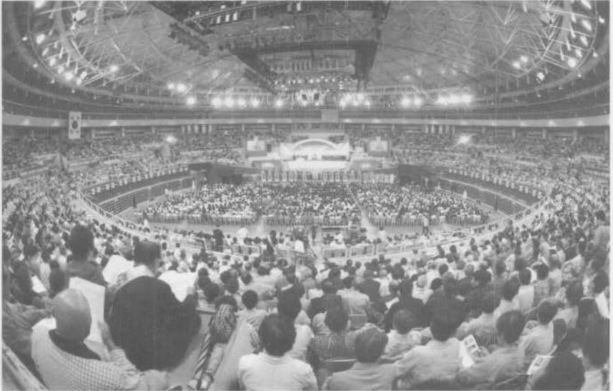
Rev. Moon speaking in Busan during the 2005 Peace Tour on the subject of "God's Ideal Family and the Kingdom of the Peaceful Ideal World," calling for intercultural marriage and interreligious dialogue as the best way forward to reach a world of peace.