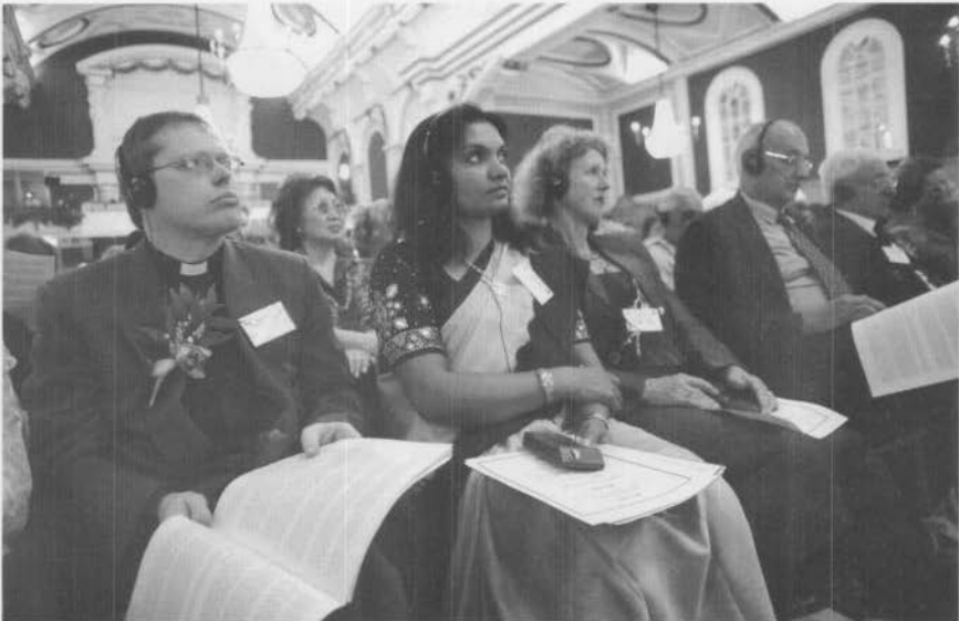
Those who hear the UPF message have commented that it helped them focus on the need for new ways to overcome the barriers and prejudices confronted in daily life.