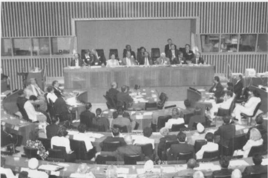
Rev. Moon calls on the United Nations in 2001 to consider establishing an interreligious council and to develop 'peace zones' to reduce global conflict.