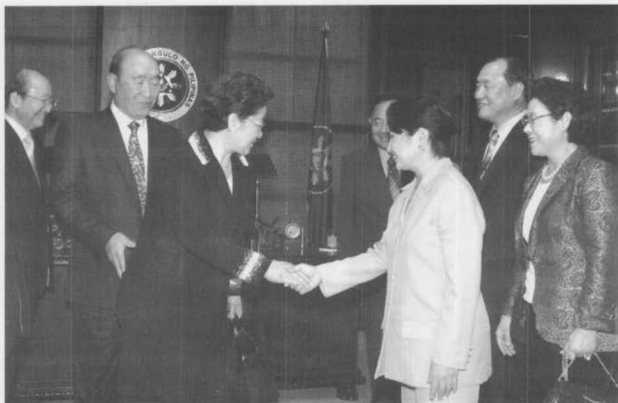
The President of the Philippines, H.E. Gloria Macapagal Arroyo, greeting Rev. and Mrs. Moon on a visit to the Malacanang Presidential Palace in December 2005.