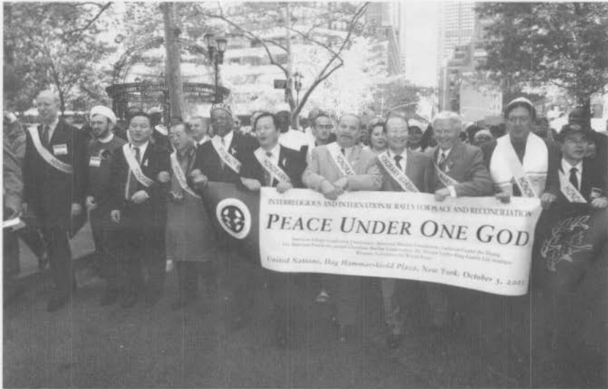
At the Dag Hammarskjöld Plaza near the United Nations headquarters in 2003, religious leaders from many faiths joined a march and rally for "Peace Under One God."