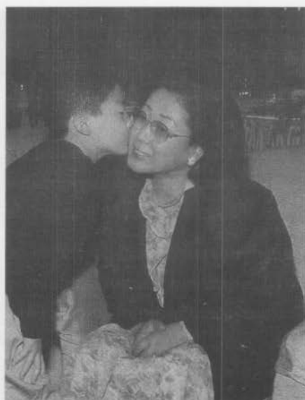
Rev. and Mrs. Moon greet two of their grandchildren'