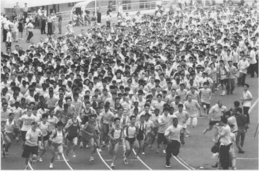
The Interreligious Peace Sports Festival brings young athletes from around the world to develop athletic abilities and build new friendships beyond race, religion and culture.