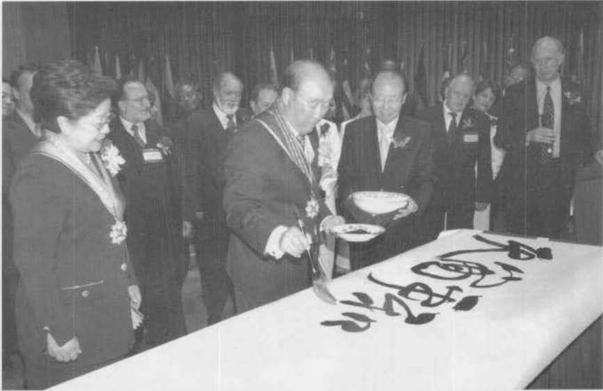
On September 12, 2005, at the Lincoln Center in New York, Rev. Moon announced the inauguration of the Universal Peace Federation with the mission to bring together all nations and religions to 'live for the sake of others.'