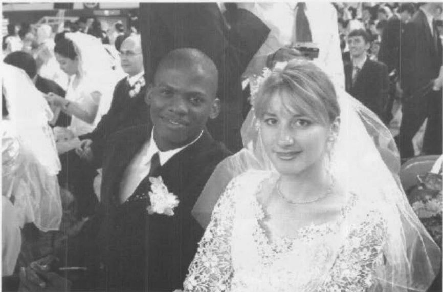
One of the many happy international and interreligious couples Blessed by Rev. and Mrs. Moon