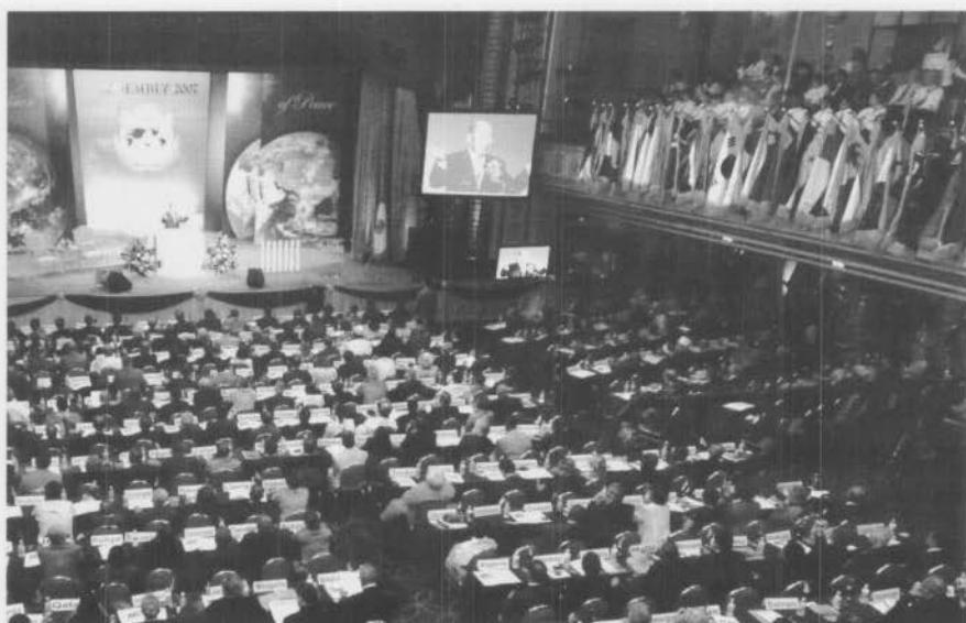
At the Manbattan Center on September 23, 2007, delegates from 194 nations promised to lay the foundations for a new 'Abel' or 'Peace' UN worldwide