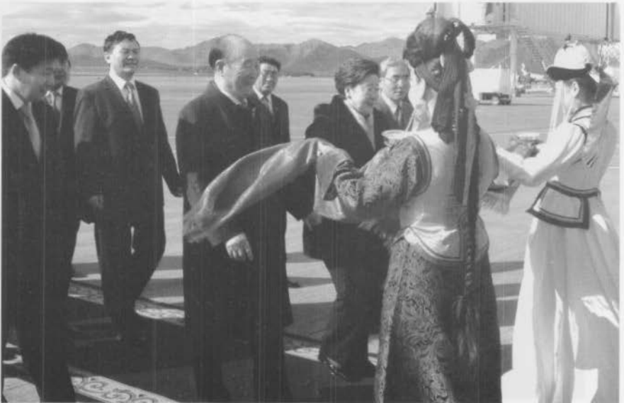
Rev. and Mrs. Moon being welcomed to Ulaanbaatar, Mongolia, with a traditional drink of mare's milk during their 100 city peace tour in 2005.