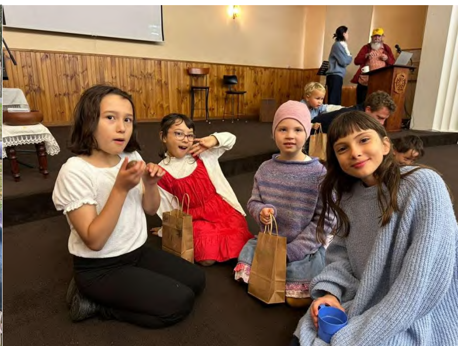
The Easter family event was held at Camp Belgrave, with a total of 64 members in attendance. The Easter story was read to the 2nd and 3rd generation children, followed by planting daffodils together. Finally, an outdoor Easter egg hunt was held. Many members gathered together and shared a joyful and lively time.