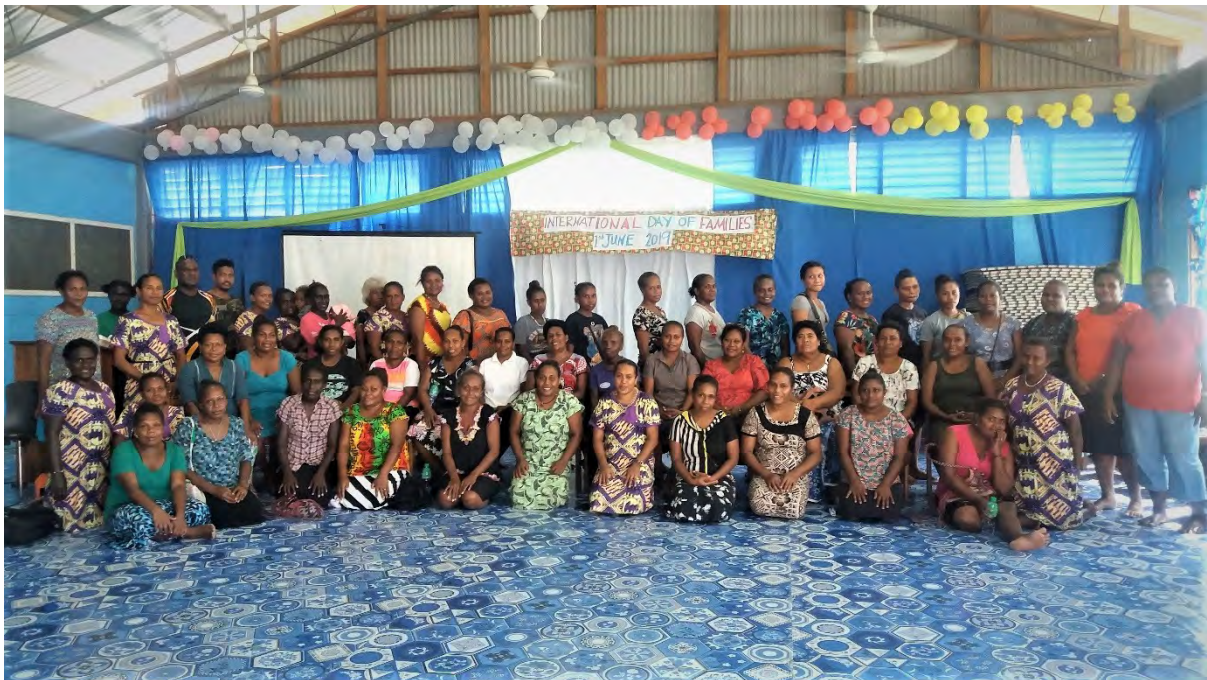
Group Photo of WFWP SI Seminar Participants

Women's Federation World Peace Solomon Islands (WFWP SI) expanded its Global Women's Peace Network (GWPN) during a Community Women Leaders Seminar on 1 st June. The topic theme was: the Family is the School of Love, educate for Character . The event brought 70 participants, both women and men.