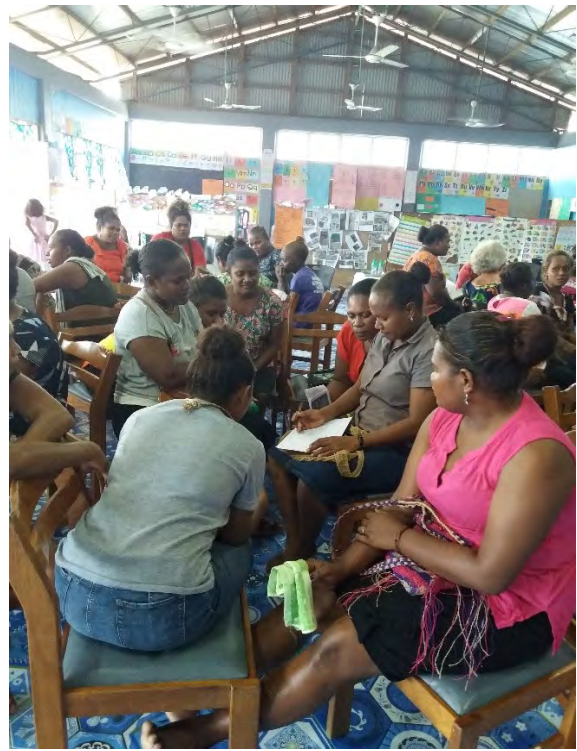
Group discussion on the topic: What are key Social Factors that Affect the Family?